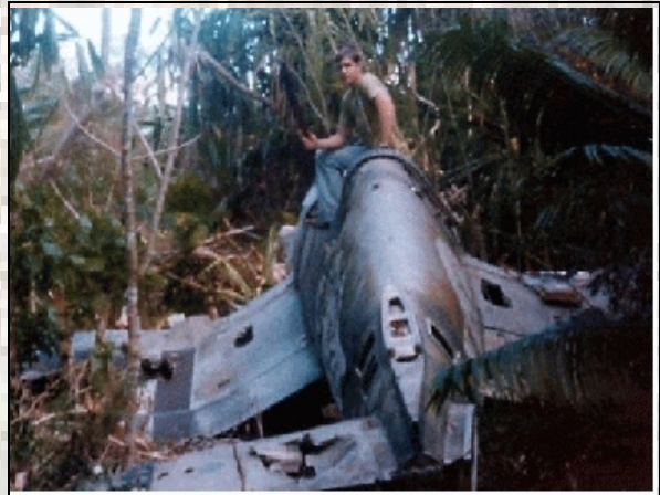
World War II Airplane