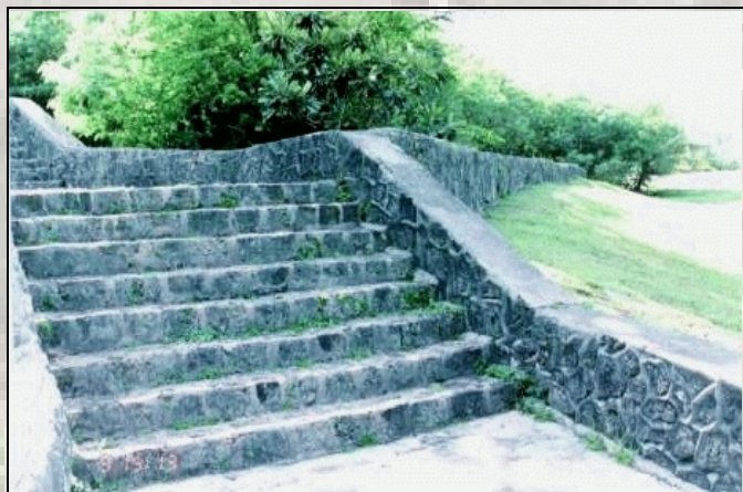
These steps are one of the many masonry construction projects performed by Japanese POW's at Naval Station during World War II.