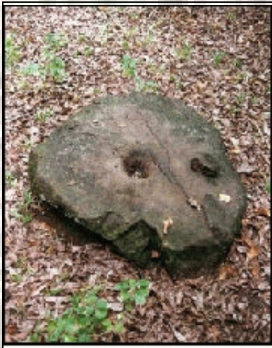
Lusong--used by the Ancient Chamorros as a grinding stone.