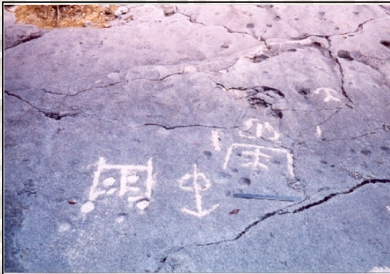
Pictographs at Dangkulo Unai, Tinian

The most significant contribution to the Navy's mission during the past three years has been the completion of numerous cultural resources surveys on the various Navy properties throughout the Mariana Islands. These surveys, and individual cultural resources management plans were conducted in association with the Environmental Impact Statement for Military Training in the Marianas . This EIS has allowed the military to carry out their vital training exercises without impact to the cultural, historic, and environmental resources in the islands.