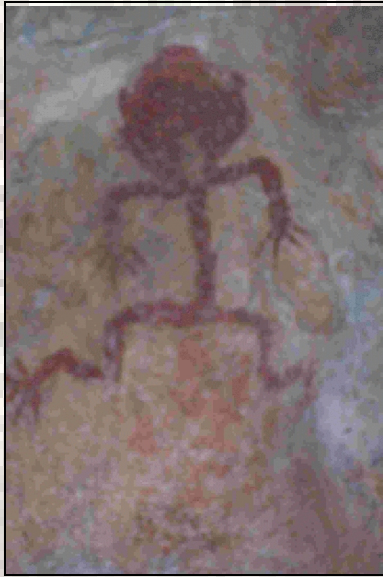
Pictograph "ChukaCabra" on Guam.