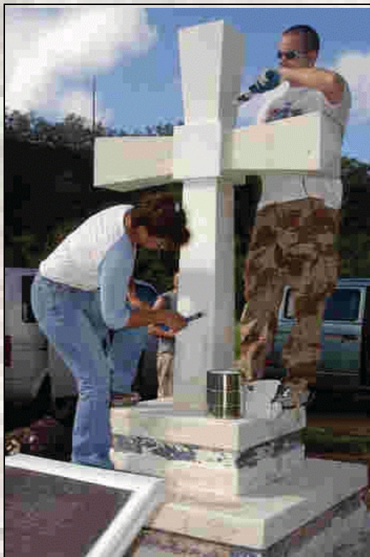
Members of the Administration Department paint the Sumay Point Memorial during Base Enhancement Day, November 2001.