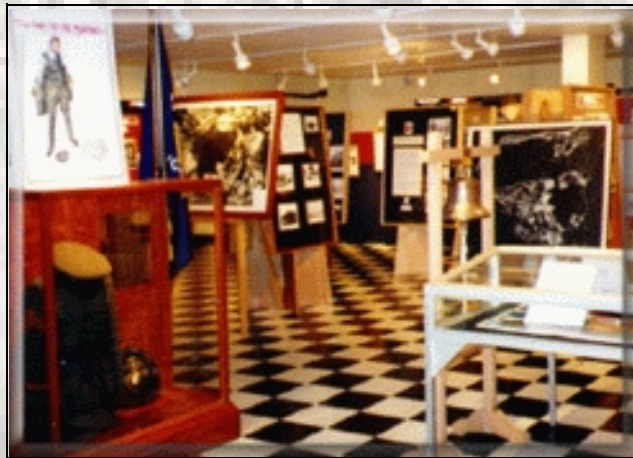
Displays and memorabilia at the "World War II Collections Gallery" – many were donated by Chamorros, Marines, soldiers and sailors, American and Japanese, who fought or served on Guam in the years surrounding World War II.