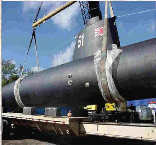
Japanese Midget Attack Submarine being returned to COMNAVMARIANAS after refurbishment.