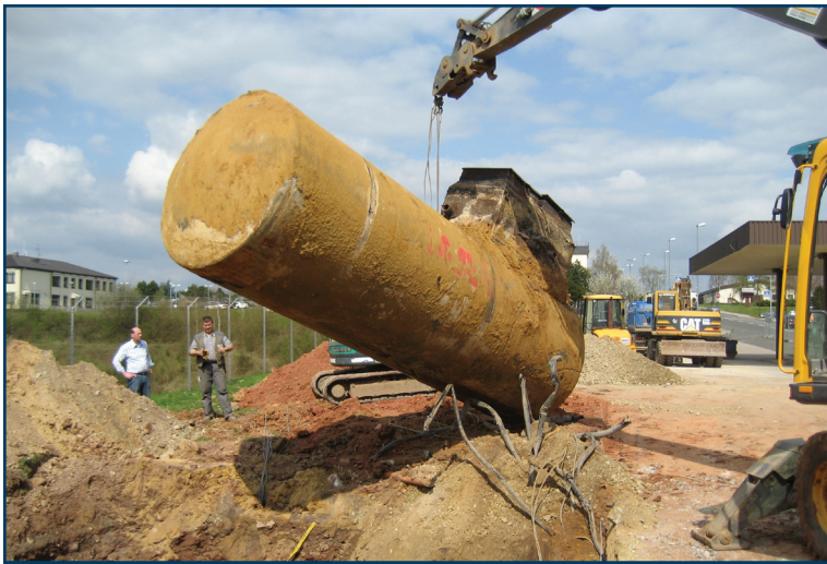
Along with OWS decommissioning, decommissioning fuel tanks reduces maintenance and inspection costs. Removing unused fuel tanks eliminates high risk environmental aspects. It also enables minimal contamination goals to be met.

Additional objectives to eliminate pollution to surface waters include repair and containment of Aerospace Ground Equipment (AGE) and back-up power generators at open storage pads. Eighty containment devices were purchased for AGE/Power-Pro equipment totaling $156,000. Devices are equipped with PETRO-Pipes allowing rain water to drain from placement under equipment. During rain events, PETRO-Pipes filter out clean water eliminating the need to physically drain the berms. This solution closed a major ESOHCAMP finding and an Operational Readiness Inspection (ORI) deficiency. Utilization further eliminates potential for future clean-up sites.