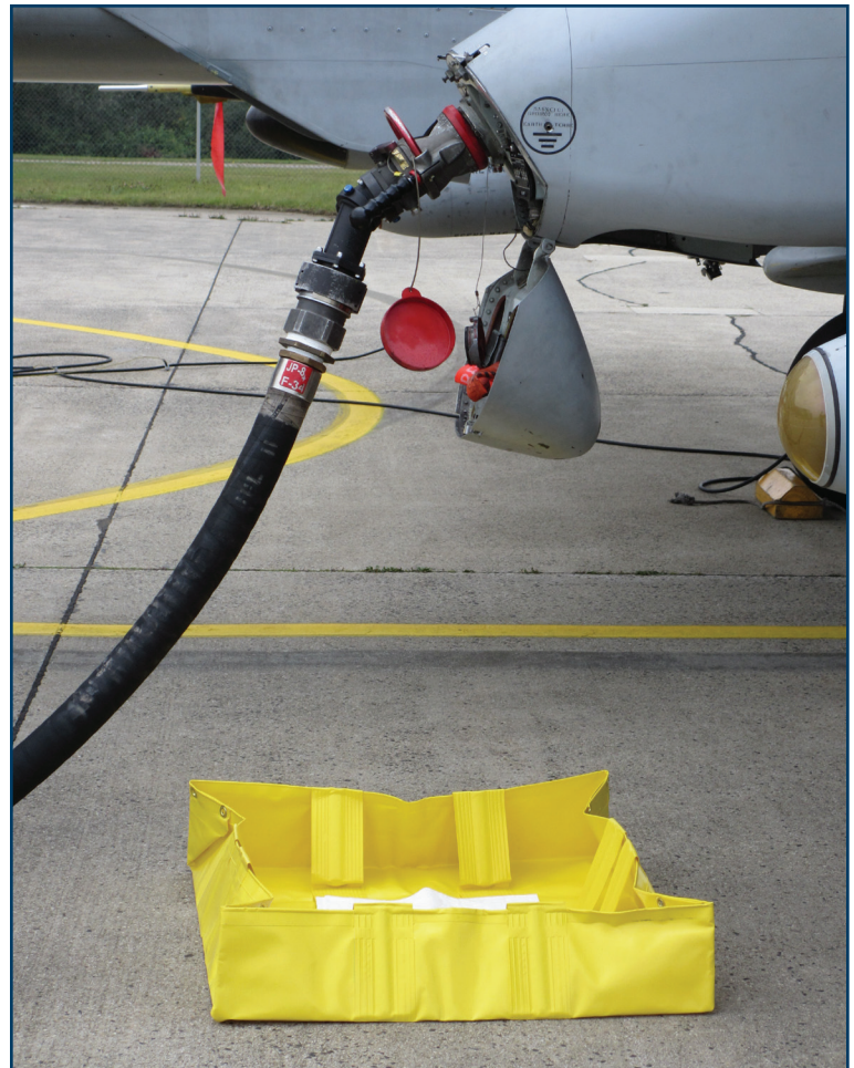
Mobile Spill Berm used during fueling operations creates an impermeable surface. It's a temporary solution while refueling hardstands are under construction. Without the use of these spill berms, it would take the AMUs 1.5 man hours to tow an aircraft one way to approved locations.

The CFT also identified areas to minimize and decrease potential POL spill risk. Sixty of 76 refueling hardstands in front of Hardened Aircraft Shelters (HAS) are permeable due to cracked concrete and degraded joint sealant. Per Air Force regulations and German policies (Water Act and DWA-A 784), refueling/defueling operations of Aircraft on permeable surfaces is prohibited. As repair of existing hardstands continues, Aircraft Maintenance Units (AMUs) are forced to tow aircraft to refurbished HASs every refuel/defuel operation, with an estimated 1.5 man hours per tow. To alleviate excessive manpower requirements, mobile containment devices were purchased and placed under aircraft Single Point Receptacles during fueling operations. Devices act as an impermeable/sealed surface, contain fuel releases while coupling/decoupling hoses, and provide interim fulfillment of Air Force and host nation (HN) regulations until project completion. This solution cuts manpower requirement by 67%, saves approximately $256,000 per year in equipment maintenance and repair, and saves approximately $389,000 on aircraft push-backs and repositioning.