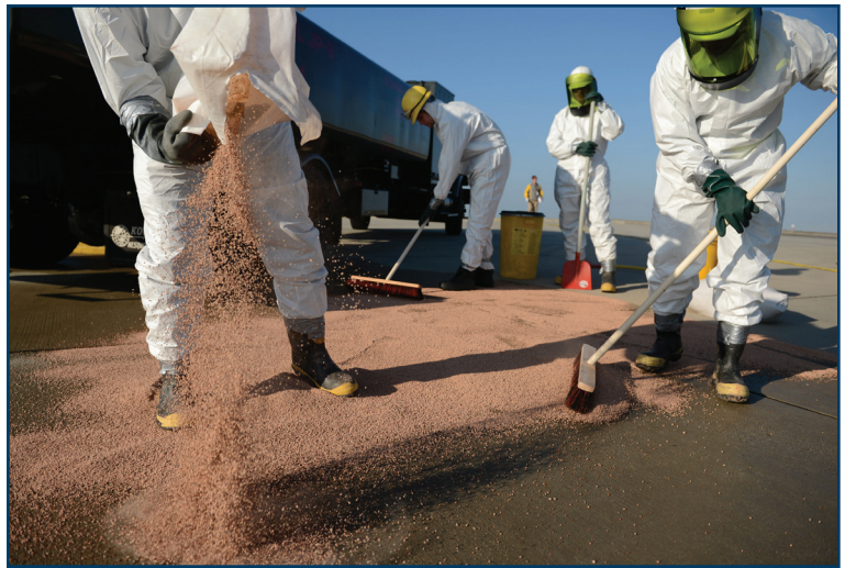
Members of the spill response team showcase their knowledge on Simulated 5,000 gallon fuel spill exercise organized by Sandra Rinder. This yearly training guarantees initial responders will react quickly to minimize impact during an emergency situation. Fuel spills, large or small, contaminate the soul and water.

In addition to infrastructure improvements, Environmental staff completed a 5 year update to the outdated spill plan. A site specific spill plan was implemented in both German and English for 25 high risk locations which resulted in zero HN permit violations. Staff trained 14 shops on drainage areas, OWS, spill kits, and procedures for containment and cleanup of minor spills. United States Air Forces in Europe (USAFE) benchmarked the initiative and contracted training for spill prevention and minor spill response at other installations. Major spill response training is a yearly environmental requirement which is planned and organized with DLA. A one day classroom training course is conducted for all initial response personnel. Topics cover US and German regulations, handling HAZMAT, and proper notification requirements to US and HN authorities. Training increased communication and team cohesion and directly contributed to zero major incidents over the last three years.