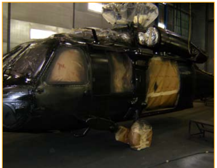
The non-chromium-6 primer painted on this UH 60 Blackhawk helicopter is effective and safer for the environment.

The test program used two different epoxy-based primers. One was a solvent-based product conforming to MIL-PRF-23377 Type I Class N, and the other was a water-reducible product conforming to specification