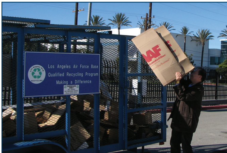
LA AFB's solid waste program takes advantage of the Los Angeles market by selling or diverting nearly all waste. In addition to composting organics, the installation sells recycled cardboard (above), kitchen grease, used batteries, scrap metal, and pallets. In 2011 and 2012, the installation diverted 668 tons of pallets and green waste.

The greatest partnering success for LA AFB's sustainable future brought solar arrays to the installation's privatized housing areas. Working with our housing privatization partner, the Environmental Sustainability team identified key factors to coordinate the installation of a combined 800 kilowatt photovoltaic array across 207 homes. This effort will lock the LA AFB resident utility rate for the next twenty years at a competitive $0.14 per kilowatt-hour and increases the security and predictability of our privatized housing partner's financial health, in turn providing better service to our residents.