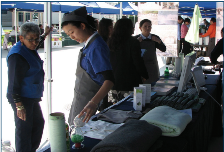
Quarterly outreach events, such as America Recycles Day, provide education to LA AFB's 4,500 personnel. Partnering with over 29 local organizations, LA AFB showcases sustainable practices and technologies, like the blankets and bags made from recycled materials shown above. These events also provide e-waste recycling and Rideshare assistance to base personnel.

In addition to the dining furnishings previously discussed, the LA AFB Environmental Sustainability team strives to find additional opportunities to win compliance through education. Partnering with 29 local vendors and non-profit organizations, the team hosts events such as Bike to Work Day, Earth Day, Composting Day, and America Recycles Day, and keeps our 4,500 personnel mindful of the Air Force's commitment to sustainability.