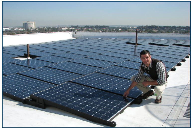
The recently energized 320 kilowatt solar array spans the rooftops of the three major facilities on base. The addition of these arrays increased LA AFB's solar production to over 800 kilowatts. These panels provide power equal to the demand of the base fitness center, saving $100,000 in annual utility costs.

The team advanced the base's commitment to solar energy with the installation of a 320 kilowatt solar array across the rooftops of LA AFB's three major facilities. Expanding on the previously installed 380-kilowatt array on our parking canopies, this $1.5 million project generates enough power to offset the energy consumption of the base fitness center, reducing the total energy usage of LA AFB by 1%. Furthermore, the project saves the installation $100,000 in annual utility costs.