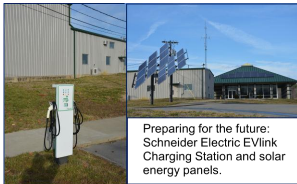
Preparing for the future: Schneider Electric EVlink Charging Station and solar energy panels.

In November 2012, Wendell H. Ford Regional Training Center (WHFRTC) was certified as a Renewable Energy Generator through the utilization of 622 kilowatts (kW) of Photovoltaic (PV, aka Solar) across both the training and cantonment areas, ensuring Soldiers have power available for all many types of solar PV panels, solar (active and passive), charging stations installation of these the impact from facilities, but has native habitat eliminating nearly 3 systems to support