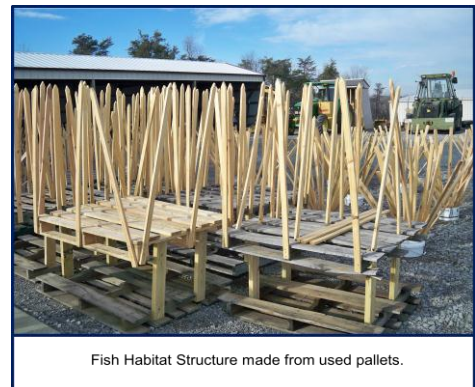
Fish Habitat Structure made from used pallets.