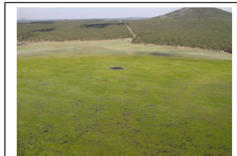
Above is Roger’s Lake, adjacent to Camp Navajo. A 20-agency ACUB partnership is protecting the 2250 acres from being developed. Preventing encroachment is crucial to the AZARNG’s military mission.