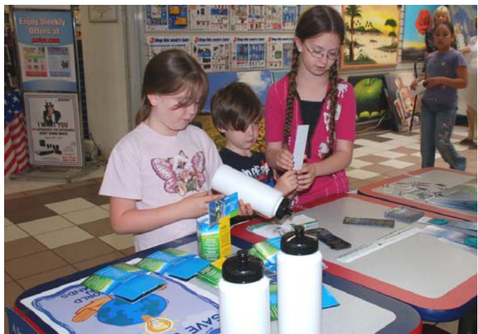
Visitors to the Energy Awareness booth received energy-related information, handouts and giveaways.

To spread the knowledge on this critical subject, many activities are undertaken by the Garrison each October during Energy Awareness Month. They include banners and posters displayed in highly visible places, articles in the community newspaper, and an information booth at the PX. Commercials