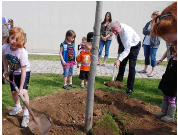
USAG Vicenza Deputy Garrison Commander plants a tree with the DoDDS students