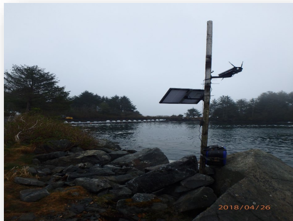
Photo 7: Internet-connected wireless remote camera used to monitor work progress, weather, and tides. This camera was available to the contractor and government 24 hours-a-day, 7 days-a-week.

Collaborated with Bureau of Land Management, State Department of Natural Resources, State Department of Environmental Conservation, Coast Guard, and a local non-profit trail association, which resulted in smooth project operations and positive community support. Monitored remote site progress, weather and tidal cycles using wireless camera technology available 24/7 via the Internet. This system enhanced the state regulator's ability to identify potential concerns and added confidence to the best management practices being utilized to prevent sediment and pollutants from entering the intertidal area of Sitka Sound. Promoted site restoration. The remediation activities were effective in protecting, enhancing, and restoring the environment. Contaminated landfill material was completely removed to bedrock, a rock breakwater was constructed to protect the upland area from future shoreline erosion, and clean gravel from the temporary dike construction was reutilized to resurface and repair damage to the pre-existing hiking trail system that had been caused by the cleanup effort.