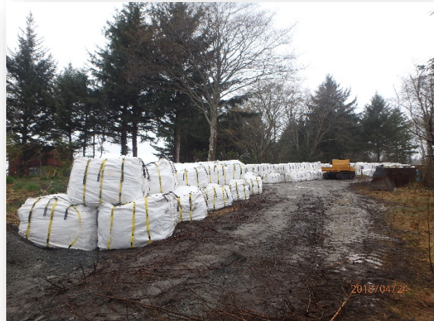
Photo 5: Fort Rousseau FUDS. Bulk bags staged on Virublennoi Island prior to loading on the barge for transport to Seattle. (2018, A. Shewman)