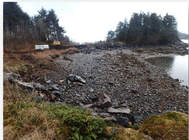
Photo 1: Low tide at the Fort Rousseau Landfill at the beginning of the environmental remediation contract. The first lift of contaminated soil is being removed. (2018, A. Shewman)