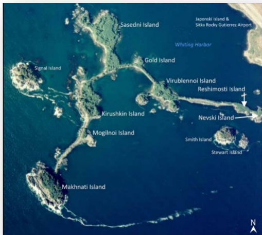
Figure 2: Fort Rousseau FUDS. The Fort Rousseau Landfill is located on Virublennoi Island near Sitka, Alaska. (2012, AK Department of Natural Resources)

The Fort Rousseau FUDS is located west of Japonski Island in Sitka, Alaska (Figures 1 and 2). The site is comprised of eight islands connected by a causeway and encompasses approximately 65 acres of land located immediately west of the Sitka airport. The uplands are managed by the Alaska Department of Natural Resources – Division of Parks and Outdoor Recreation (ADNR-DPOR) and the intertidal areas are managed by the Bureau of Land Management (BLM). The islands were chosen as military