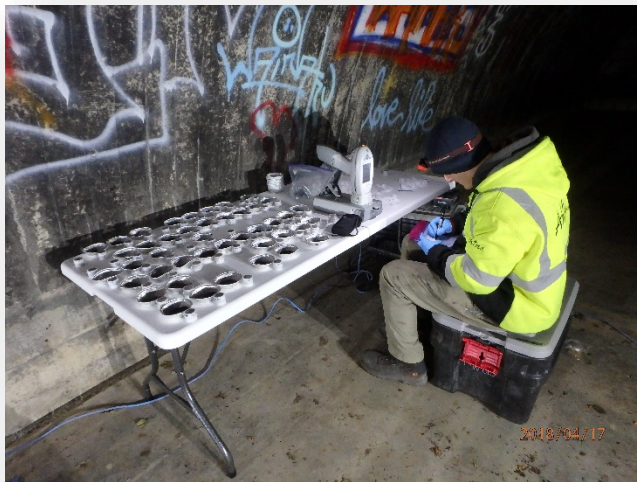
Photo 3: Analyzing lead soil XRF samples. Each sample had to be dried, ground, and analyzed with the XRF instrument to give environmental engineers critical screening data during excavation operations. (2018, A. Shewman)

to observe the progress of site activities and real time weather/tidal conditions 24 hours/day. This system enhanced the state regulator’s ability to identify potential concerns and added confidence to the best management practices being utilized to prevent sediment and pollutants from entering the intertidal area of Sitka Sound. The USACE project delivery team accessed the camera website to verify site conditions, marine visibility and weather, tidal cycles, construction equipment movement and waste handling.