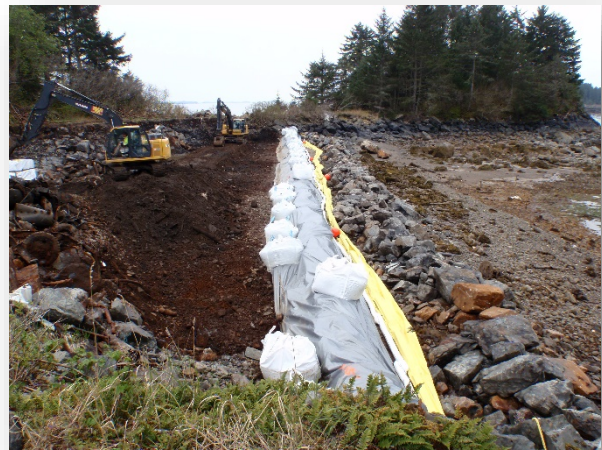
Photo 2: Temporary dike and rock wall at the Fort Rousseau Landfill. The purpose of the dike was to keep the tidewater from entering the excavation. (2018, W. Mangano)