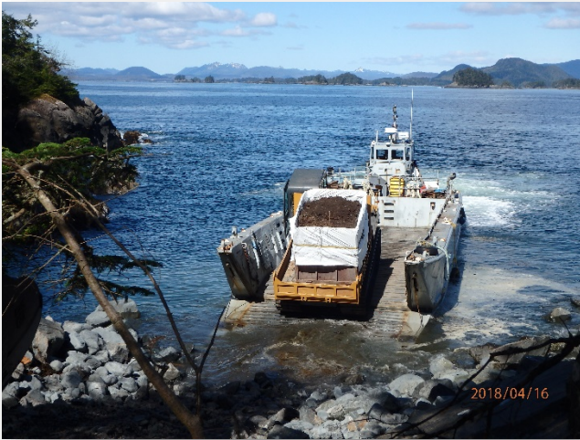
Photo 4: A tracked dump truck called a Marooka is loaded with contaminated soil. In the back of the Marooka is a 5-cubic yard bulk bag. The Marooka is being transported via a landing craft to another island. (2018, A. Shewman)