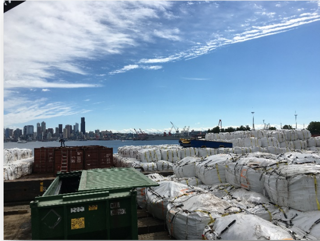
Photo 6: 5-Cubic yard bulk bags in staged in Seattle, Washington with Fort Rousseau contaminated soil. Bags transferred to the rail system for transportation to the Columbia Ridge Landfill in Arlington, Oregon.

During the 2018 field season, the remedial action consisted of excavation, transportation, and disposal of 933 tons of hazardous waste and 5,157 tons of non-hazardous waste. Other items removed include 317 pounds of electronic equipment, 168 pounds of broken lead-acid battery plates, and approximately 133 tons of steel. The steel was recycled upon arrival in Seattle.