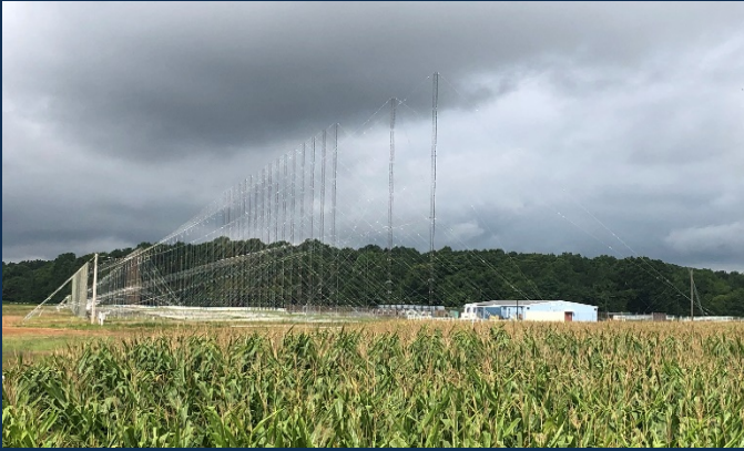
Transmitter antenna-array and agriculture crop at ROTH New Kent, Virginia.

Additionally, monitoring and technical assistance efforts at ROTH New Kent continued to ensure farming practices at the 186-acre agricultural crop out lease were in accordance with VA Department of Conservation Resources Soil and Water Conservation Plan requirements. This agricultural out lease reinforces the natural buffers created to enable FSSC operations without encroachment while also generating revenue to offset the costs of other land lease agreements and funds for minor land improvements.