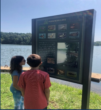
Interpretative nature trail signage at CAX's Penniman Lake

Spotted-Fever, effecting VA and military training.