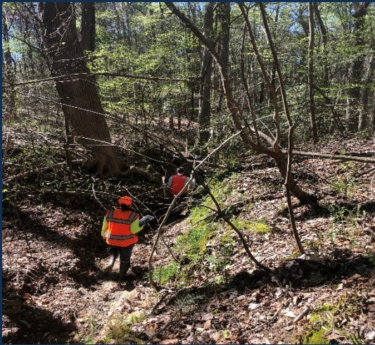
VDOT EV contracts performing stream bank erosion hazard index surveys onboard the station.

The station has made great progress towards developing cooperative agreements in support of the INRMP. On 29 Sept 2020, a cooperative agreement between NAVFAC MIDLANT and the VA Institute of Marine Sciences (VIMS) was developed to support an INRMP project requirement for nearshore conservation and stewardship. This marked the first Sikes Act cooperative agreement for the station in over three decades. Two additional cooperative agreements are under development with VA Department of Transportation for stream stabilization and restoration activities and prescribe burn operations and assistance with the VA Department of Forestry.