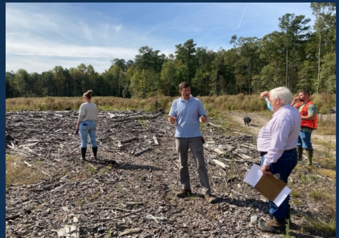
implementation in support of magazine recapitalization project on the station.