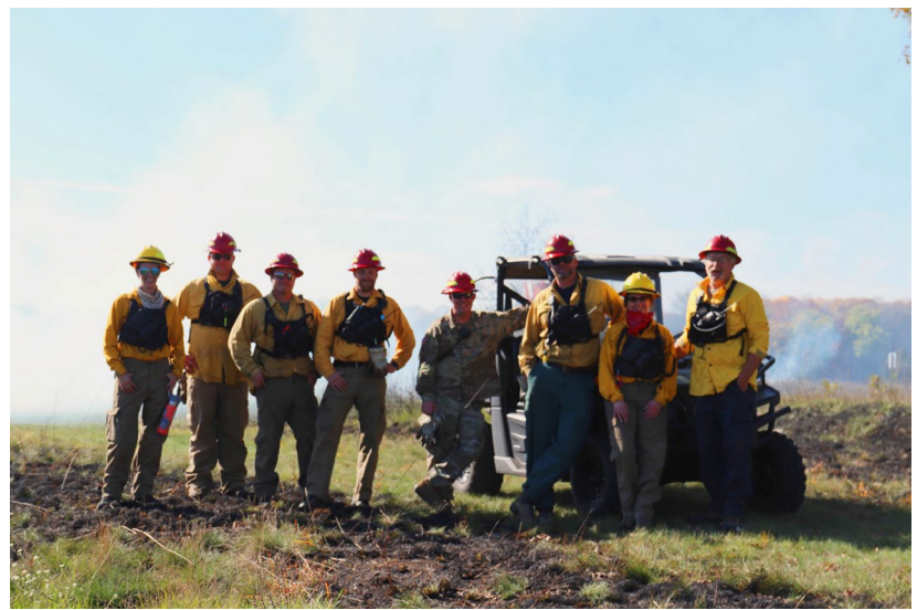
Many native plant communities at Camp Ripley are comprised of fire dependent species. ITAM staff identify training areas and rotations for prescribed fire activities, with Environmental and DPW staff taking the lead on actual application. In all, the NRC program manages around 14,000 acres of the installation with prescribed fire each year to reduce hazardous fuel loads.

While working with the bat program managers, NRC staff learned they were also funding a project to conduct eDNA surveys for turtles. The project team broadened their current study to include Camp Ripley. Already, the installation monitors Blanding’s turtles, a state-threatened species, using transmitters to track hatchlings and collect data on habitat use, survival rates,