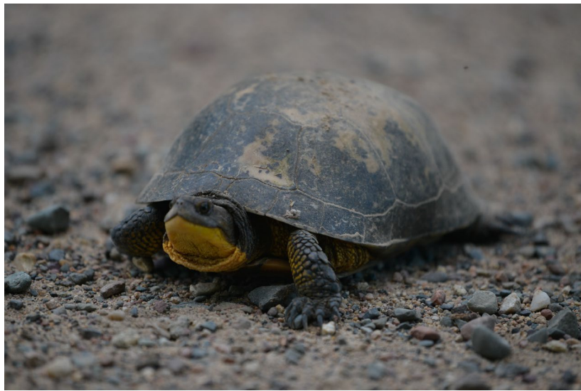
Camp Ripley took part in an Environmental DNA (eDNA) study of turtles. This study enhances ongoing efforts of Blanding's turtle conservation.

distances travelled, and more. Nests are also monitored each spring and protected from predators and traffic. The eDNA survey is enhancing these efforts, determining presence and absence of turtle species in Camp Ripley's waterways and ponds. With this information, the NRC program will be even better positioned to identify and preserve habitat now in use by turtles.