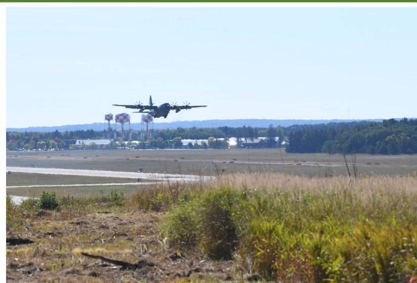
The NRC program undertakings are designed to enhance both conservation and training lands, consistently demonstrating the compatibility of stewardship and mission. Such was the case when an airfield assessment deemed the runways out of compliance, leading to a clear-cut and replanting project.

While all of the NRC program undertakings are designed to enhance both conservation and training lands, consistently demonstrating the compatibility of stewardship and mission, they have also launched several new initiatives over the past two years with immediate benefits to the MNARNG’s training capabilities. During an airfield assessment this year, for example,