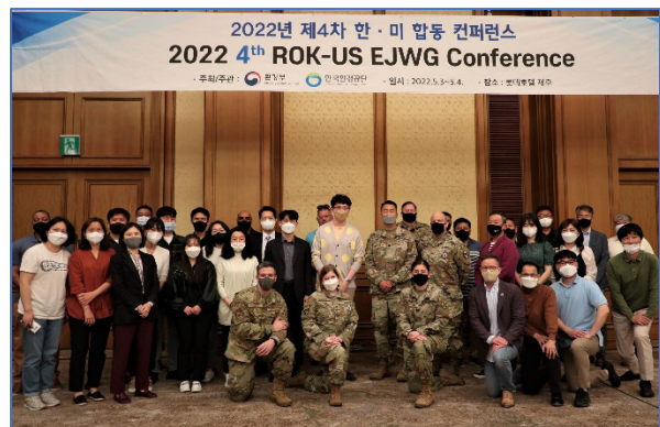
2022 Republic of Korea-U.S. EJWG Conference Osan AB represented the 7th Air Force at the EJWG that works to build trust between USFK and the ROK.

Lastly, Osan AB was selected to represent the 7th Air Force at the Environmental Joint Working Group (EJWG) hosted by USFK’s Environmental Policy Division and ROK’s Ministry of Defense (MND) and MOE. Osan AB used this opportunity to collaborate with Host Nation partners and build a foundation of trust, by communicating how the Air Force manages various environmental programs and its guiding principles, as a result Osan AB was selected by USFK to host a delegation of MOE and MND to showcase how USFK installations manages its environmental programs. USFK credits the timely transfer of five, previously stalled, mission critical land parcels, to the transparency and trust built by the EJWG and Osan AB, thereby enhancing the U.S.-ROK alliance and the Indo-Pacific Command Mission.