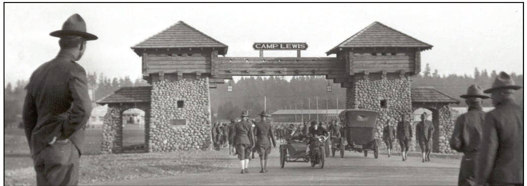
(Photos: The garrison gate after completion in 1917, above, and the same gate, below, in 2010.)

In June of 2017 Fort Lewis, WA will be 100 years old. In preparation for the Army garrison's 100th year anniversary, rehabilitation projects have begun with the aim to provide needed soldier service facilities, offices, and classroom space, as well as to enhance the integrity of the garrison's historic properties.