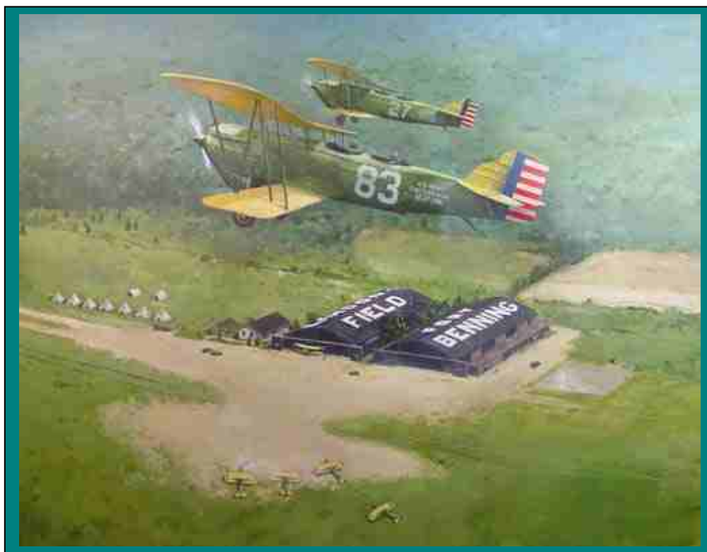
Lawson Army Airfield, Fort Benning, Artist Concept for 1931