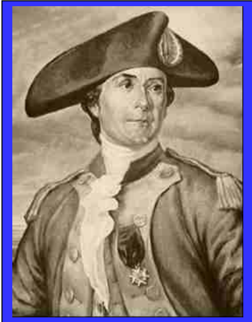
Portrait of John Paul Jones.