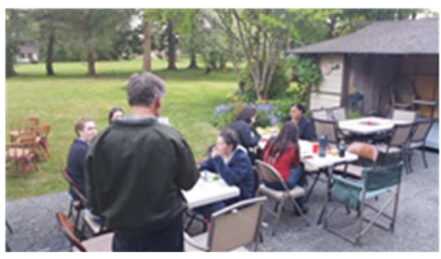
Above: Navy personnel enjoy a cookout after the workshop.

were established, leaving everyone sad to see the conference conclude. To preserve the momentum, the meeting leaders developed a website with lecture notes and presentation slides. The topics of discussion are seeding new projects across the Navy and the success of this event has solidified command support for a 2018 meeting at the Portsmouth Naval Shipyard.