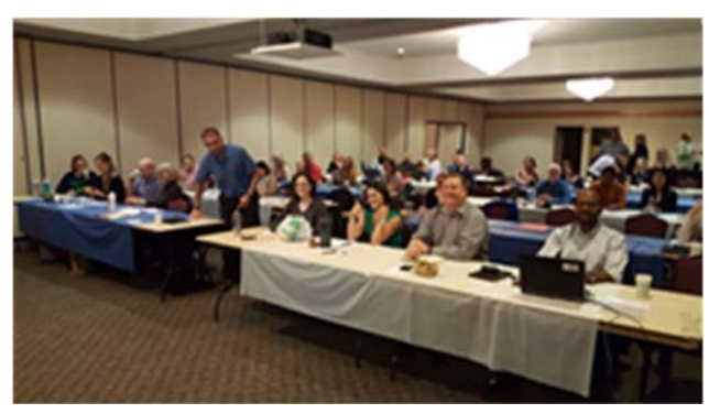
Above: Navy cultural resources personnel engage in discussion during the workshop.