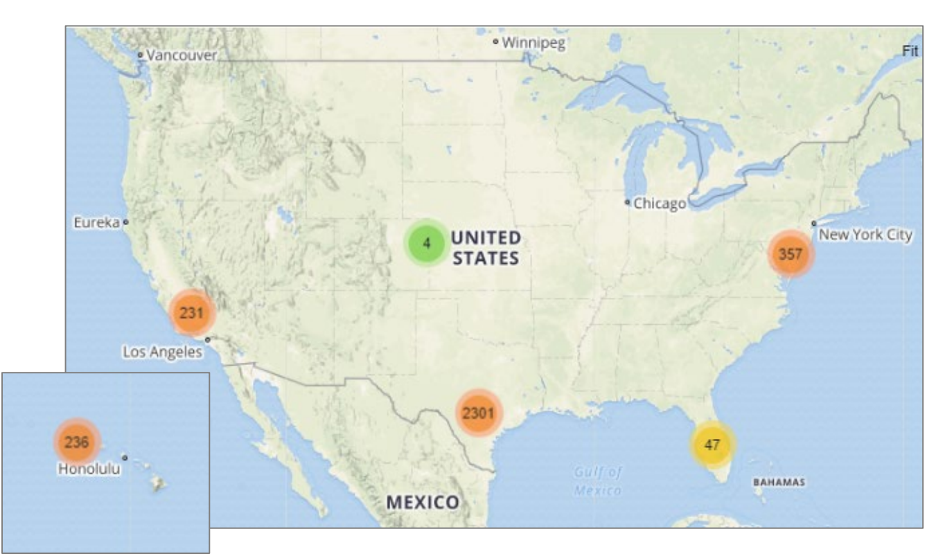
Figure 1. Schematic Map Showing the General Spatial Distribution and Numbers of Documents and other Digital Files for the AF Digital Archive in tDAR as of 2018

The pilot project created a digital archive in tDAR for the AF archaeological and cultural heritage data with sub-collections for each of the three bases, which provide organization, reliable access, and sustainable long-term preservation for their data (<u>https://core.tdar.org/collection/16304/us-air-force-archaeology-and-cultural-resources-archive</u>). Since the initial work was completed, over 20 additional installations, some of them parts of Joint Bases, have partnered with Digital Antiquity to create digital archives. Figure 1 schematically displays the distribution and quantities of the AF digital records in tDAR across the US.