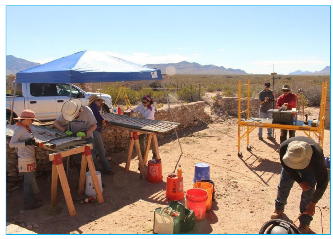
Crew working on restoration of porch railings at the McDonald Ranch House on WSMR.

The CESU Network has completed multiple cultural resources projects for the DoD. For example, in 2017, the U.S. Army Garrison White Sands Missile Range (WSMR) funded a project with the Cornerstones Community Partnerships, a nonprofit CESU partner specializing in preserving architectural heritage. Cornerstones provides hands-on workshops and training for local youth and adults to sustain historic structures and strengthen cultural values. The historic McDonald Ranch house on WSMR required much needed restoration, and Cornerstones helped restore it by executing the drainage plan, window reconstruction, ramp and porch reconstruction, and stucco and wall repair. This collaboration helped to preserve historic structures and address maintenance backlog.