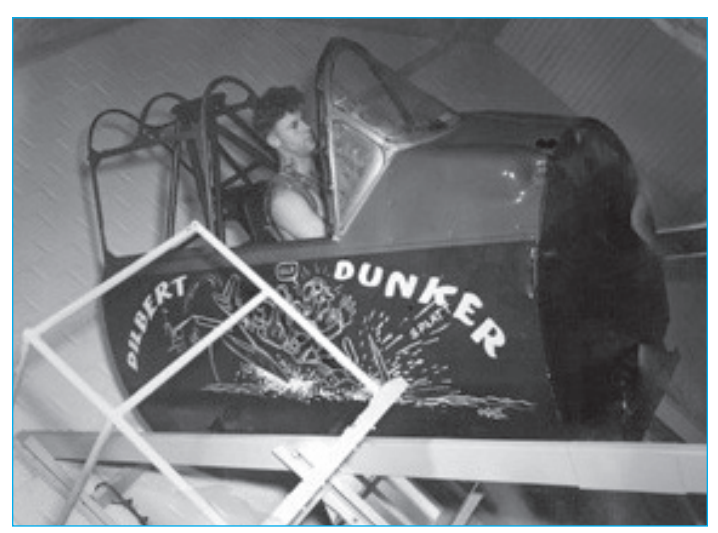
Dilbert Dunker, Naval Air Station (NAS) Pensacola.

Outdoor Training Areas. These outdoor spaces could include tactical instrument training courses, aerial fighting ranges and targets, bombing ranges, aircraft carrier landing deck simulators, and catapults.