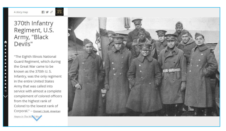
Story Map of 370th Infantry Regiment.

Heritage Documentation Programs, George Washington Memorial Parkway, and the CRGIS recently authored a Story Map describing the ongoing rehabilitation at Arlington Memorial Bridge. This Story Map explains the history of the bridge, the importance of it as a memorial, as well as its unique construction. The partners used the Memorial Bridge Story Map as mitigation under Section 106 as it provides the public with readily available information about the bridge and the ongoing repair, documenting the removal of historic features and replacement of character defining elements.