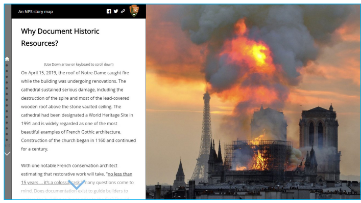
Story Map of "Why Document Historic Resources?"

With their incredibly flexible format, Story Maps can present simple reports or very in-depth histories about cultural resources. This tool leaves the user in control of how much they would like to include in their story. Users have options to research outside links, data sources, reference materials, or additional resources when exploring a topic and creating a story. This adaptability makes Story Maps a powerful alternative for mitigation, interpretation, and creative story telling.