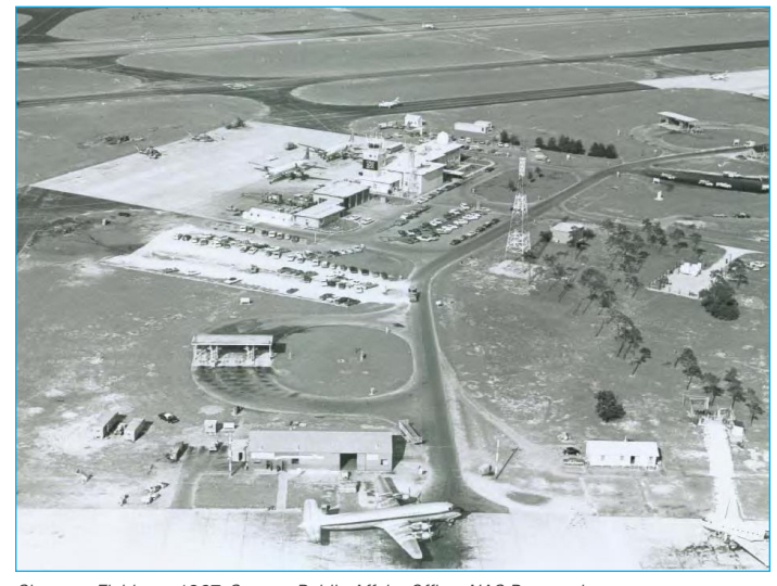
Sherman Field, ca. 1967.

Support Facilities. These facilities could include structures built or renovated in response to an influx of pilot and air support personnel. Examples of these building types include housing, headquarters and offices, recreation facilities, and flight line facilities.