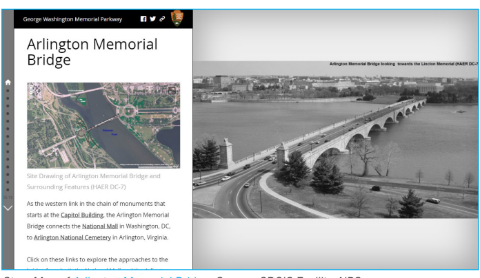
Story Map of Arlington Memorial Bridge.

Users can quickly produce Story Maps and address timely subjects. Simpler versions allow users to make very direct statements, such as the Story Map that Cultural Resource GIS Facility (CRGIS) authored to discuss why the documentation of cultural resources is critical in the wake of the burning of Notre Dame Cathedral. This Story Map showed not only a collection of well-known cultural resources destroyed by fire, flood, hurricane, or other man-made disasters, but also how people could use previous documentation to restore or rebuild historic structures.