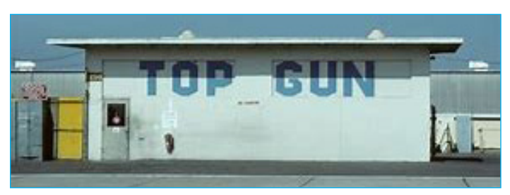
Top Gun Trailer at NAS Miramar.

The Legacy 17-835A, Pilot and Air Support Training on U.S. Military Installations report is on DENIX at: https://www.denix.osd.mil/cr/historic/vietnam-war/vietnam-war-historic-context/report/.