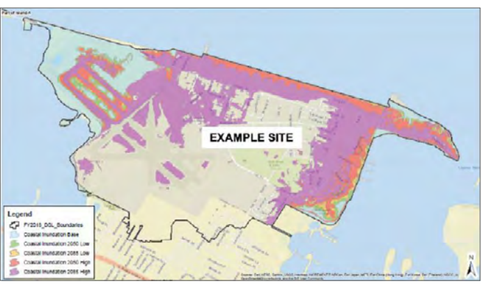
GIS shapefiles are available for local, installation-level mapping of coastal and riverine flooding. The maps provide viewers with the percent of installation area inundated.

The DCAT will generate reports at the Military Department or installation level to help DoD understand and manage exposure from climate-related hazards. The tool