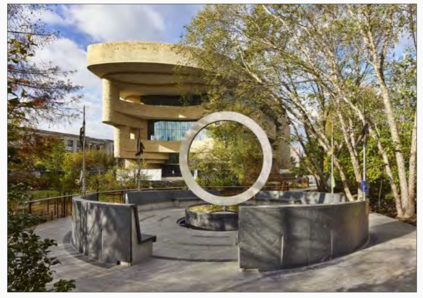
National Native American Veterans Memorial.

To learn more about the exhibit, please visit the exhibit's webpage at https://americanindian.si.edu/why-we-serve/.