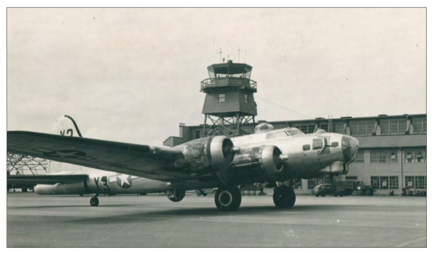
Hanger T-20 with the Crow's Nest in the foreground and a B17 airplane on the apron, 1944.

Home to the 598th Range Squadron, the range needs to make continual improvements to its existing airfield infrastructure. Infrastructure updates have recently necessitated the removal of remnants of the range's very first hangar — one of the original buildings constructed in 1942.