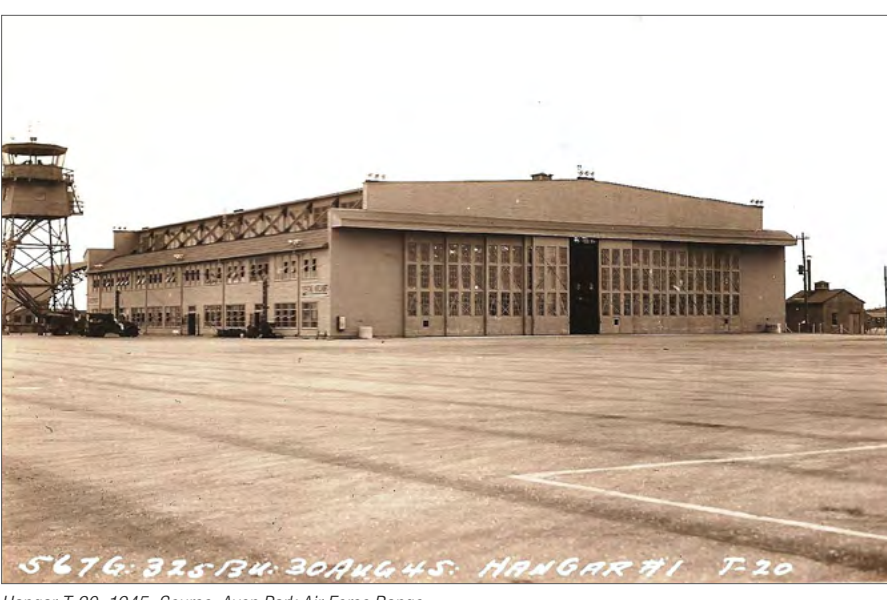
Hangar T-20, 1945.

Hangar T-20 was built in late 1942 by Stevens & Sipple Designers-Builders of Orlando under the oversight of Major R. R. Riggins of USACE. The total cost of Hangar T-20 construction was $159,155. Hangar T-20 was a Base Engineer Maintenance & Inspection (BEMI) hangar with a standardized plan designed by USACE. The BEMI was among the first standard hangars of World War II and was innovative for its time. With its long axis oriented northsouth, the hangar space measured 120 feet wide. Its measurements reflected the increase of standard hangar width from 110 feet to 120 feet to accommodate the increased wingspans of aircraft. Hangar T-20 measured 162 feet wide by 202 feet long. The hangar had a lowpitched gable roof with prominent stepped parapets. Two-story, shed-roofed annexes for offices and workshop spaces flanked the hangar space. The side facades of the structure featured tongue-and-groove siding and wood