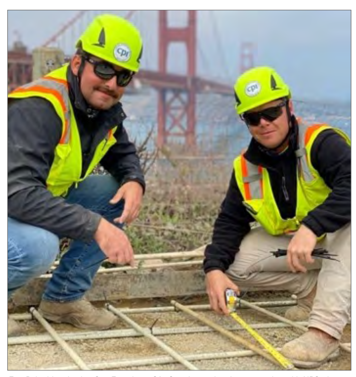
Fort Point historic site, San Francisco, CA. Ongoing project in cooperation with NPS, the Golden Gate National Park Conservancy, industry companies, and the Golden Gate Bridge, Highway, & Transportation District. Partners working together with DoD and DoI during the COVID-19 outbreak to keep program operational, together with each team isolating as a cohort, demonstrates the strength possible with SkillBridge cooperation.

through agreements. For instance, the CPI worked with the U.S. Department of the Interior (DoI) National Park Service (NPS) at Alcatraz Island and Pearl Harbor National Memorial. Such agreements have the potential to increase project work completion while improving employment transitions for greater numbers of active-duty participants.