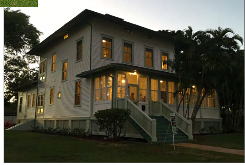
Palm Circle Residence Seven, Front Façade.

Through its recent efforts, Lendlease rehabilitated the historic residences for the 21st century. Lendlease carried out the rehabilitation of Palm Circle Six and Seven in full compliance with SOI Standards for the Treatment of Historic Properties. The Quarters' exterior and interior historic elements were retained while certain elements, such as electrical and plumbing systems, kitchens, bathrooms, and air-conditioning, were modernized.