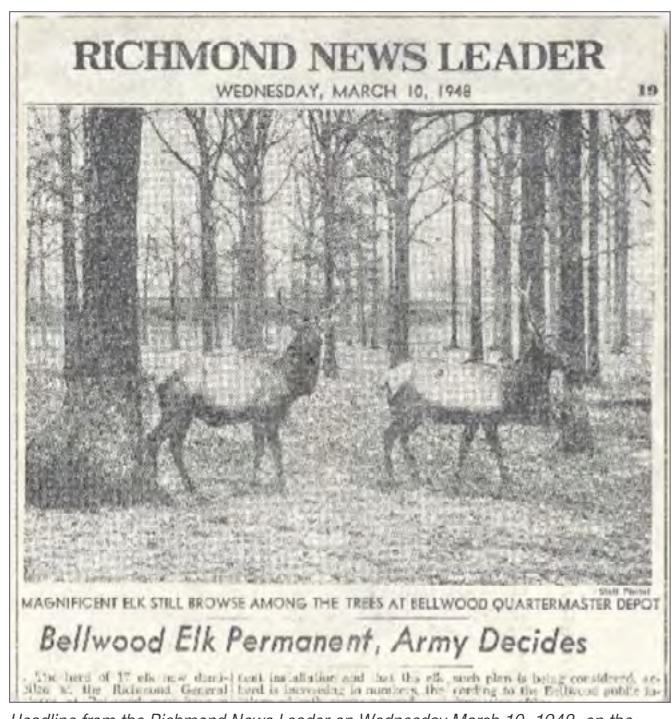
Headline from the Richmond News Leader on Wednesday March 10, 1948, on the Army's decision to keep the Bellwood Elk.