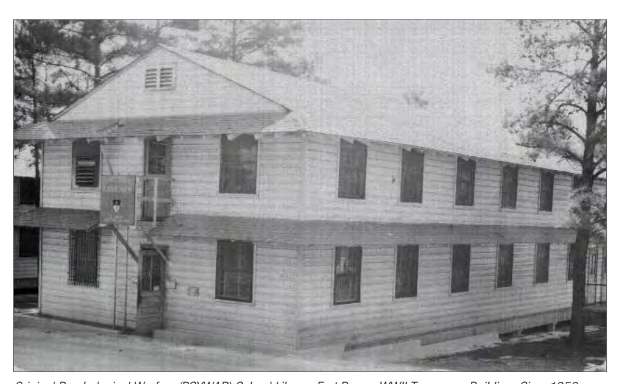
Original Psychological Warfare (PSYWAR) School Library, Fort Bragg, WWII Temporary Building, Circa 1950s.

Legacy 16-518 Brochure: https://denix.osd.mil/cr/historic/vietnam-war/vietnam-war-historic-context/brochure1/.