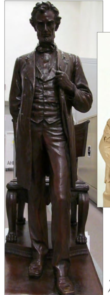
"Taking The Oats Drawing Rations,"

To learn more, please visit the U.S. Army Heritage Museum online at https://ahec.armywarcollege.edu/.