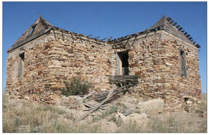
Historic ranch house on Piñon Canyon Maneuver Site, Fort Carson, Colorado, 2019.

The USACE ERDC-CERL team continued its work through Legacy Project 17-837, Nationwide Context and Evaluation Methodology for Farmstead and Ranch Historic Sites and Historic Archaeological Sites on DoD Property, which expands on the methodology for nationwide use and includes evaluation of ranching sites. This project tested the application of the Farmstead/Ranch Methodology at a total of 29 sites located on Fort Riley, Kansas; Barry M. Goldwater Range (Luke Air Force Base), Arizona; Fort McCoy, Wisconsin; Piñon Canyon Maneuver Site (Fort Carson), Colorado; and Fort Hunter Liggett, California.