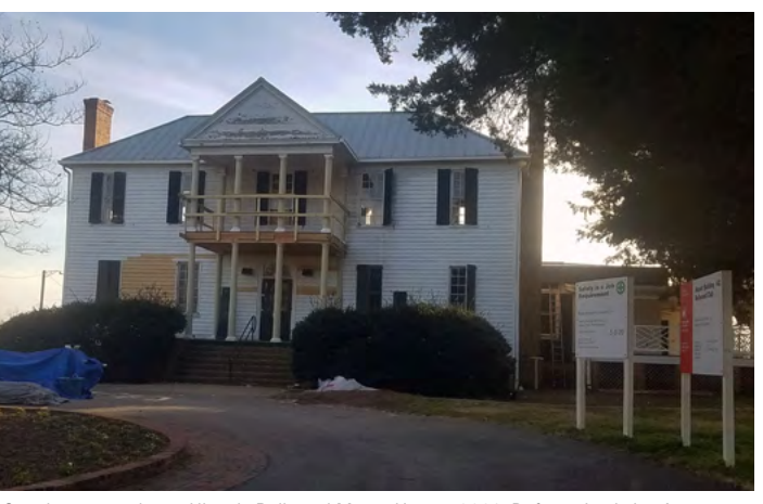
Ongoing restoration at Historic Bellwood Manor House, 2021.

Restoration work is expected to be completed in the next year.