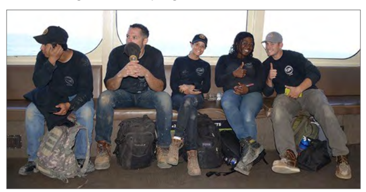
Classroom learning, hands-on training, and the pride of a job well-done mixed with nostalgia for the unique experience shows on the faces of a team on their last boat ride back from Alcatraz Island at the end of their 12 weeks in the program.

The CPI Foundation is an approved construction/ infrastructure-focused SkillBridge program operating under an OUSD(P&R) MOU. The CPI accepts participants from any installation around the world. Federal agencies have leveraged the CPI program for combined benefit