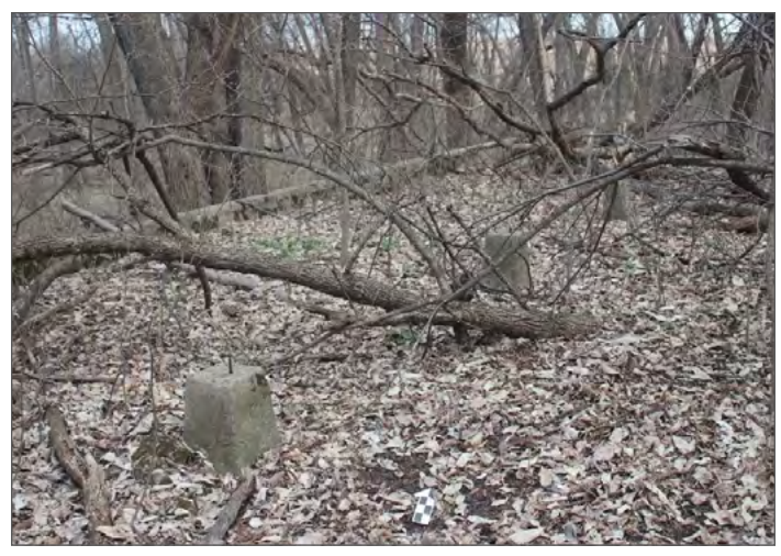
Historic barn foundation Fort Riley, Kansas, 2019.

The Farmstead/Ranch Methodology guides the user through the site evaluation, using a series of Yes/No questions about the site divided into three sections. The first section has preliminary questions designed to