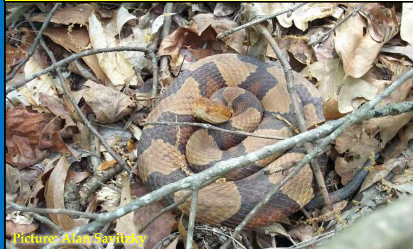
Copperhead ( Agkistrodon contortrix )