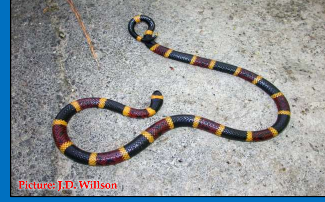
Harlequin Coralsnake ( Micrurus fulvius )