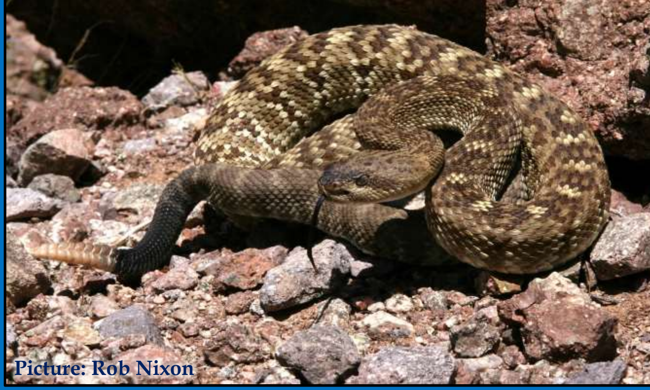
Black-tailed Rattlesnake ( Crotalus molossus )