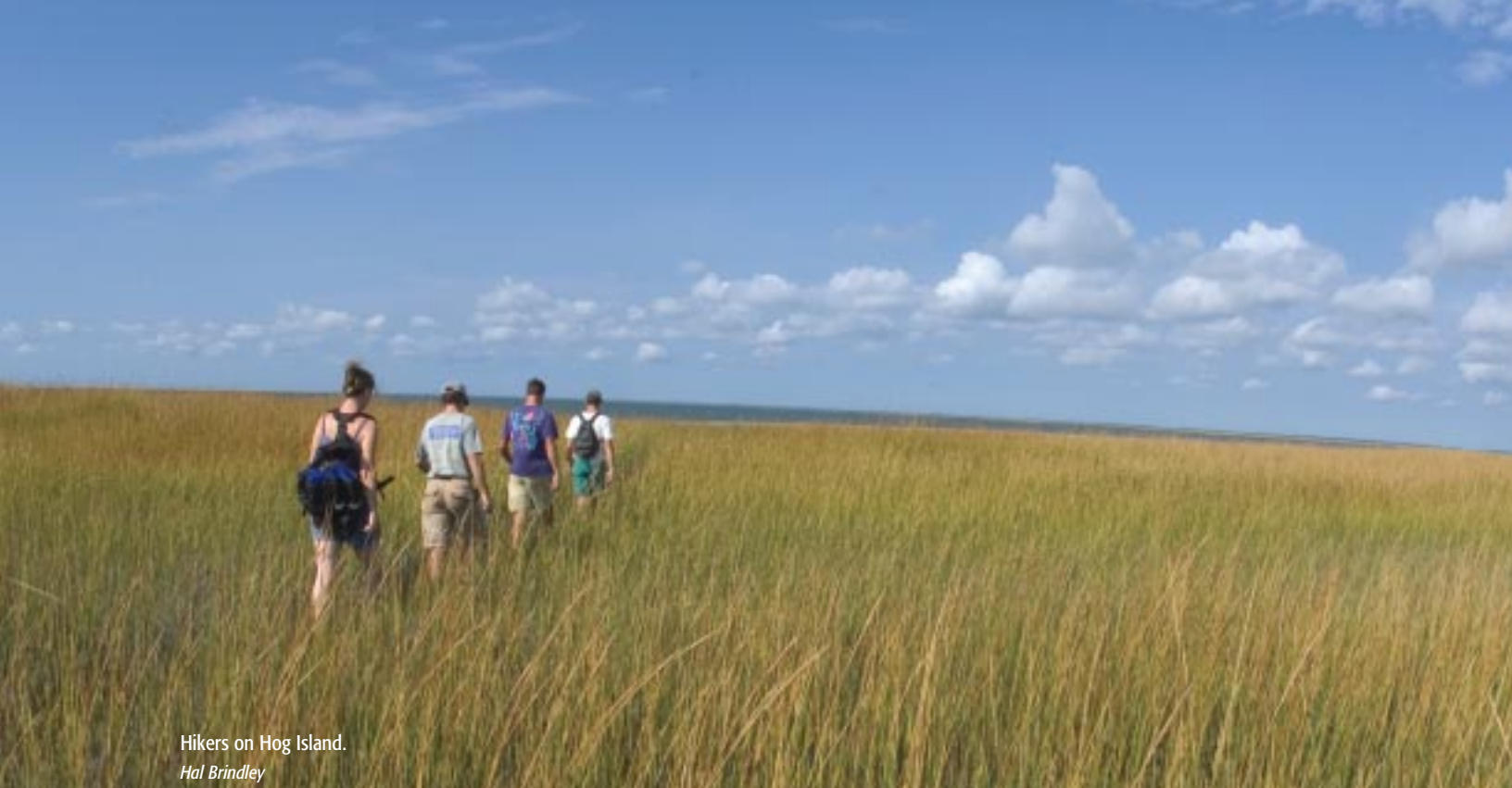
Hikers on Hog Island. Hal Brindley