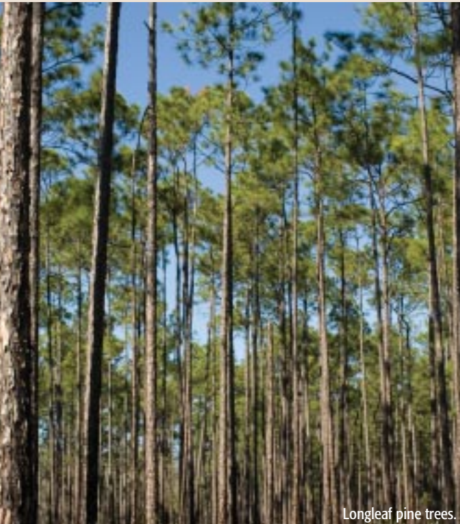
Longleaf pine trees.

WHITING FIELD IS the busiest airfield in the Navy, logging in ten percent of all Department of Defense flight hours in the nation. Maintaining aviation clear zones around the field is crucial to the Field's and the Navy's mission.