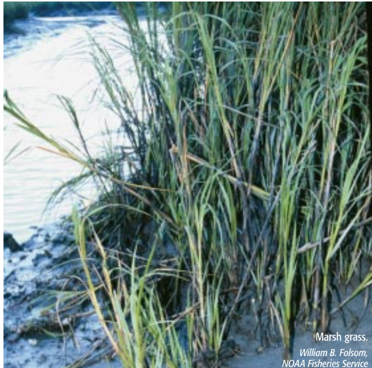
Marsh grass.