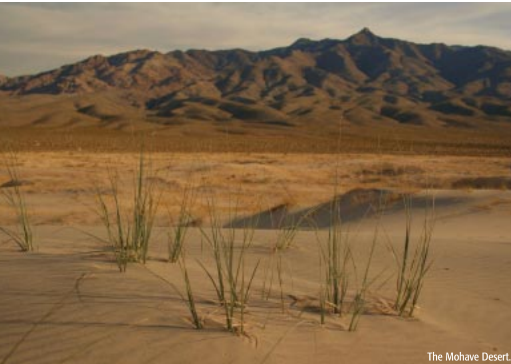
The Mohave Desert.

Weapons Station in China Lake, CA; and we're ultimately hoping to expand that partnership to protect additional lands within the R2508 Complex in the Mojave in California. This is a huge area that is critical, of course, to Navy training and testing, as well as the Air Force, the Army and the Marine Corps. It is a threatened and valuable ecosystem.