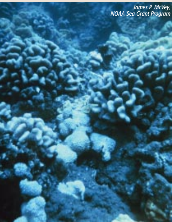
James P. McVey, NOAA Sea Grant Program

THE ISLAND OF Guam is situated in Micronesia, an area that altogether encompasses 20 percent of the Pacific Island region. The Nature Conservancy has been working with the governments of Guam and CNMI and other local partners to protect and preserve the ecosystems of the region—ecosystems that contain nearly 500 species of coral, 1,300 species of fish, 85 species of birds and 1,400 species of plants.