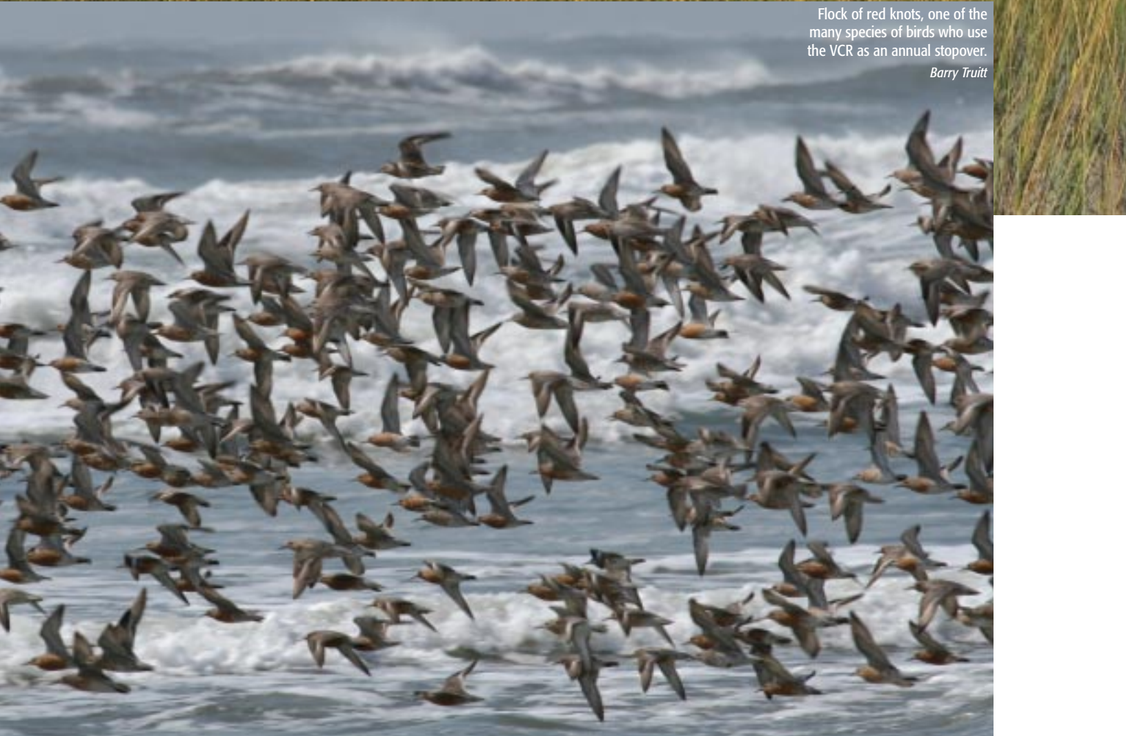
Flock of red knots, one of the many species of birds who use the VCR as an annual stopover. Barry Truitt