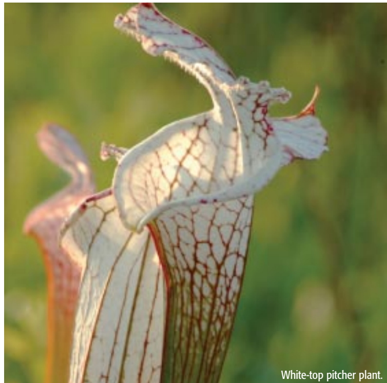
White-top pitcher plant.