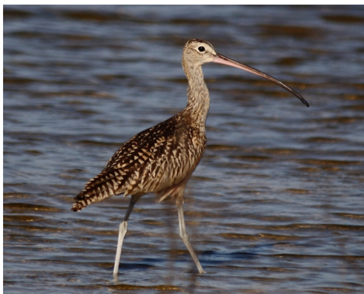
The Long-billed Curlew, a DoD PIF priority species, is North America's largest shorebird. It breeds in the grasslands of the Great Plains and Great Basin.