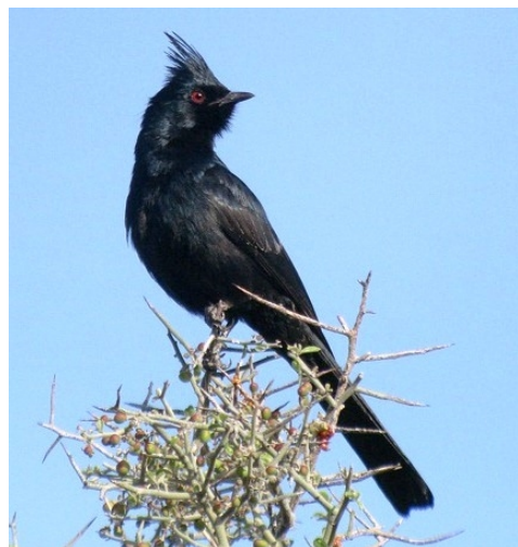
Phainopepla , a Continental Stewardship Species, has 75% of its breeding population in the Southwest Avifaunal Biome.

Across all of the Cornell Lab programs run the themes of cutting-edge scientific research, training of both professional and amateur scientists, innovative technology development and application, acquisition and management of massively large databases, engagement of diverse audiences, and global reach in conservation through strategic partnerships. Often serving as the interface between science and policy, Cornell Lab scientists and educators play leadership roles in numerous conservation partnership initiatives, including Partners in Flight, North American Bird Conservation Initiative, U.S. State of the Birds, and Bird Education Alliance for Conservation. In addition, the Lab’s Neotropical Conservation Initiative focuses on training, bird monitoring, and conservation activities throughout Latin America and the Caribbean regions.