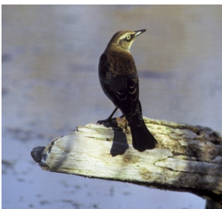
The Rusty Blackbird, a DoD PIF priority species, is one of North America's most rapidly declining species. It spends both the breeding and non-breeding seasons on military lands.