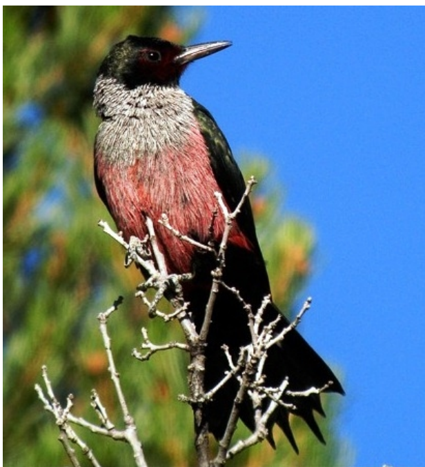
Lewis's Woodpecker nests in western riparian areas. Fewer than 150,000 exist, making it a high conservation priority.

Building on the success of the work at Fort Hood, the Cornell Lab partnered with DoD on a series of Legacy projects to further develop and implement remote acoustic monitoring on and around military bases. From 2005-2007, we established a transect of six bases in the northeastern U.S., from Fort Drum, NY, to Patuxent Naval Air Station, MD, where we deployed ARUs programmed to record the calls of nocturnally migrating birds. The goal of this study was to test a system that could monitor fall and spring migration in the airspace above these military bases, relate the abundance and composition of bird migration to military use of this airspace (to assess potential bird-airplane strikes), and to assess the importance of military lands as potential stopover sites for migrant birds