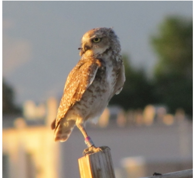
Banded adult Burrowing Owl with insect prey on Kirtland Air Force Base (NM).

Research on KAFB examines population status, reproductive success, site fidelity, predation, and prey availability by comparing different base habitats. Scientists conduct dispersal studies to learn more about