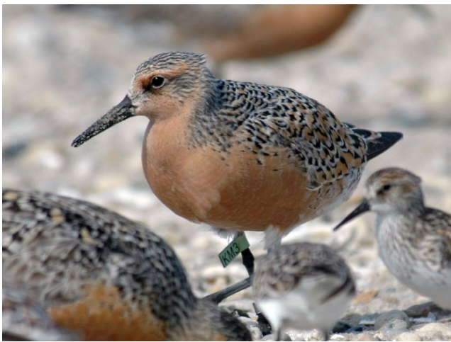
The Red Knot makes one of the longest yearly migrations of any bird, traveling 9,300 miles from its Arctic breeding grounds to Tierra del Fuego in South America.

The Partners in Flight (PIF) Steering Committee held a facilitated strategic planning session on September 11-12, 2011, near Omaha, NE. The 21 participants reaffirmed the value and centrality of PIF's mission and goals, and drafted several strategies for action. PIF identifies, refines, and prioritizes specific tasks to implement these strategies. The timeline for accomplishing these tasks should take a maximum of 36 months, which is substantially shorter than what is typical for this sort of exercise. We believe that this short timeline will lead to identifying more specific tasks that we can realistically accomplish and fewer tasks that are too grand to achieve.