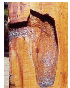
Nest cavity cross-section

RCWs exist in a cooperative social family structure called a “group.” Each group has up to 10 birds but contains no more than 1 breeding pair. Each bird has its own roosting cavity. The collection of individual cavity trees is referred to as a “cluster.” Although the bulk of the RCW’s population occurs in longleaf pine forests, all of the southern pine species harbor RCWs. They forage almost exclusively on arthropods found on pine trees, prying off bark plates to expose prey beneath. Mixed-age stands can harbor birds, but there must enough older trees, typically 80 years or older, to support active and replacement cavities. Openness is another important stand characteristic. The species depends on almost park-like conditions, where the understory is low, and the midstory is minimal to non-existent. Many other birds are likely to inhabit RCW cavities, from bluebirds and nuthatches to all of the other woodpeckers, and most significantly, flying squirrels.