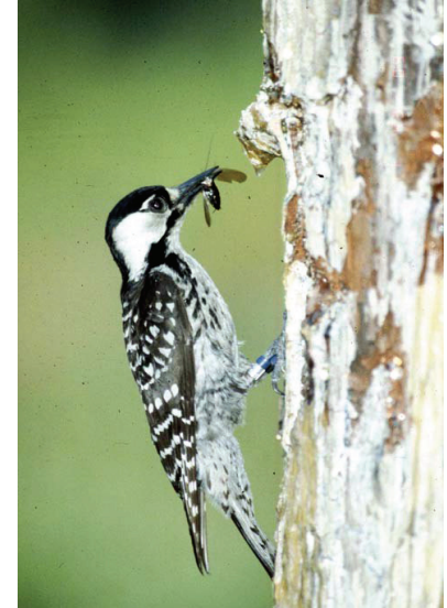
A red-cockaded woodpecker takes an insect back to its nest on Camp Lejeune.

sapwood exudes a sticky resin that coats the surrounding bark. Ultimately, RCWs evolved to make use of this trait by pecking many small “resin wells” into the bark in numerous locations to expose the sapwood and release the flow of resin around the cavity. This coats the tree in a virtually impenetrable barrier of resin which tends to deter most ground predators. RCWs avoid most of the resin by removing the bark to clear a bare “plate” around the cavity, which allows them to enter and exit with minimum exposure to the resin.