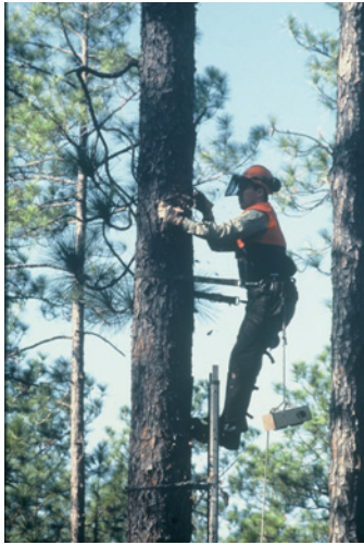
Installing an artificial nest cavity.

At present there are 18 Department of Defense (DoD) installations supporting RCWs. As of 2000, Eglin Air Force Base (FL) had 301 active clusters and Fort Bragg (NC) had 350 (only the Apalachicola Ranger District in Florida had more active clusters than Fort Bragg). All of these populations appear to be stable or increasing. Widespread declines among populations on military installations have been stabilized, but substantial increases in population sizes are still required for recovery. Early in the recovery phase of RCWs, the perception that military activities were a handicap to RCW conservation created tension between national defense requirements and endangered species management. However, RCWs have been shown to be more resilient to man's presence and activities than previously thought. The nature of live-fire and mechanized training in pine forest lands by default fosters the savanna type conditions conducive to RCWs. Studies have shown that