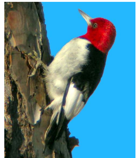
Red-headed Woodpecker is one of the species identified by DoD PIF as mission-sensitive for Department of Defense lands.

In addition to helping prioritize monitoring programs and National Environmental Policy Act (NEPA) documents, the final list will be used