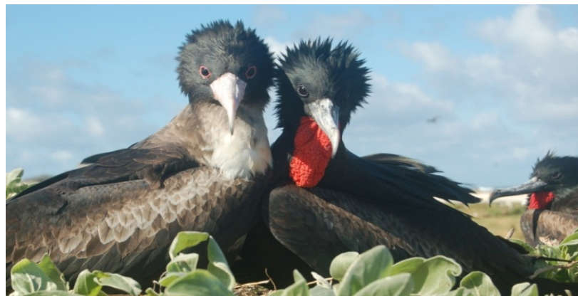
Great Frigatebirds on Tern Island in the northwestern Hawaiian Islands

X Found on property X* Confirmed nesting