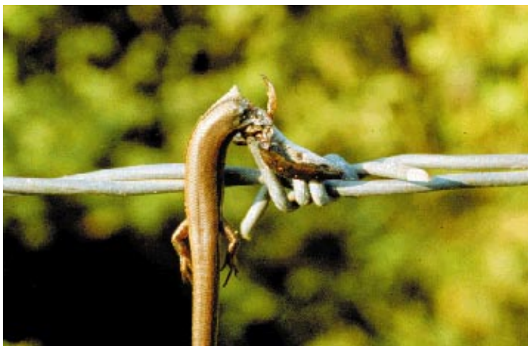
Figure 2. Loggerhead shrikes often impale prey on barbed wire or tree/shrub spines

Other than corvids (i.e., crows, jays, magpies), shrikes are the only North American songbird that regularly preys on other vertebrates and are well-known for their habit of impaling mice, shrews, small birds, lizards, and snakes on thorns or barbed wire (Figure 2). The adaptive significance of this behavior is not fully understood; but Safriel (1995)