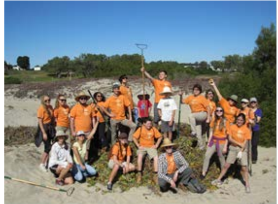
Figure 3. Students celebrate after removing iceplant at Naval Base Coronado.