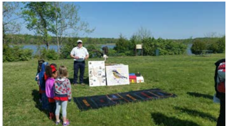
Figure 2. Fort Belvoir Earth Day Event 2016.