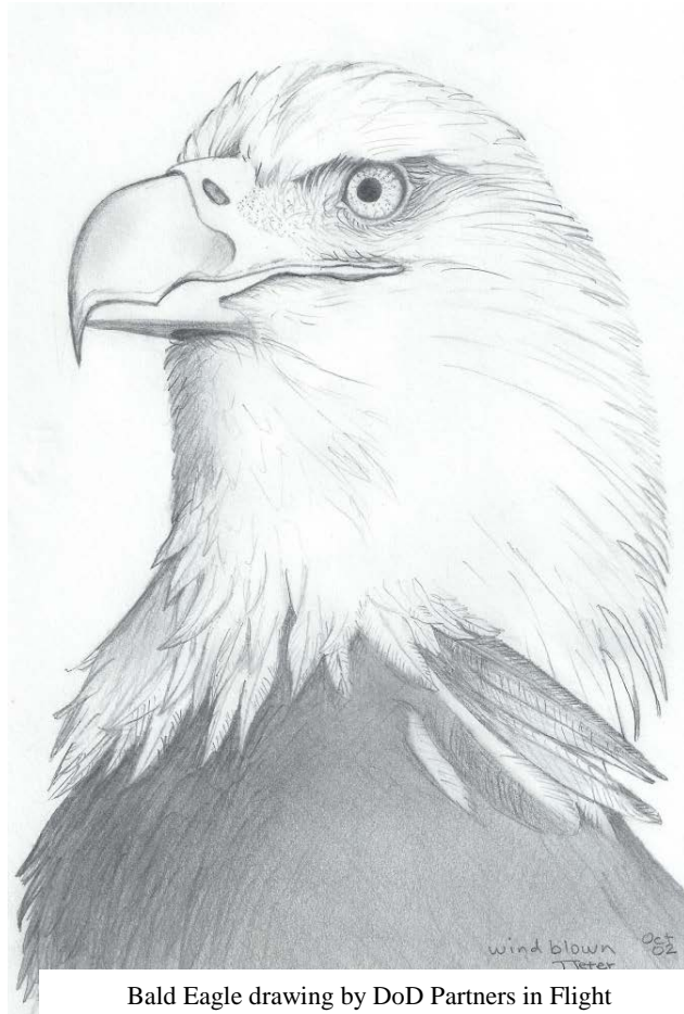
Bald Eagle drawing by DoD Partners in Flight representative Julie Jeter, USAF

DoD lands represent a critical network of habitats for Neotropical migratory birds, offering migratory stopover areas for resting and feeding, and suitable sites for nesting and rearing their young. A large workforce of dedicated DoD biologists and natural resource managers implement a vast array of initiatives and management actions to conserve and enhance these valuable habitats and public lands. DoD Partners in Flight helps facilitate various bird conservation activities and initiatives that include all species of birds. A network of DoD natural resource professionals work as DoD Partners in Flight Representatives to support and communicate with installation resource managers, state and regional Partners in Flight working groups, non-government organizations, academic researchers, and natural resource consultants to collectively promote and coordinate bird conservation across DoD lands.