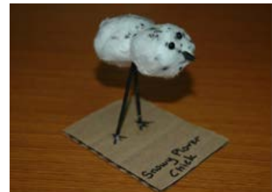
Figure 4. Snowy Plover craft created by military home-school students at Naval Base Coronado.