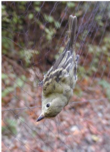
Two methods of monitoring migration in California: NEXRAD radar (left), showing migrating birds in color, and standardized mist-netting (right), showing a Pacific Slope Flycatcher, a migratory songbird, captured in a mist-net.

However, this method has not been used before in California, and it is therefore important to determine how migration data derived from NEXRAD radar compares to on-the-ground data collection methods, such as standardized mist netting.