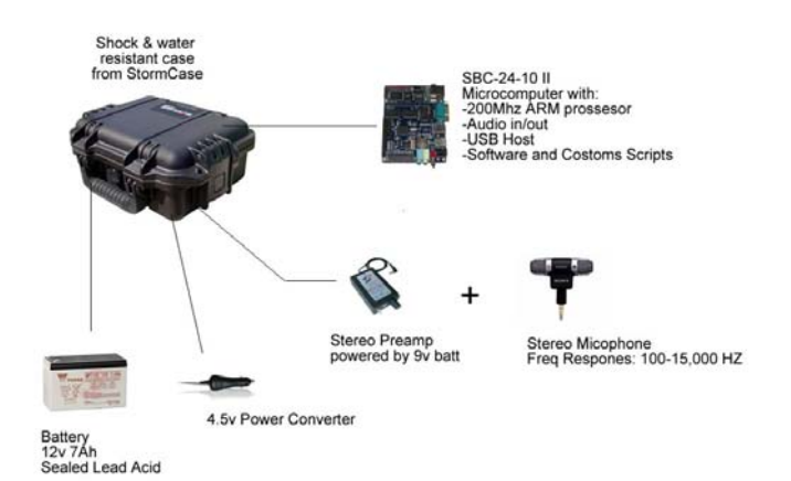
Figure 2. Portable recording station.

The project team includes a group of biologists (PI, Ph.D. graduate student, and an undergraduate student) and computer scientists (CoPI, MS graduate student, and an undergraduate student). During the first year of this project we have dedicated most of our effort to developing the hardware and software. We have developed working prototypes of both the portable and permanent recording stations, they have been field tested, and during the second year we will be deploying them to three DOD installations. A web-based interface has been developed that allows the user to visualize, listen, and annotate recordings. The system is being test by the team and will be available to the public during the next year.