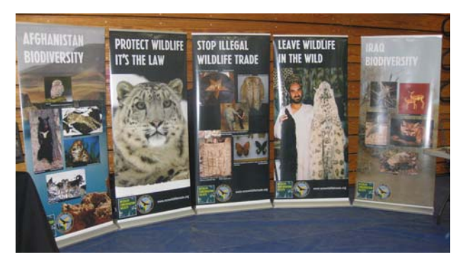
Travelling exhibit at Fort Drum

to develop clear messages that resonate with military personnel about the potential concerns pertaining to the purchase of wildlife products while stationed overseas. We are communicating these messages through outreach materials: an award winning video, an officer training fact sheet, a Smart Card, several power point presentations of varying lengths that can be downloaded and used by military staff to train enlisted personnel, a website to house the information and new display materials for in-person training and other exhibit opportunities.