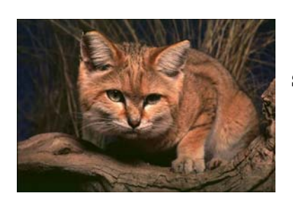
Sand cat (Felis margarita), one of nine protected cats in Afghanistan

In May 2007, staff from the Wildlife Conservation Society's (WCS) first noticed illegal items for sale on military bases near Kabul and witnessed military personnel purchasing the items. A survey of 395 soldiers at Fort Drum in June 2008, revealed that more than 40% of those surveyed purchased or saw someone else in the military purchase wildlife items yet less than 12% knew about CITES. Military personnel who either knowingly or unknowingly purchase, transport, or attempt to import illegal wildlife trade products risk confiscation of items and legal action including fines or imprisonment for violating U.S. law, international law, and military regulations.