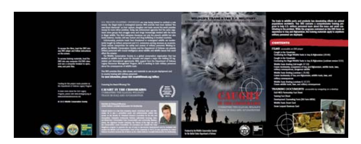
Caught in the Crosshairs DVD cover

To date, we have reached over 20,000 military personnel through our training programs. We have packaged all training materials into folders for distribution to all U.S. based military installations and several overseas bases. The folders include a DVD with the award winning video Caught in the Crosshairs, narrated by Edward Norton, as well as three narrated power point presentations of varying lengths, a Smart Card, a training fact sheet for officers, Form 4658 with information on wildlife trade, and two publications concerning this work. We have modified presentations to include a module for comparing real and fake furs and ivory tailored to personnel deploying to Asia and Africa. All materials are available online at www.wcswildlifetrade.org/military. In addition, we have incorporated training materials into a course for Joint Environmental Considerations during Deployment Operations as well as US Army Africa incountry briefings.