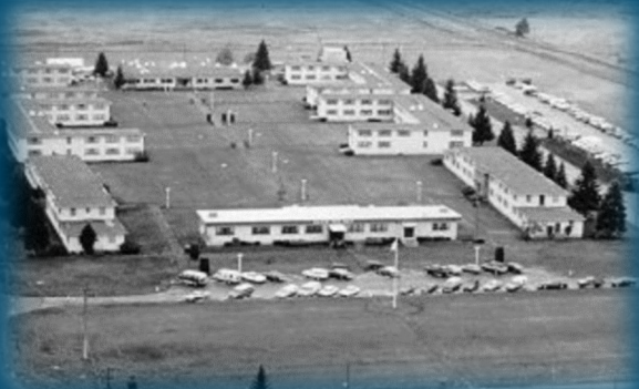
The USAF Survival School Complex at Fairchild AFB, Washington in 1966

The report provides cultural resource managers and professionals with a standardized approach to identify property types, determine historical significance, and assess integrity, thereby greatly increasing efficiency and cost-savings in compliance with the National Historic