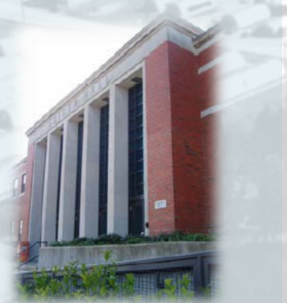
Geigier Hall at MCB Quantico, Virginia

Source: John Milner Associates, Inc. 2007