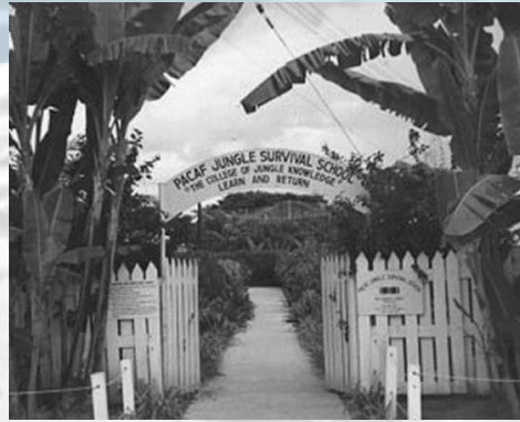
PACAF Jungle Survival School, Clark AFB, Philippines

The methods for completing this historic context included a literature review, investigation of primary and secondary sources for context, site visits to select installations, and report development. Researchers accessed primary and secondary sources at the National Archives and Records Administration, military libraries and museums, university libraries, and online sources. DoD installation staff provided additional information and documentation.