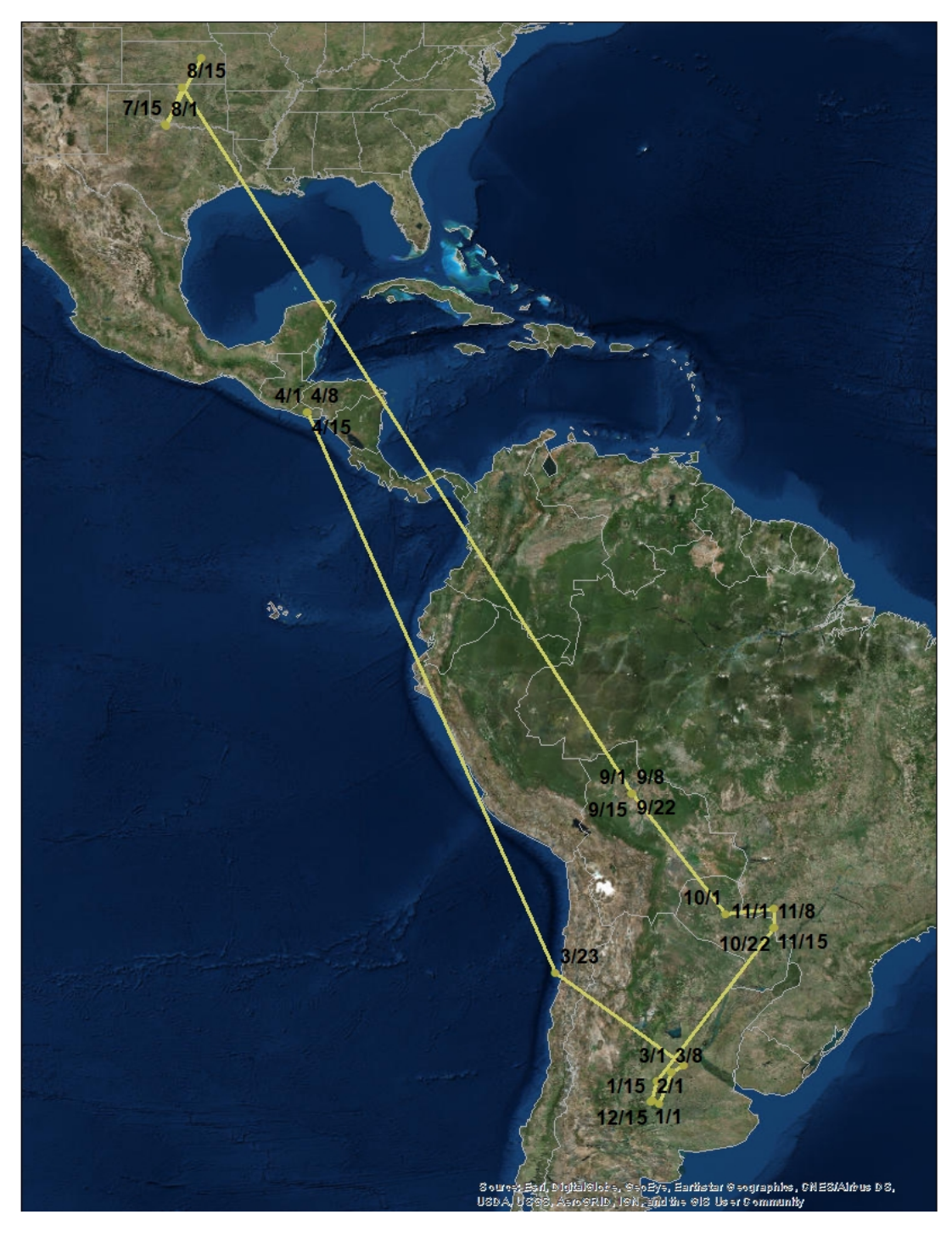
Figure 2. GPS locations (circles) transmitted from an Argos satellite from GPS tag #146694 on an Upland Sandpiper.