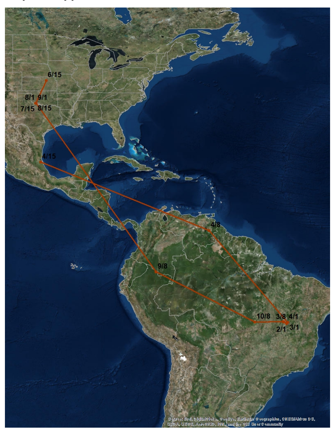
Figure 4. GPS locations (circles) transmitted from an Argos satellite from GPS tag #146682 on an Upland Sandpiper.