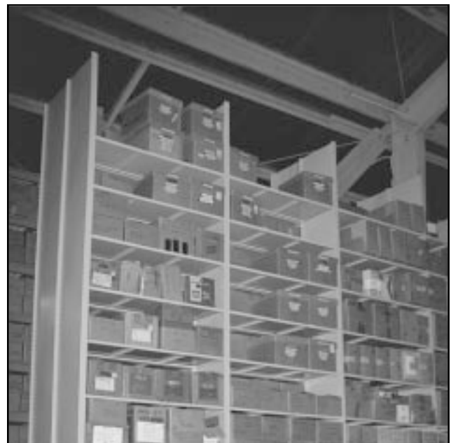
Figure 101. Artifacts in Building 33 are housed on large shelving units.

each bag. Artifacts in Building 33 encompass 1.58 ft 3 and all have been cleaned and approximately 20% have been directly labeled.