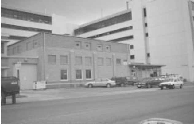
Figure 114. The building housing the University of Wyoming Archaeological Repository was formerly a livestock arena.