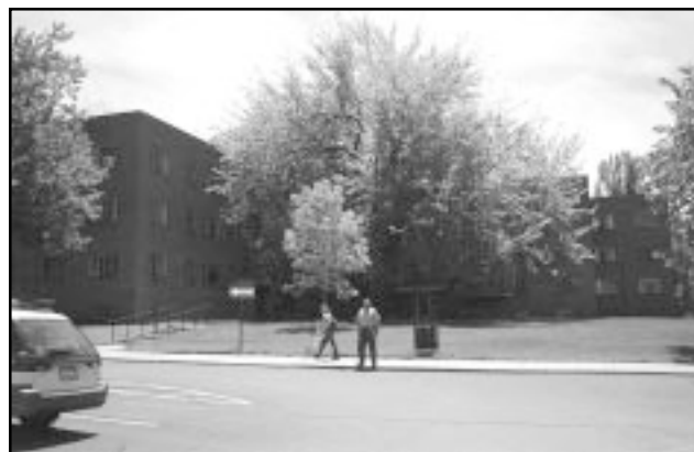
Figure 47. Collections are housed in Pioneer Hall on the University of Denver campus.

Archaeological collections are stored in Pioneer Hall, which was built in 1945 as a dormitory and office building and was later renovated to house offices and classrooms (Figure 47). The building is approximately 42,720 ft 2 , of which the museum area occupies 8,600 ft 2 . Activity areas include artifact and