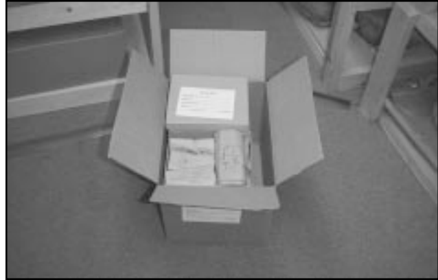
Figure 23. Some artifacts at SWCA are stored in paper bags secured with rubber bands.

Artifacts from Camp Navajo are stored on unsealed wood and pressboard shelving units. The primary containers for the artifacts consist of two acidic cardboard boxes that measure 19.5 x 8 x 8 and 16 x 12 x 12 (inches, d x w x h). The boxes are labeled with an acid-free adhesive label with computer generated print and pen. The label information includes project, material, and box number. Secondary containers are of two types: historic materials are enclosed in paper bags secured with rubber bands (Figure 23) and directly labeled with a stamp and black ink, whereas prehistoric materials are contained in smaller, acid-free boxes with computer generated adhesive labels. Prehistoric materials are further packaged inside the small boxes in paper bags secured with rubber bands and/or zip-lock plastic bags. Some materials are also contained in plastic film canisters within the nested secondary