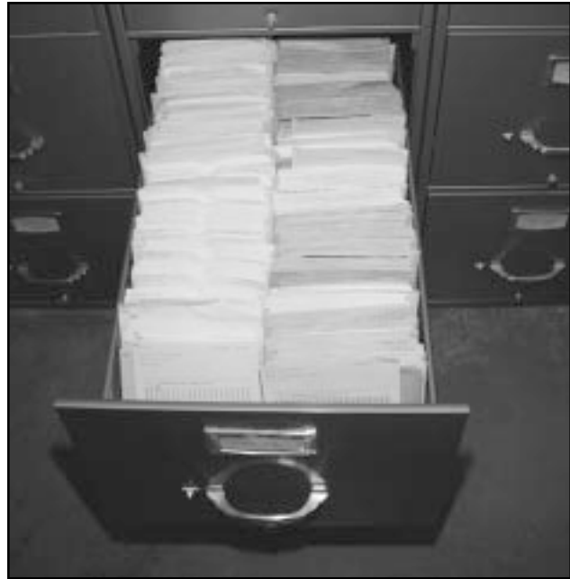
Figure 102. Photographic materials are housed in archival sleeves.

Two computer disks, totaling approximately 0.02 linear feet, are housed with the records collections.