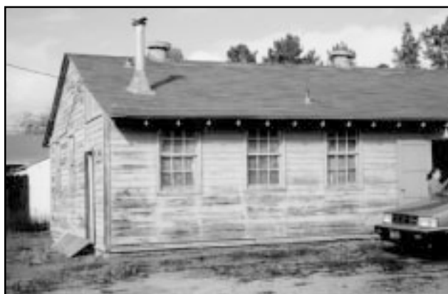
Figure 41. The San Luis Obispo County Archaeological Society storage building is located on Cuesta College.

The San Luis Obispo County Archaeological Society (SLOCAS) occupies two adjacent buildings, numbered 1522 and 1523, on the campus of Cuesta College (Figure 41). The buildings used to be part of the adjacent Camp San Luis Obispo, and are therefore of military construction. Both buildings were built in 1939–1940 and originally served as barracks. Artifacts from Camp San Luis Obispo are housed in one 1,400 ft 2 building, which has a concrete foundation, wood exterior walls, and a