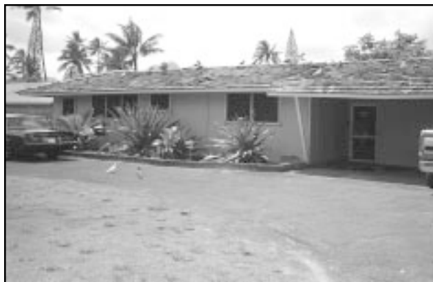
Figure 49. Cultural Surveys Hawaii is located in a 23-year-old house.

Cultural Surveys Hawaii is located in a privately-owned house that is used for offices and equipment storage (Figure 49). The 1,600 ft 2 structure is approximately 23-years old and has a concrete foundation with a wooden frame. The external walls