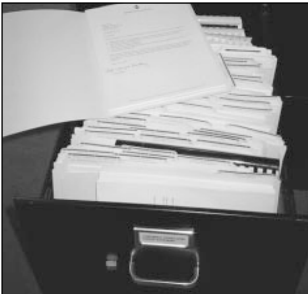
Figure 29. Records are stored in a metal filing cabinet.

Records are stored in manila folders in one drawer of a metal, legal-sized file cabinet (Figure 29). The drawer is labeled with a typed paper label inserted into the metal label slot on the front of the drawer. Labels for the folders are adhesive with typed information.