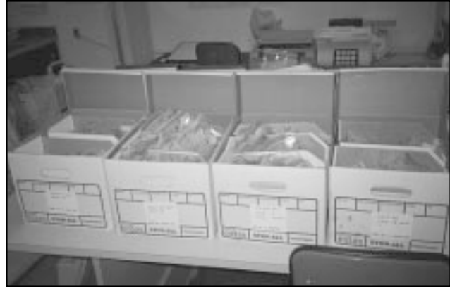
Figure 39. Collections from Camp San Luis Obispo are housed in 4-mil zip-lock bags in acidic cardboard boxes.

Collections are stored on an open metal shelving unit that measures 48 x 17.5 x 74.5 (inches, d x w x h). The primary containers consist of eight acidic cardboard boxes measuring 15.5 x 12.5 x 10.25 (inches, d x w x h) (Figure 39). The boxes are labeled in marker on an adhesive label with site and catalog numbers. Within