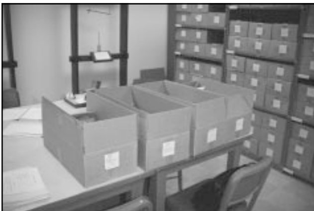
Figure 63. Artifacts and records from Limestone Hills Army National Guard Training Site are housed in acidic cardboard boxes.

Artifacts from Limestone Hills Army National Guard Training Site are stored on metal shelves in the collections storage area in standard-sized acidic cardboard boxes that measure 23.25 x 11.25 x 6.75 (inches, d x w x h) (Figure 63). These primary containers have been labeled with post-it notes written in marker with the site number and collection number. The boxes contain secondary containers consisting of 2-mil plastic zip-lock bags, paper bags, and manila envelopes. Secondary containers are labeled directly in marker with site number, provenience, date, investigator, and material type. Artifacts encompass 4.09 ft 3 (Table 56) and all have been cleaned and approximately half labeled with ink, some over a white base coat.