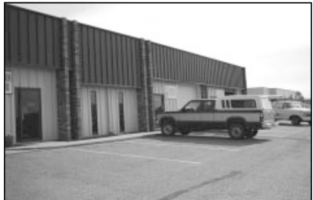
Figure 72. Metcalfe Archaeological Consultants is housed in a business complex.

Metcalfe Archaeological Consultants (MAC) occupies approximately 2,000 ft 2 within the Broadway Business Center office complex, which was built in the late 1970s (Figure 72). The building foundation is concrete, and the exterior walls are corrugated metal. The roof is constructed of built-up asphalt. The building has one to one and a half stories above grade, and none below grade.