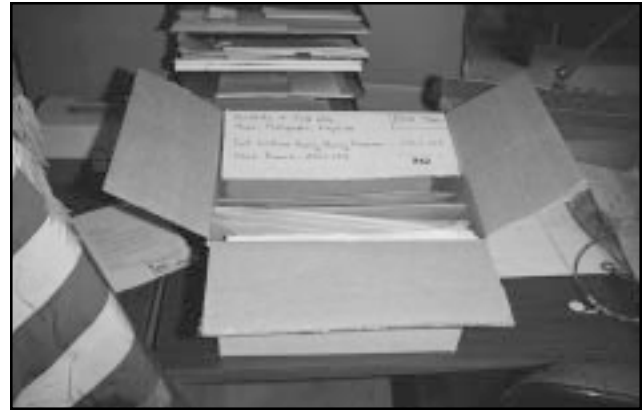
Figure 13. Records are stored with artifacts in manila envelopes in acidic cardboard boxes.

Records from Fort William Henry Harrison encompass approximately 0.38 linear feet (Table 17). They are stored in manila envelopes in an accordion folder with some of the artifacts in an acidic cardboard box, which is housed on metal shelves (Figure 13). The envelopes have been directly labeled with marker or pen.