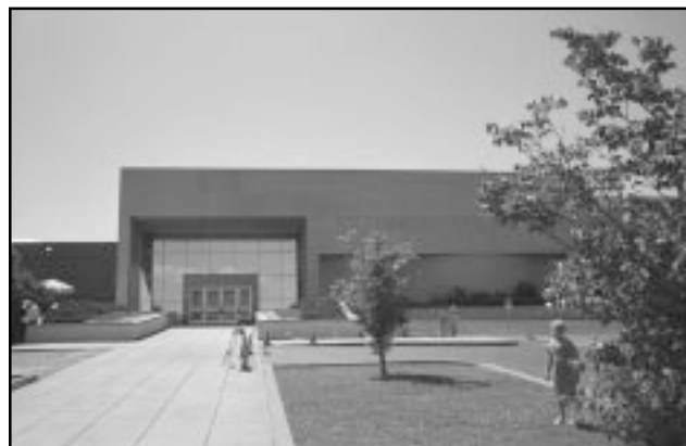
Figure 65. The Museum of the Rockies is located adjacent to Montana State University.

The building has two floors, one above ground and one below. The foundation is concrete