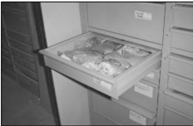
Figure 74. Archeological collections are stored in metal drawers.

Artifacts are stored in tall metal sliding drawer systems, each measuring 37 x 72 x 109 (inches, d x w x h) (Figure 74). Artifacts are stored in secondary containers consisting of paper or plastic zip-lock bags within the drawers. The drawers are labeled with an adhesive label, and the bags are labeled directly with marker. Artifacts encompass 8.75 ft 3