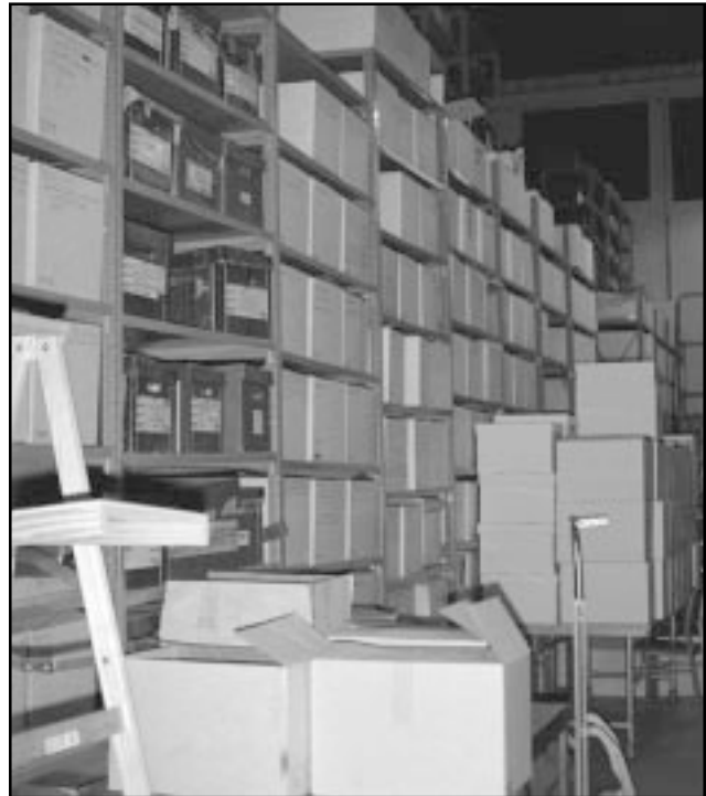
Figure 115. Artifacts are housed in acidic cardboard boxes on metal shelves.

Artifacts from Wyoming Army National Guard facilities are stored on metal shelves in the arena in acidic cardboard boxes that measure 18 x 12.5 x 12.5 (inches, d x w x h) (Figure 115). These boxes are labeled directly in marker or pen with the box number. The boxes contain secondary containers