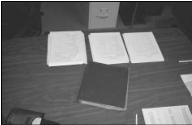
Figure 105. Records are currently kept on a table top.

Records from Camp W. G. Williams and Richfield Organizational Maintenance Shop encompass approximately 0.44 linear feet (Table 98), although the records from Camp W. G. Williams consist of only one sheet of paper. All records from these two facilities are either stored on the floor or on a table (Figure 105). Some are in unlabeled three-ring binders and others are in a manila folder labeled directly in pen and with a piece of paper taped to the folder.