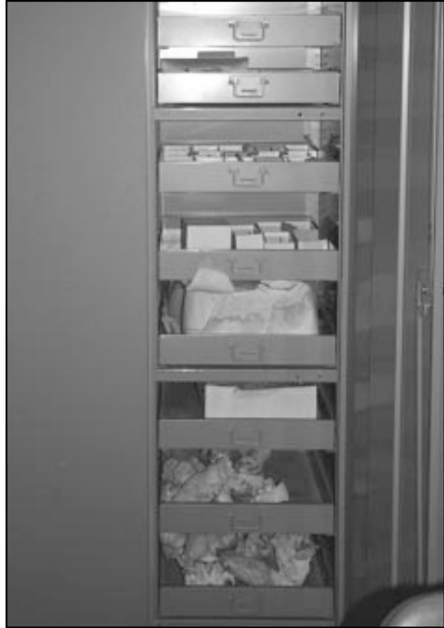
Figure 82. Artifacts and records are housed in a metal storage unit.

Photographic prints and negatives are in plastic commercial processing envelopes in the acidic cardboard box. Slides are stored in paper slide