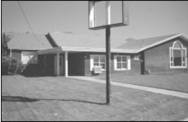
Figure 103. Baseline Data, Inc. is located in a former pastor's house.

house (Figure 103). Attached to the house is the former chapel, constructed in 1949. The house has a concrete foundation, brick walls, and a built-up asphalt roof. Activities in the building consist of an artifact holding area, washing area, processing area, temporary artifact storage area, artifact study room, and a records study room.