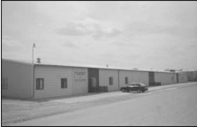
Figure 88. Exterior of the South Dakota Archaeological Research Center

and artifact processing areas, a small kitchenette, and several restrooms.