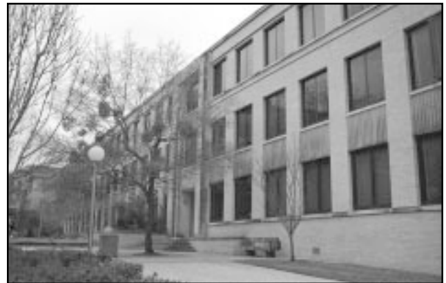
Figure 91. Exterior of the Anthropology Building, where the Center for Ecological Archaeology is located.

The Center for Ecological Archaeology is located in the Anthropology Building at Texas A & M University (Figure 91). The Anthropology Building, used as the Engineering Building until 1991, houses offices, classrooms, laboratories, and storage areas. The structure is 47 years old and has always served an academic function. The building has a concrete