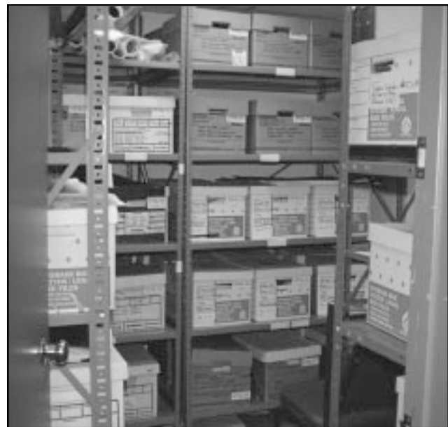
Figure 6. Artifacts are housed in acidic cardboard boxes on metal shelves.

The storage units for the collections consist of metal enamel shelving units measuring 48 x 36 x 72 (inches, d x w x h). The primary containers for the artifacts consist of acidic cardboard boxes that measure approximately 16 x 12.5 x 10.25 (inches, d x w x h) (Figure 6). The boxes are labeled with adhesive or direct labels written in marker. The labels include site number, project, box number (within project), and