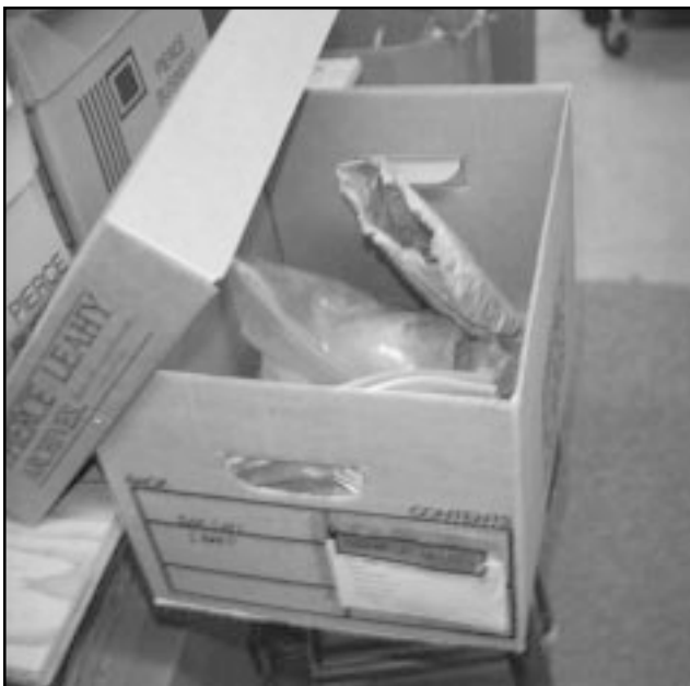
Figure 32. Artifacts are housed in plastic zip-lock bags and a paper bag in an acidic cardboard box.

The artifacts are currently located in one acidic cardboard box, measuring 16.25 x 12.5 x 10.25 (inches, d x w x h), on top of a metal and wood table in the collections storage room (Figure 32). The box is directly labeled in marker and has an adhesive plastic sleeve with a printed paper label insert written in pencil. The information on the labels