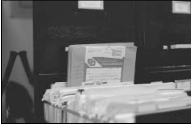
Figure 53. Photographic records from Kanaio Training Area.