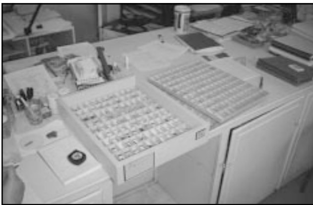
Figure 110. Some artifacts are individually housed in balsa wood partitions in drawers.

The artifacts from Camp W. G. Williams that are stored in the lab are kept on wood shelves in shallow drawers, some of which have been fitted with divided balsa wood trays, which are labeled with a paper label insert (Figure 110). Some artifacts are