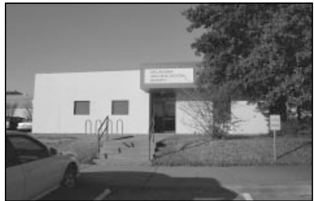
Figure 76. The Oklahoma Archeological Survey is located on the University of Oklahoma campus.

The Oklahoma Archeological Survey (OAS) is located on the University of Oklahoma campus in Norman. The building it occupies was constructed 6–10 years ago, and includes offices, archives, laboratories and processing areas, storage areas, and site files (Figure 76). The foundation is concrete, the exterior walls are constructed of concrete blocks, and the roof is made of built-up asphalt. There is one floor above grade.