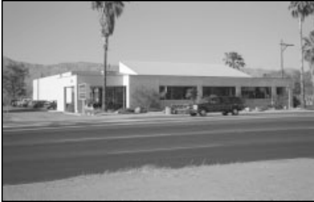
Figure 25. Statistical Research, Inc. is located in a building formerly occupied by a home health care provider company.

foundation and concrete block exterior walls. The roof, which was completely renovated in 1996, has shingles in the front and built-up asphalt in the rear of the building. Activity areas present in the 12,000 ft 2 facility include offices, report production areas, a laboratory with collections storage space, materials/supplies storage space, a reception area with a display case, and a darkroom. The one-story facility has multiple windows of varying dimensions; no windows are in the collections storage area, but skylights are present. The aluminum-framed windows in the rest of the building are sealed, have partial shades, and have never been replaced. Exterior doors are metal-framed with glass panes.