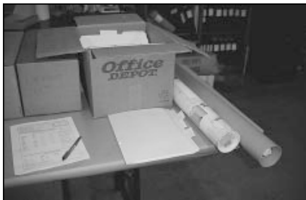
Figure 27. Associated documentation is stored in a variety of containers.

Records encompass approximately 1.90 linear feet (Table 27). All records are stored in the laboratory with the artifacts, with the exception of some of the materials from Air Force Plant 44, which are on a table in an archaeologist's office. Documentation is stored in a number of containers, including manila folders and three-ring binders in acidic cardboard boxes, map tubes, a triangular-shaped FedEx® box, or are loose in the boxes (Figure 27). Manila folders are directly labeled in marker, and some of the