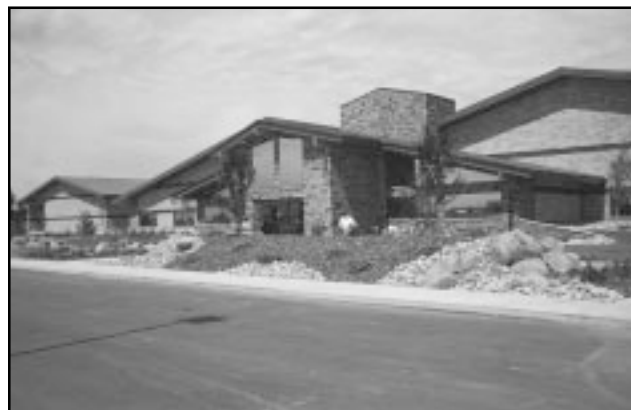
Figure 62. Exterior of the new Billings Curation Center building.

Approximately 4.09 cubic feet of artifacts and 0.04 linear feet of Army National Guard associated documentation from projects conducted on Limestone Hills Army National Guard Training Site, Montana, are housed at the Billings Curation Center.