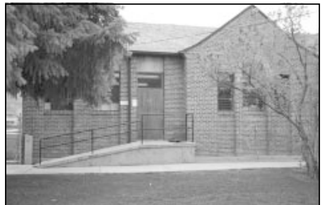
Figure 109. The Archaeology Laboratory is located in a brick building.

The archaeology laboratory is located in South Hall on the Southern Utah University campus (Figure 109). The 90–100 year old brick building has a concrete foundation and a shingled roof. It is used as a collections facility, classroom, laboratory, and a museum.