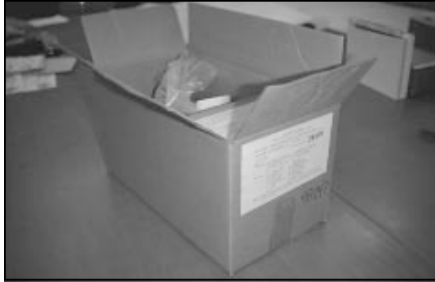
Figure 20. Artifacts from Florence Military Reservation are housed in 2- to 4-mil zip-lock bags and acidic cardboard boxes.

shipping box. Label information on the boxes consists of project name, site number, box number, accession number, and material class. The boxes contain secondary containers consisting of 2- to 4-mil zip-lock plastic bags and small cardboard boxes that have been labeled with adhesive labels or acidic paper tags either in the plastic bags or twisted to the bags. Label information consists of some or all of the following: site number, provenience, project, bag number, investigator, contents, specimen number, and item number. Tertiary containers consist of plastic bags nested in the small cardboard box secondary containers. Artifacts encompass 15.51 ft 3 (Table 22) and all have been cleaned. Only those artifacts in the shipping box were labeled directly with ink.