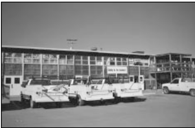
Figure 8. The Environmental Office is located in Building 790.

The Cultural Resources office of Parks Reserve Forces Training Area is serving as a temporary storage area for a small collection from the post. Building 790 houses the Environmental Division, which includes the Cultural Resources office (Figure 8). It is a two-story structure that contains offices, maintenance shops, and vehicle storage. The structure was built in the 1940s and has always served a maintenance function. It has a concrete slab foundation, asbestos panel exterior walls, and a flat, asphalt roof.