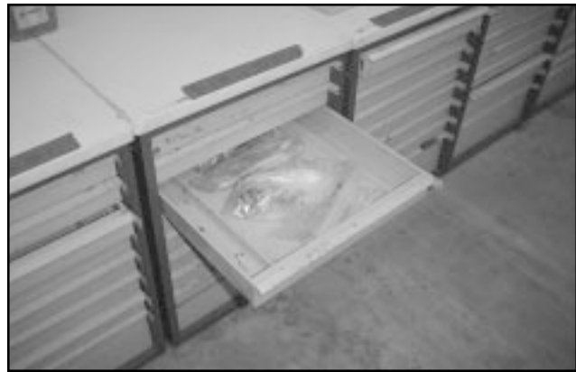
Figure 60. Artifacts are housed in metal drawers in metal storage units.

Ninety-nine percent of the Camp Beauregard artifacts in the Large Object Curation Facility are stored in metal drawers that measure 28.75 x 21 x 3 (inches, d x w x h) within storage units that measure 30 x 23 x 30.5 (inches, d x w x h) (Figure 60). Secondary containers consist of 2- to 4-mil plastic zip-lock bags, approximately 10% of which are secured with rubber bands rather than zip-locks, and one plastic film canister. The bags are labeled with the provenience, catalog number, investigator, and content.