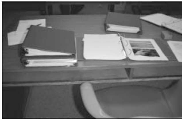
Figure 90. Three-ring binders house reports, some of which contain original photographs.

Records, consisting of both paper and photographic materials from the Bivouac/Annual Training Areas, are stored in three areas at SARC (Table 876). Most of the paper records are stored in metal letter- and legal-sized filing cabinets, labeled with a paper tag slipped inside a metal insert, in the site files room. Reports are located in three-ring binders on open wood shelves measuring 36 x 11 x 72 (inches, d x w x h) in an open portion of the SARC office area (Figure 90). Catalog forms are located in three-ring binders on open metal shelving units measuring 72.25 x 11.5 x 77 (inches, d x w x h) in a small room off of the artifact storage area. All binders have a paper tag label that slips into a slot on the binder.