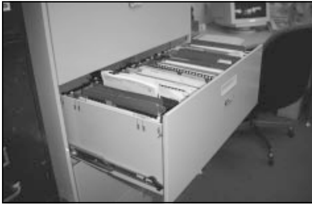
Figure 10. Records are housed in a lateral filing cabinet.

in marker and pencil, and the drawer is labeled with a typed paper label inserted into a plastic slot.