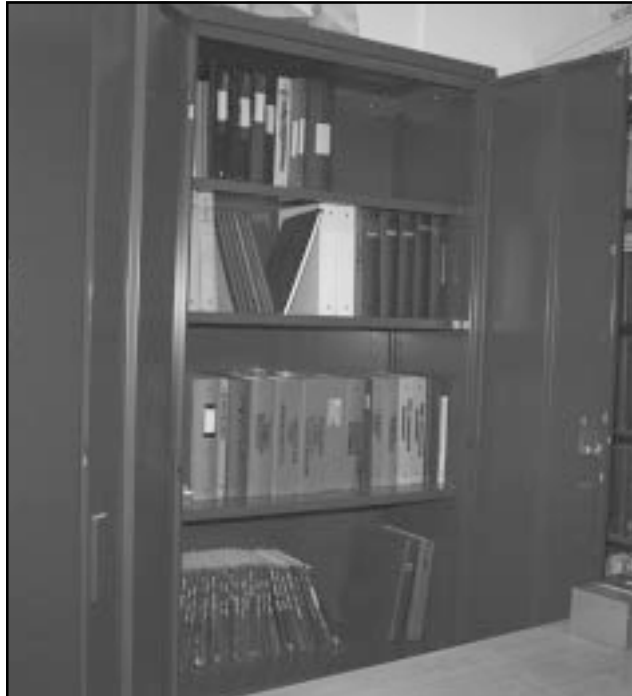
Figure 87. Documentation from Redmond Training Area/Central Oregon Training Site is kept in a metal cabinet.

Training Area/Central Oregon Training Site. The slides and contact sheets are kept in plastic sleeves.