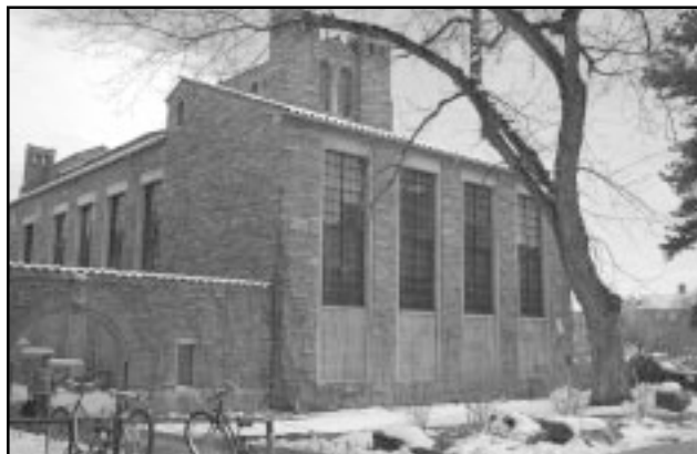
Figure 45. The University of Colorado Museum is located in the Henderson Building.

The University of Colorado Museum (UCM) is located in the Henderson Building, which measures approximately 22,000 ft 2 (Figure 45). It was originally constructed in 1935 for use as a museum and classroom space; today, it is primarily a museum, but also contains one classroom and offices. The museum has six departments with their own administration. The Anthropology Section