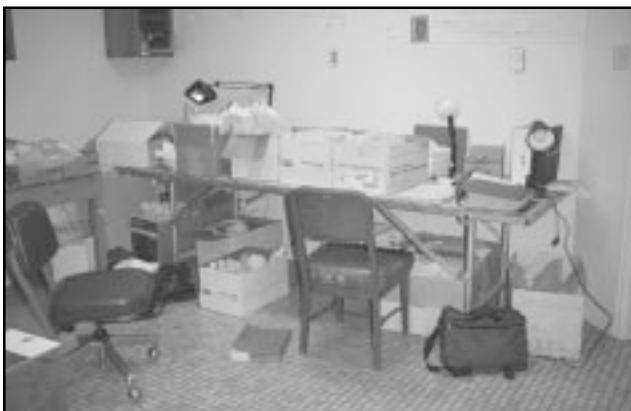
Figure 112. Artifacts are in various stages of processing.

Artifacts from Camp Guernsey are stored in several areas throughout the OWSA building. Some are on cafeteria trays on metal shelving units and are in the process of being washed, dried, and labeled. Some artifacts are on table tops awaiting processing (Figure 112). Artifacts that have already been