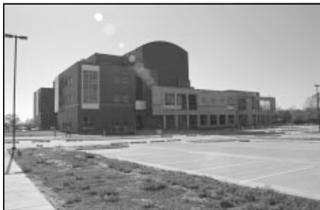
Figure 78. The Oklahoma Museum of Natural History is located on the University of Oklahoma.

Approximately 6.59 cubic feet of artifacts and 0.33 linear feet of Army National Guard associated documentation from projects conducted on Camp Gruber, Oklahoma, are housed at the Oklahoma Museum of Natural History.