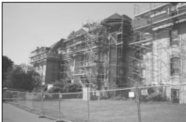
Figure 85. Waldo Hall, where the Anthropology Department is located, is currently undergoing exterior renovations.

Waldo Hall, located on the Oregon State University campus, houses the Anthropology Department and archaeological collections (Figure 85). Waldo Hall was constructed in 1907 for use as a women's dormitory. It has a concrete roof and brick exterior walls. The building, which is used as a university classroom and office building, has a shingled roof.