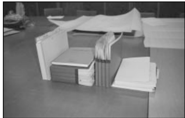
Figure 21. Associated documentation from Florence Military Reservation is stored in folders in a filing cabinet.