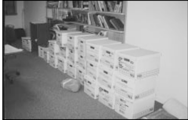
Figure 104. Artifacts are currently housed in acidic cardboard boxes on the floor.

Artifacts from Camp W. G. Williams and Richfield Organizational Maintenance Shop are stored on the floor (Figure 104) in a 4-mil plastic zip-lock bag or in acidic cardboard boxes that measure 15 x 12 x 10 (inches, d x w x h). Both the bag and boxes are directly labeled in marker. Two metates are stored loose on the floor, and are labeled with masking tape around them identifying site number, FS number, and provenience. Within the plastic bag and cardboard