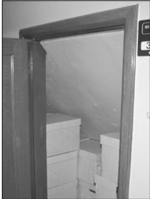
Figure 107. Room 335, the bulk storage area, houses collections from Camp W. G. Williams.

Artifacts from Camp W. G. Williams are stored on the floor of Room 335 (Figure 107) in an archival box that measures 15.75 x 12.5 x 10.25 (inches, d x w x h). The box is labeled with a typed adhesive label that identifies area, site, project name, box storage location, box number, and box contents. The box contains secondary containers consisting of 4-mil plastic zip-lock bags and a small archival box, which has a tertiary level of plastic zip-lock bags. Secondary containers are labeled directly in marker, and within the secondary containers are paper label inserts also labeled in marker. Both the secondary containers and paper label inserts are labeled with