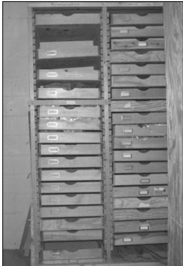
Figure 70. Artifacts are housed in a wooden drawer.

Artifacts from Camel Tracks Training Area are stored in the lab in a wooden drawer that measures 30 x 22.25 x 3.5 (inches, d x w x h) (Figure 70). The