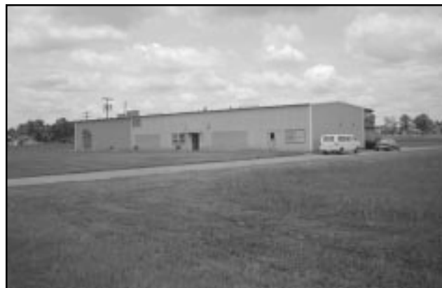
Figure 59. Archaeological collections from Camp Beauregard are housed in the Large Object Conservation Facility.

Currently, the Department of Social Sciences, which includes the Archaeology Laboratory, occupies portions of two buildings at Northwestern State University (NSU): Kyser Hall, which houses the records, and the Large Object Conservation Facility, which houses the artifacts (Figure 59). Kyser Hall contains the main NSU curation facility. The