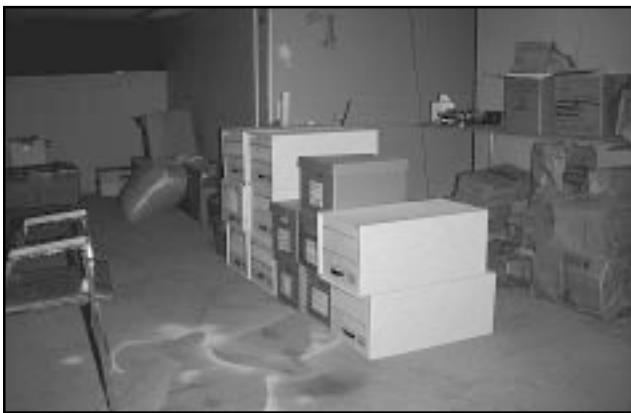
Figure 73. Associated documentation from Camp Grafton South and Garrison Local Training Area is stored in a mezzanine area in acidic cardboard boxes and filing cabinets.

Camp Grafton South records are stored in acidic manila folders within accordion files in one cardboard drawer of in an acidic cardboard banker's box filing cabinet, which measures 25.5 x 14 x 11.5 (inches, d x w x h) (Figure 70). The accordion files are labeled with adhesive labels that are typed or written in pen, and the manila folders are unlabeled.