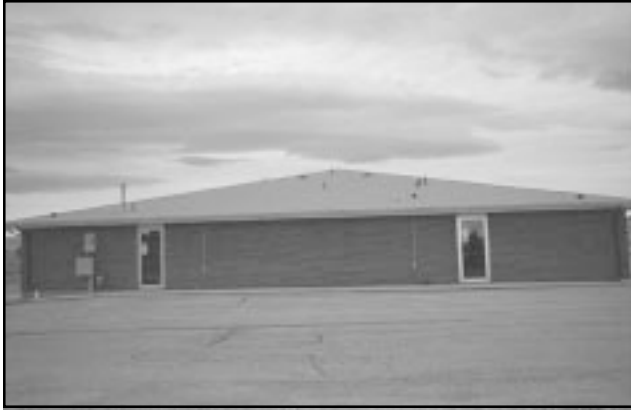
Figure 111. The Office of the Wyoming State Archaeologist is located in the Hayden-Wing building.

devoted to artifact holding, artifact washing, artifact processing, temporary artifact storage, records storage, and offices. The collections storage area is at 50% of its capacity.