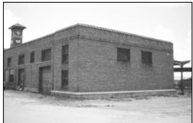
Figure 64. GCM Services is located in the KXLF station building.

GCM Services is located on the second floor of the historic Milwaukee Road Terminal Building, which is listed on the National Register of Historic Places. Office and laboratory space are leased from television station KXLF, which occupies the first floor (Figure 64). The Milwaukee Road Terminal