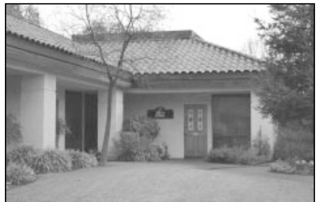
Figure 28. Applied Earthworks is located in a stucco building.

Applied Earthworks is located within the Shaw Fruit Business Plaza office building complex, built in the late 1980s or early 1990s (Figure 28). Applied Earthworks occupies one suite of the complex, and collections are stored in an open area of the office. The foundation is concrete. The exterior walls are stucco and the roof is clay tile. The building has always served as office space.