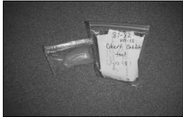
Figure 9. Artifacts are housed in plastic zip-lock bags.

Two artifacts are each stored in a plastic zip-lock bag on top of a metal filing cabinet (Figure 9). There are no secondary containers for the artifacts. One bag is unlabeled, and inside the larger bag, which is directly