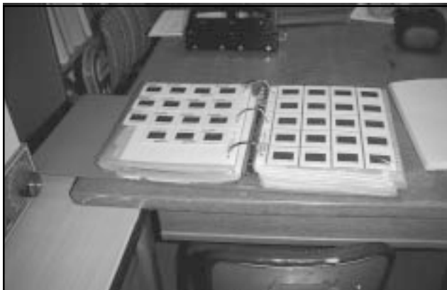
Figure 108. Slides are housed in archival sleeves.

Photographs are stored in an archival quality three-ring binder and slipcase on a metal shelf in Room 250. The binder has been labeled with an adhesive label written in pen. Approximately 0.03 linear feet of black and white prints, negatives, slides, and contact sheets are housed at the Museum of Peoples and Cultures from Camp W. G. Williams. The slides, negatives, and contact sheets are kept in archival sleeves (Figure 108). Color photos are stored in acidic paper envelopes.