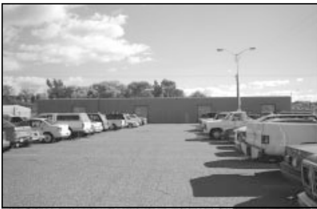
Figure 68. Army National Guard artifacts at the Maxwell Museum of Anthropology are stored in a warehouse.

A second repository, the warehouse, is the location of the artifacts from HAWK Battalion. The warehouse occupies 2,070 ft 2 and was originally constructed for use as a warehouse in the 1960s (Figure 68). It is a single-story, windowless structure constructed almost exclusively of concrete. The foundation and exterior walls are constructed of concrete, and the exterior walls have a stucco finish. The roof is made of corrugated metal and concrete blocks and is original to the building. The warehouse has a receiving/loading dock, and the entire space is used to store bulk archaeological collections.