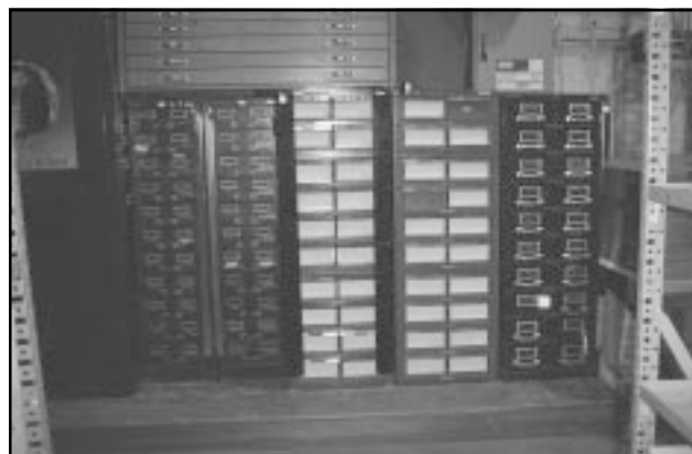
Figure 116. Small catalog cards are housed in locking metal cabinets.

Artifacts encompass a total of 3.90 ft 3 (Table 107) and all have been cleaned and most labeled with ink, which has been covered with a clear top coat.