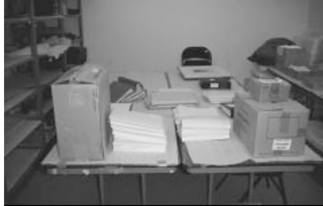
Figure 66. Artifact and records collections from Limestone Hills Army National Guard Training Site are housed in a variety of containers.

Artifacts (Figure 66) from Limestone Hills Army National Guard Training Site are stored on metal and wood shelves in the collections storage area in acidic cardboard boxes of varying dimensions. The boxes