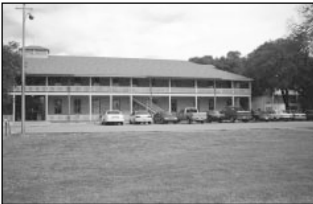
Figure 14. Texas Army National Guard collections are housed in the Camp Mabry Administration Building.

The Cultural Resources office of the Texas Army National Guard Headquarters at Camp Mabry serves as the temporary repository and processing laboratory for collections derived from Texas Army National Guard facilities since 1996, or those not permanently curated elsewhere. The Administration Building, which houses the Cultural Resources Office, is a multi-floored structure that contains offices and conference rooms (Figure 14). The structure was built in 1918 and has always served an administrative function. It has a pier and beam foundation, brick exterior walls, and a shingle roof.