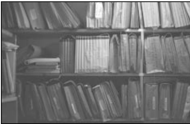
Figure 50. Records from Keaukaha Military Reservation are stored on wood shelves.

Records from Keaukaha Military Reservation encompass approximately 0.29 linear feet (Table 48). All records are stored in manila folders, file folders, or loose on wood shelves (Figure 50). Manila folders are directly labeled in marker or pen, or have an adhesive label.