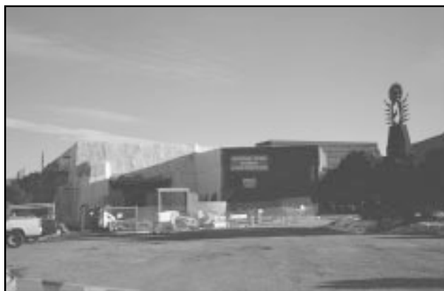
Figure 67. The Archaeological Records Management Section is located in the Museum of Indian Arts and Culture.

The Archaeological Records Management Section (ARMS) is part of the Laboratory of Anthropology, which is located in the basement of the Museum of Indian Arts and Culture (Figure 67). The building