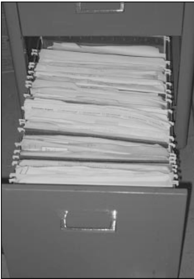
Figure 4. Some records are housed in a metal desk drawer in the Environmental Office.

Records for Camp Roberts are stored in a filing cabinet drawer, two drawers of Mr. Bertrando's desk (Figure 4), and on a metal shelving unit. Camp San Luis Obispo records are interspersed with the Camp Roberts records in the filing cabinet drawer and the desk drawers. The metal filing cabinet measures 25 x 17.75 x 52.5 (inches, d x w x h) and the drawer is labeled with a paper label in a metal slot at the front of the drawer. Secondary containers consist of acidic hanging file folders and manila folders, which have been labeled in marker, pen, or pencil. One of the unlabeled desk drawers holds paper records in acidic hanging folders and manila folders that are directly labeled in marker and pencil. The other desk drawer housing some of the photographic records is the same drawer that houses some of the artifacts. Finally, some paper records are stored in an unlabeled three-ring binder on metal shelves that measure 36 x 12 x 28.25 (inches, d x w x h).