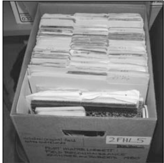
Figure 7. Records are housed in acidic cardboard boxes.

Most of the 8.25 linear feet (Table 13) of associated records are located in the same boxes as the artifacts and are organized by project (Figure 7). Two of the boxes contain records only, whereas the others contain records and artifacts. Within the boxes, records are housed in acidic manila folders, accordion folders, plastic three-ring binders, and archival photographic sleeves. Historic property catalog cards are stored in plastic zip-lock bags, and field notebooks are loose within boxes. Most of the folders and binders are directly labeled in marker with site number and contents. Records are also located on a shelf in plastic three-ring binders that have typed, slot labels inserted into the spine.