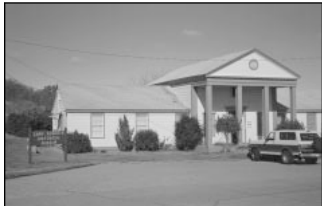
Figure 2. Some artifacts are on display in the Camp Roberts Museum.