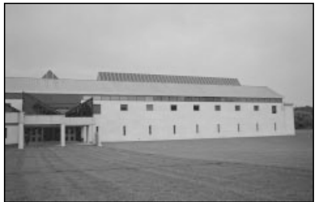
Figure 57. Exterior view of the Kansas State Historical Society where the archaeological collections are stored.

Archaeological materials from Smoky Hill Range (Nickell Barracks) are stored in two rooms of the Cultural Resources Division of the Kansas State Historical Society, which is part of the Kansas Historical Museum complex (Figure 57). The building was constructed in 1995, and includes offices, a research library, archives, archaeology laboratory and processing areas, artifact storage areas, site files, loading dock, supplies storage, study