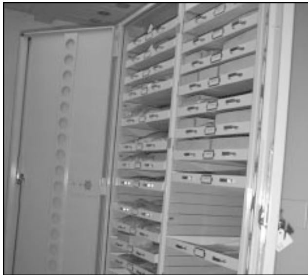
Figure 100. Artifacts in Room 19 are housed in drawers in museum cabinets.

The storage units in Room 19 of Building 5 consist of closed compact museum cabinets measuring 58.25 x 30 x 96 (inches, d x w x h) with flat drawers measuring 28.5 x 26 x 1.75 (inches, d x w x h) (Figure 100). Artifacts are stored in 2- to 3-mil zip-lock bags with acid-free paper tags placed inside each bag. Artifacts in Room 19 from Camp Bowie, Camp Swift, and Fort Wolters encompass 3.08 ft 3 (Table 94) and all have been cleaned, and some have been directly labeled.