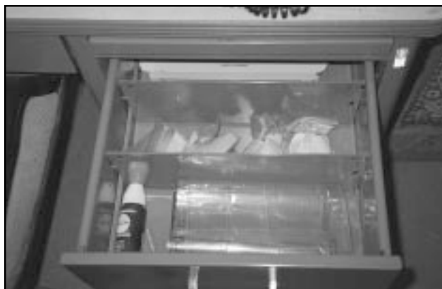
Figure 3. Some artifacts are stored in a metal desk drawer in the Environmental Office.

Within the drawer, artifacts are in 2- to 4-mil plastic zip-lock bags held together with rubber bands. The bags are not labeled but contain an acidic tag with the site number, date, investigator, and object type written in pencil. All artifacts in the Environmental Office encompass 4.65 ft 3 (Table 10)