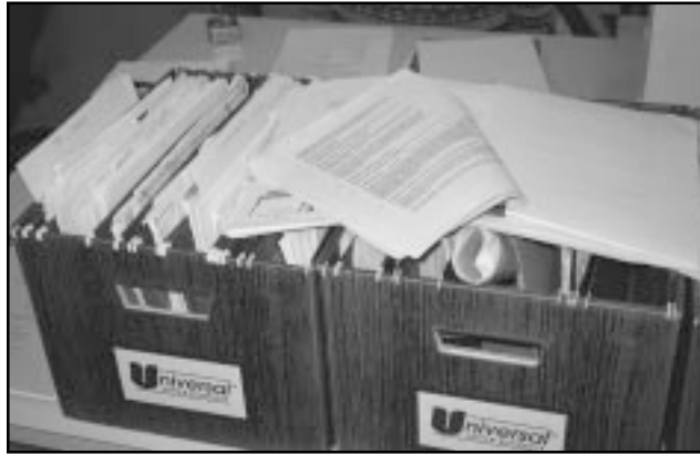
Figure 40. Records are housed in folders in acidic cardboard boxes.

skull fragments. These materials from Camp Roberts Training Site encompass approximately 0.05 ft 3 .