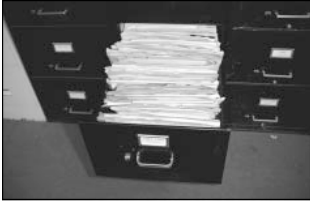
Figure 33. Paper records are stored in manila folders in a metal filing cabinet.