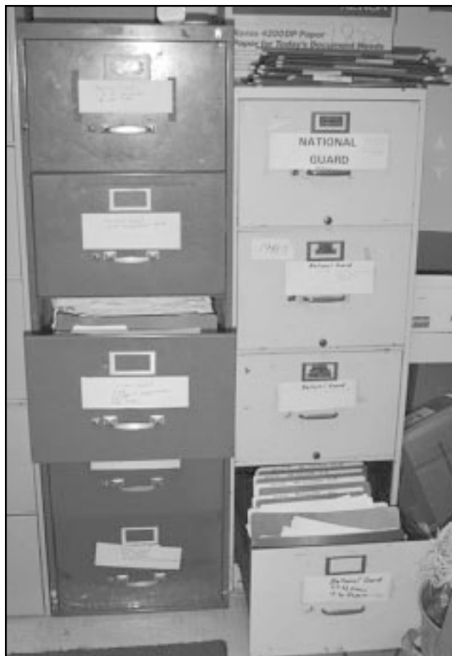
Figure 113. Two metal filing cabinets house collections from the Wyoming Army National Guard.

encompass approximately 17.67 linear feet (Table 105) and consist of paper records and photographs.