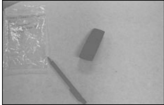
Figure 55. One artifact, a basalt adze, from Kanaio Training Area is housed at Ogden Environmental and Energy Services.

One artifact, a basalt adze, from Kanaio Training Area is stored in a box in the lab (Figure 55). The lab manager, who was not present during the assessment, had pulled the artifact prior to the review. Because the lab manager was not present, the box location could not be determined; however, boxes are stored on the floor and are of varying sizes, and most appear to be acidic cardboard. The adze is kept in a 2-mil plastic zip-lock bag with a direct label in marker. The adze encompasses approximately 0.02 ft 3 (Table 51) and has not been cleaned or labeled.