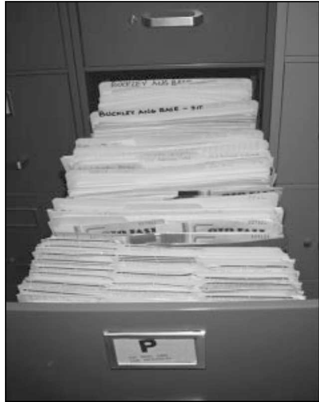
Figure 44. Associated documentation is stored in a metal filing cabinet.

Records are stored in one drawer of a locking metal filing cabinet that measures 26 x 14.75 x 51.75 (inches, d x w x h) (Figure 44). The drawer is labeled with a paper, typed, label inserted into the metal label slot on the front of the drawer. Secondary containers for records consist of acidic manila and accordion folders. Labels for the folders vary from