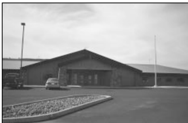
Figure 83. Exterior of the Bureau of Land Management, Prineville District.

Approximately 0.65 cubic feet of artifacts and 0.30 linear feet of Army National Guard associated documentation from projects conducted on Redmond Training Area/Central Oregon Training Site, Oregon, are housed at the Bureau of Land Management, Prineville District.