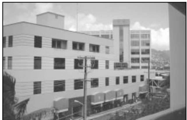
Figure 54. Ogden Environmental and Energy Services is located in the former Dole Corporation building.

processing plant for the Dole Corporation (Figure 54). The foundation is concrete with a steel and concrete building frame. The external walls are concrete, and the built-up asphalt roof was renovated 11 years ago. Ogden Environmental and Energy Services occupies approximately 10,000 ft 2 of the structure, most of which is used for report preparation and offices. Records are stored in this