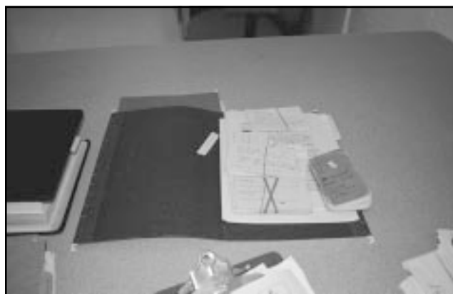
Figure 80. Field records comprise part of the associated documentation collection from Camp Gruber.

Paper records consist of field records, site files, reports, administrative records, and catalog records, and encompass 0.33 linear feet (Figure 80).