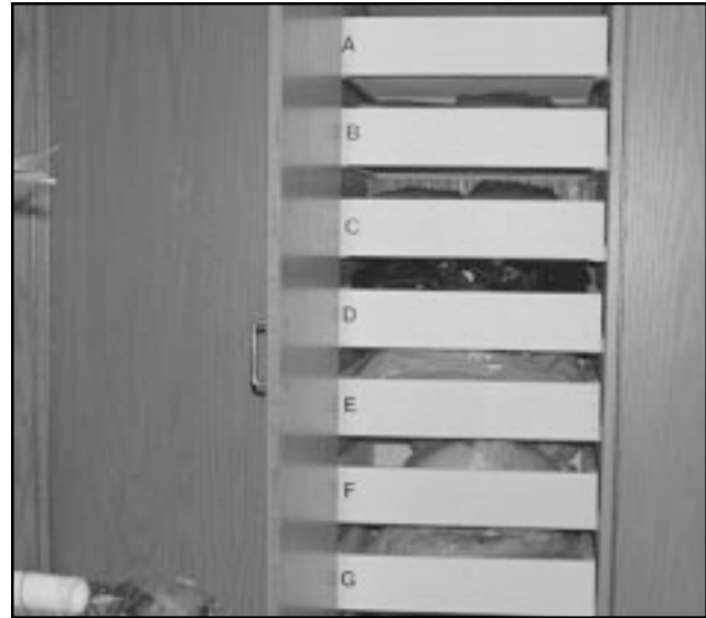
Figure 96. Artifacts from Camp Maxey are housed in drawers in a wooden storage unit.

Artifacts are stored in large wooden cabinets, measuring 24 x 19 x 76 (inches, d x w x h) with wood laminate drawers (Figure 96). The cabinets are labeled with consecutive numbers, and within each cabinet the drawers are labeled with consecutive letters. Artifacts are housed in a small acidic box and 3- to 4-mil plastic bags in the drawers. The box label