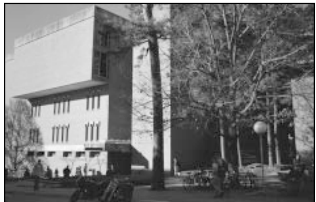
Figure 95. The Anthropology Department is located in the Ferguson Building on Stephen F. Austin University.

The Ferguson Building, which houses the Stephen F. Austin University Anthropology Department, is a multi-floored structure that contains offices, classrooms, laboratory space, and storage space (Figure 95). The structure was built in 1968 and has always served an academic function. It has a concrete foundation, brick exterior walls, and a