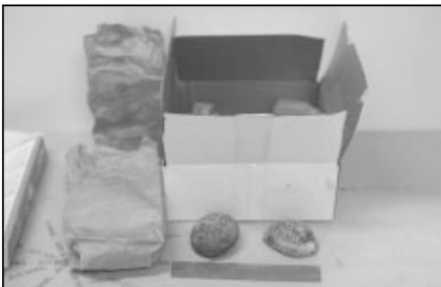
Figure 52. Artifacts from Kanaio Training Area are stored in an acidic cardboard box.

Artifacts from Kanaio Training Area are stored on wooden shelves in an acidic cardboard box that measures 10 x 10 x 4.5 (inches, d x w x h) (Figure 52). The box is directly labeled in marker. Secondary containers consist of paper bags and 2-mil plastic zip-lock bags, all of which are directly labeled in