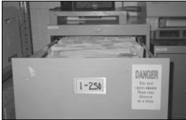
Figure 36. Records are housed in a metal filing cabinet.

procedures, and receipt, processing, use, and preservation of archaeological materials.