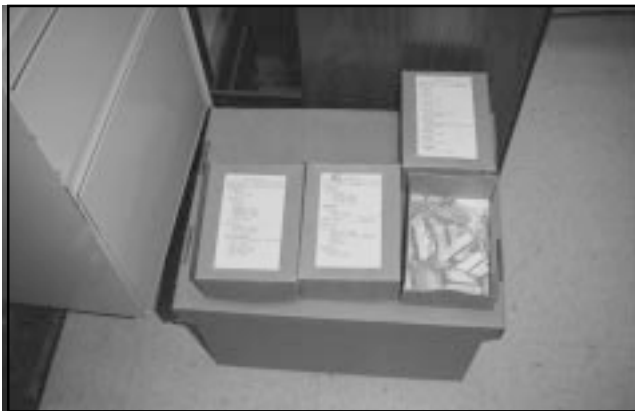
Figure 92. An example of primary and secondary containers used to house collections from Camp Bowie.

Artifacts from Camp Bowie are stored in acidic cardboard boxes measuring 15.5 x 12 x 10.5 (inches, d x w x h) on open metal utility shelving units measuring 48.5 x 18 x 57 (inches, d x w x h). Secondary containers consist of three smaller acidic cardboard boxes (Figure 92), and within these is a tertiary level of 3- to 4-mil zip-lock bags and “Whirl Paks.” Some of the “Whirl Paks” are nested inside the zip-lock bags. Artifacts encompass approximately 0.15 ft 3 (Table 88) and all have been cleaned and labeled.