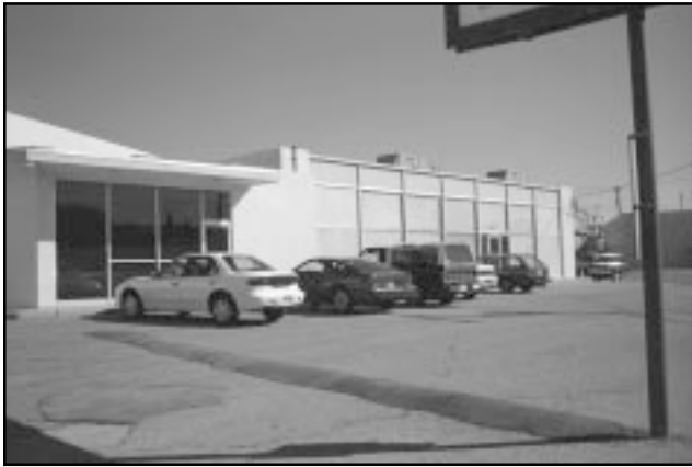
Figure 69. The Office of Contract Archeology is housed in a building that was formerly a flower shop and a laundromat.

aluminum frame glass door. Most of the front of the building is metal-framed glass windows with blinds.