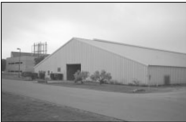
Figure 99. Some archaeological collections are housed in Building 33.

Building 5 is the main TARL curation facility. It was constructed in 1941 as a magnesium warehouse. The entire 32,810 ft 2 building is a steel frame construction on a concrete slab enclosed with corrugated transite panels (asbestos asphalt composite) and brick. Large, metal-framed, single pane, painted windows rest on the brick lower portion of the wall. TARL occupies the building with the Aerospace Engineering Department, and the two departments are separated by concrete masonry walls. The area occupied by TARL houses artifact and record collections, offices, and laboratory space on the first floor, and offices and artifact collections on a mezzanine second level. Human remains are stored on the third floor. Three collections storage areas in Building 5 house Army National Guard collections.