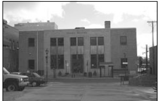
Figure 22. SWCA is located in the old Federal Building in Flagstaff, Arizona.

The building that houses SWCA was constructed in 1927 and originally functioned as a post office (Figure 22). SWCA moved into the building in 1993–1994. It is a three-story structure; two stories are above grade, and one below grade, with a total area of approximately 17,000 ft 2 . The building has a