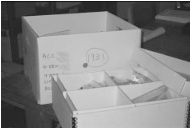
Figure 35. Artifacts are housed in an archival box.

Within the box are two layers of acid-free trays with compartments, which allows for two