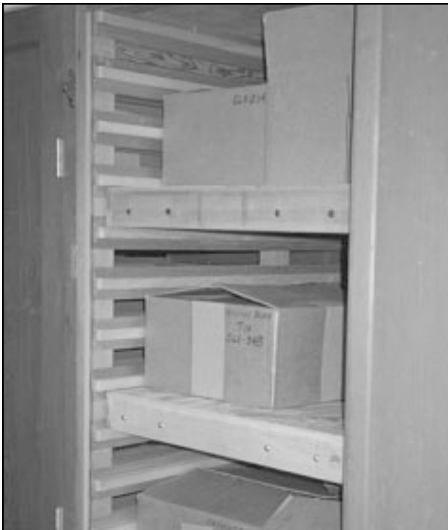
Figure 42. Collections from Camp San Luis Obispo are housed in an acidic cardboard box in a wood cabinet.

Artifacts are housed in a wood cabinet that measures 28 x 27 x 77 (inches, d x w x h). The primary container for the artifacts is an acidic cardboard box measuring 10.25 x 8.25 x 6.5 (inches, d x w x h) (Figure 42). Within the box are 1- to 2-mil plastic bags that are stapled shut. Acidic paper tags labeled in marker with site number and site type are in each plastic bag. Artifacts encompass 0.15 ft 3 and all have been cleaned, but none are directly labeled (Table 40).