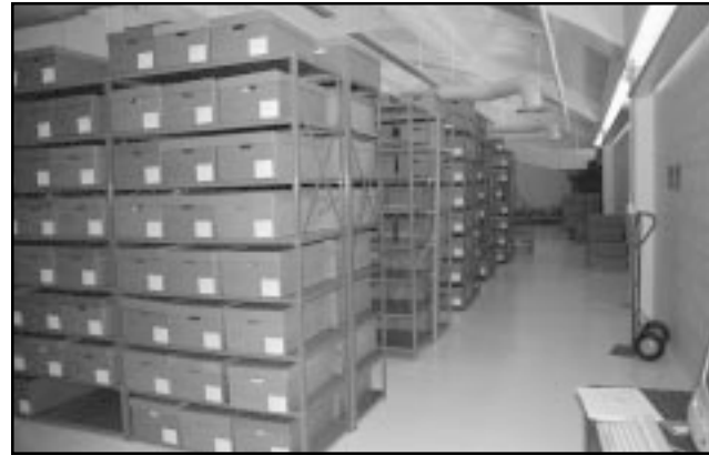
Figure 79. Artifacts are housed in archival boxes on metal shelves.

containers consist of archival cardboard boxes measuring approximately 23.75 x 13.25 x 9.25 (inches, d x w x h). Box labels are adhesive with typed information including box number, archaeological region, county, and sites. Secondary