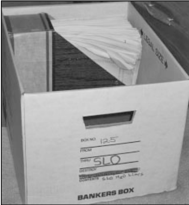
Figure 37. Associated documentation from Camp San Luis Obispo is stored in an acidic cardboard box.

measures 16 x 12.75 x 10.5 (inches, d x w x h), is directly labeled in marker with the box number and project name. Within the box, the records are stored in acidic manila folders in one plastic and one acidic cardboard magazine holder (Figure 37). The holders are labeled with adhesive labels written in marker. Photographic materials are kept in the original photographic processing envelopes within the manila folders.