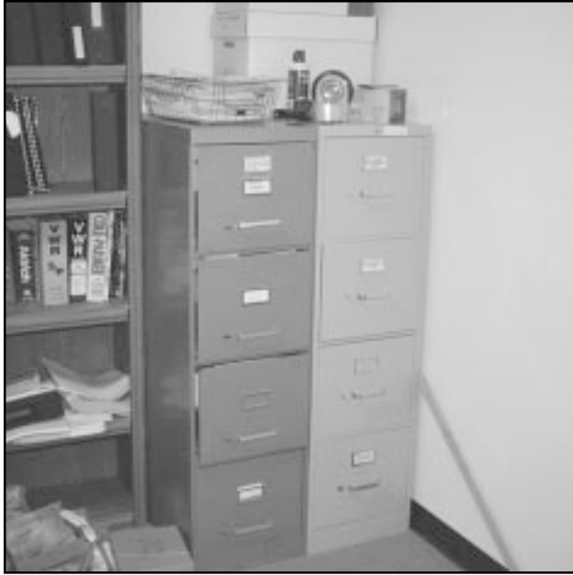
Figure 24. Paper records from Camp Navajo are stored in metal filing cabinets in the Laboratory Director's office.

processed. The contact prints and photographs are directly labeled in pencil, while the negative sheets are directly labeled in black marker. The labels include project number and roll number.