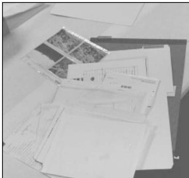
Figure 56. Associated documentation, including photographs, from Kanaio Training Area is housed at Ogden Environmental and Energy Services.

survey records, and maps. There are some contaminants, such as paper clips and staples, present in the records.