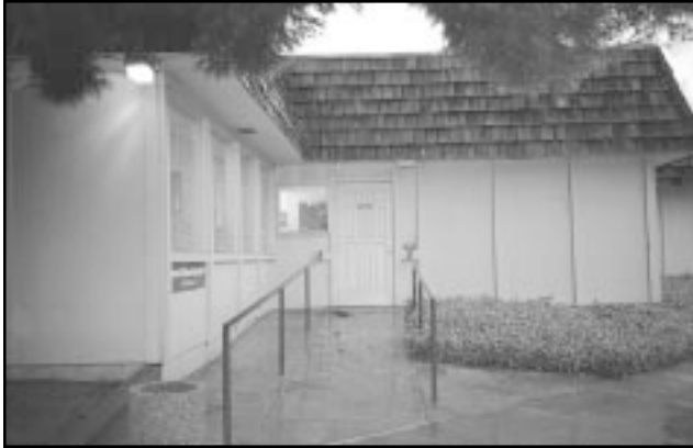
Figure 38. Jones and Stokes Associates houses collections in the Annex.

asphalt roof. The building also houses other businesses, such as medical offices.