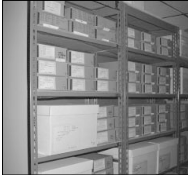
Figure 89. Artifacts are housed on space saver shelving units.

Artifacts are stored on moveable, compact, metal-framed plywood shelves measuring 72 x 24 x 90 (inches, d x w x h) (Figure 89) measuring 11 x 8.5 x 3.5 (inches, d x w x h) and one archival box measuring 10.5 x 8.5 x 3 (inches, d x w x h). The archival box is labeled with a paper label inserted into a plastic sleeve, and the archival box is directly labeled. Both labels are written in pen with accession and site numbers, and the archival box label also includes the