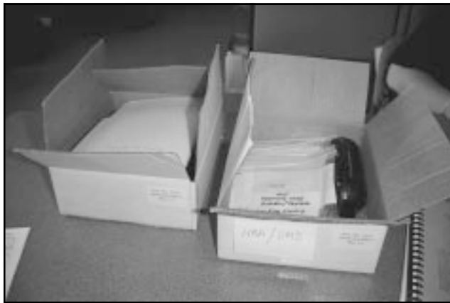
Figure 84. Artifacts from Redmond Training Area/Central Oregon Training Site are housed in acidic cardboard boxes.

Artifacts from Redmond Training Area/Central Oregon Training Site are stored on wooden shelves in the Archives room in acidic cardboard boxes that measure 12.25 x 10.25 x 4.5 (inches, d x w x h) (Figure 84). The boxes have typed adhesive labels that identify the accession number, project number, and box number. The cardboard boxes contain secondary containers consisting of 2- to 4-mil plastic bags. The plastic bags are labeled directly in marker with information including site number, provenience, date, accession number, and contents. Artifacts encompass a total of 0.65 ft 3 (Table 81) and all have been cleaned and directly labeled with black or white ink.