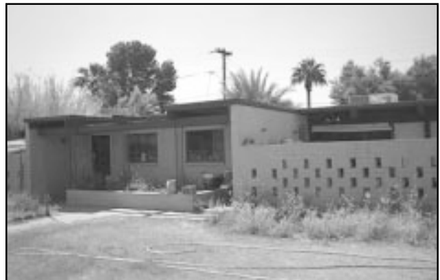
Figure 17. Archaeological Research Services is located in a duplex in Tempe, Arizona.

Archaeological Research Services (ARS) is located in a residential neighborhood in Tempe. The office is in a duplex house that was built in 1956 and encompasses approximately 2,100 ft 2 (Figure 17). The building has a concrete slab foundation and has