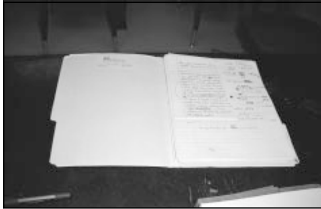
Figure 97. Records from Camp Maxey.

classroom (Table 92). Records are housed in an acidic manila folder, directly labeled in pen (Figure 97).