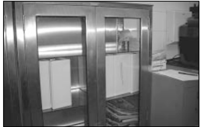
Figure 61. Photographs from Camp Beauregard are housed in a metal and glass cabinet.

Photographic materials, consisting of negatives and color slides, encompass approximately 0.40 linear feet of the collection. The photographic materials are stored separate from the paper records in a metal and glass cabinet (Figure 61), and the slides are in a three-ring binder.