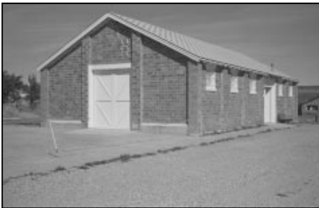
Figure 11. The Montana Military Museum on Fort William Henry Harrison was formerly used as a repair shop.

The Montana Military Museum is located in Building T-15 on Fort William Henry Harrison. The building was originally constructed 80 to 90 years ago for use as an ordnance and material (tent, canvas) repair shop (Figure 11). The building has a concrete foundation and clay tile and fired brick walls, which are exposed on the interior. The roof of the building, now used as a museum and collections facility, is built-up asphalt.