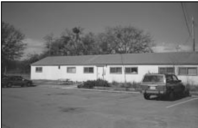
Figure 5. Collections are housed in Building 196 on Fort Hunter Liggett.

The Cultural Resources office, located in the Environmental Division in Building 196, of Fort Hunter Liggett serves as the repository for most collections derived from the post (Figure 5). Building 196 is a one-story structure that contains offices. The structure was built in 1956 and has always served an administrative function. It has a concrete slab foundation, wood siding exterior walls, and a shingle roof.