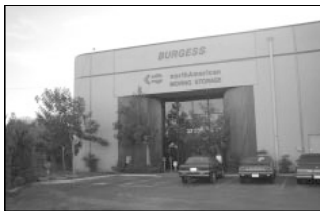
Figure 30. Exterior of the North American Van Lines building where Archaeological Curation Unit collections are housed.

The Archaeological Research Unit (ARU) is located on the campus of the University of California, Riverside (UCR). The Archaeological Curation Unit (ACU), where the collections are stored, is off campus in a rented space in a North American Van