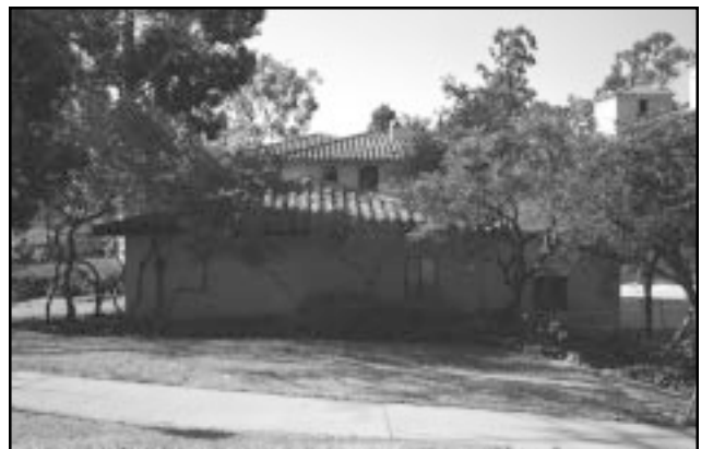
Figure 34. Collections are currently housed in Hershey Hall.

Approximately 0.60 cubic feet of artifacts and 0.01 linear feet of Army National Guard associated documentation from projects conducted on Camp Roberts Training Site, California, are housed at the Fowler Museum of Cultural History.