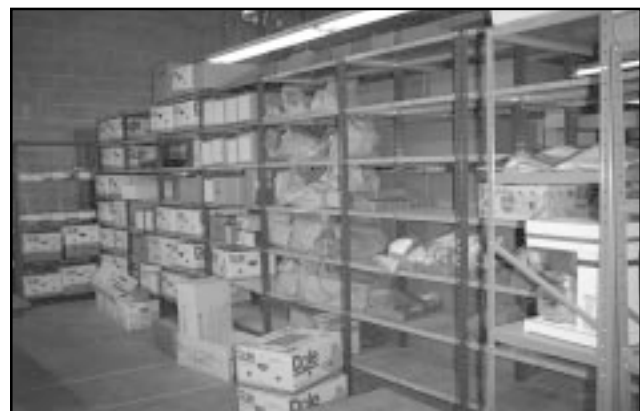
Figure 26. Artifacts are temporarily stored at Statistical Research, Inc. in acidic cardboard boxes on wood and metal shelves.

Artifacts recovered from Air Force Plant 44, Camp Navajo, Florence Military Reservation, and Silver Bell Army Heliport are housed on metal and wood shelving units in the collections storage area of the SRI laboratory (Figure 26). Artifacts are stored in acidic cardboard boxes of varying dimensions that have been labeled directly in pencil or marker or with a pre-printed adhesive label. Label information includes some or all of the following: project, site number, facility, box number, date, item number, and material class. The boxes contain secondary containers consisting of 2-mil zip-lock plastic bags,