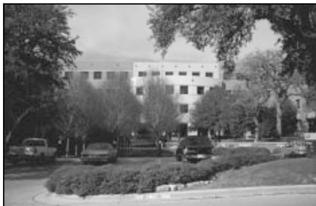
Figure 93. Exterior of the Hancock Building, where the Lower Colorado River Authority is located.

The Lower Colorado River Authority (LCRA), located in the Hancock Building, is a non-governmental utility and public service company providing electricity and water resources to much of Texas (Figure 93). The Hancock Building, constructed in 1992, serves as the repository for collections generated by LCRA archaeological projects. The multi-floored building's foundation is concrete and the exterior walls are brick.