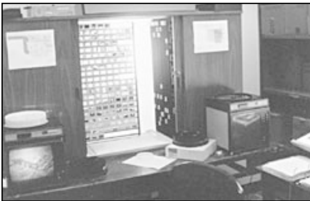
Figure 77. Slides from Camp Gruber are housed in a slide cabinet.

Camp Gruber records collections, consisting of photographic prints and negatives, are housed in acidic folders directly labeled in marker in one drawer of a metal letter-sized filing cabinet (Table 74). The drawer is labeled with a paper label handwritten in marker inserted into the metal label slot on the front of the drawer. Slides are stored in one slide rack, labeled with a typed adhesive label, in a wood slide storage cabinet that measures 60 x 20 x 36 (inches, d x w x h) (Figure 77).