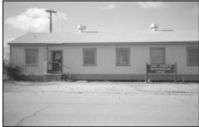
Figure 1. Records and some artifacts are housed in the Environmental Office on Camp Roberts Training Site

storage space. The structure was built in the 1940 and originally served as barracks (Figure 1). It has a concrete foundation, wood siding exterior walls, and a shingle roof. The Camp Roberts Museum occupies a one and a half story building that was built in 1940-1941 and was originally used by the Red Cross (Figure 2). The building has a concrete foundation, wood exterior walls, and a shingle roof. The building contains exhibits and military collections storage space.