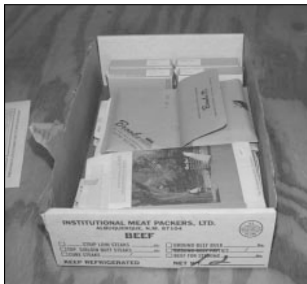
Figure 71. Associated documentation from Camel Tracks Training Area is housed in a variety of containers.

Records from Camel Tracks Training Area encompass approximately 0.21 linear feet (Table 66). They are stored in a three-ring binder on a wood shelf in an office in the east wing. The binder has been labeled in white ink. Records from HAWK Battalion encompass approximately 1.24 linear feet and are stored in three-ring binders on a wood shelf in an office, in manila folders in an acidic cardboard box top on a wood shelf in an office, and in manila folders in a metal filing cabinet in a another office (Figure 71). The binders have an adhesive label in marker with site numbers, and manila folders are directly labeled or have an adhesive label written in pen or pencil.