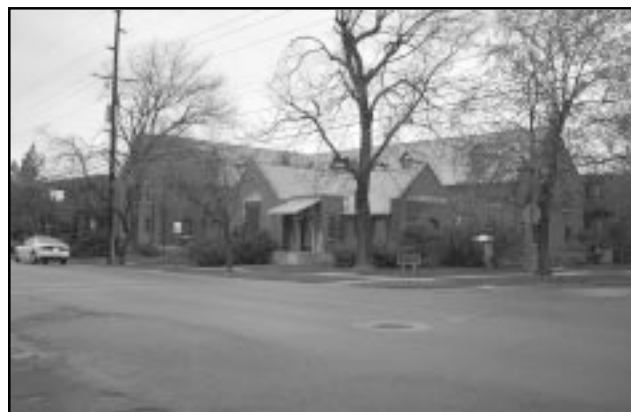
Figure 106. The Museum of Peoples and Cultures is located on Brigham Young University.

The Museum of Peoples and Cultures is located in Allen Hall on the campus of Brigham Young University (Figure 106). Also housed on the second floor of Allen Hall is the Office of Public