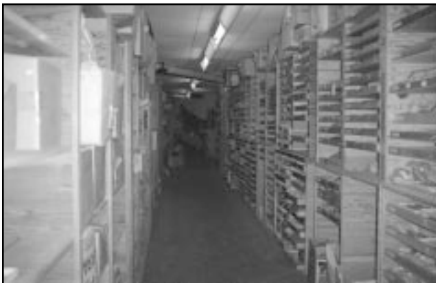
Figure 86. Artifacts are housed on wooden shelves in a tunnel that connects Waldo Hall to another building.

Artifacts from Redmond Training Area/Central Oregon Training Site are stored on wooden shelves in the tunnel (Figure 86) in acidic cardboard boxes of varying dimensions. The boxes are labeled with a paper label taped to the box or directly in marker