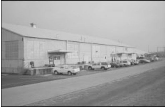
Figure 98. The Texas Archaeological Research laboratory is located in Building 5.

campus was originally used for magnesium production during World War II. Currently, TARL occupies portions of Building 5 (Figure 98) and Building 33 (Figure 99) on the research campus.