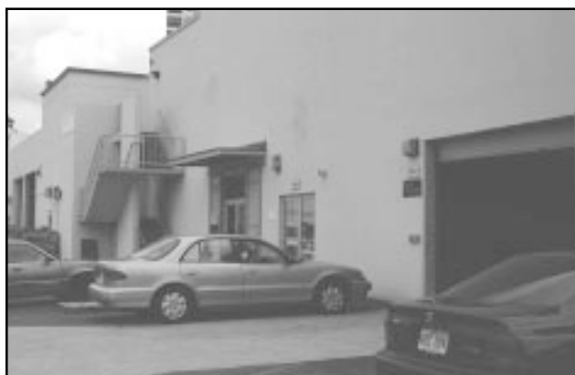
Figure 51. Garcia and Associates is located in a concrete building.

Approximately 0.26 cubic feet of artifacts and 1.08 linear feet of Army National Guard associated documentation from projects conducted on Kanaio Training Area, Hawaii, are housed at Garcia and Associates. This office was previously evaluated for a different project (Felix et al. 2000). Most of the repository information has not changed since that visit and will be repeated for this chapter.