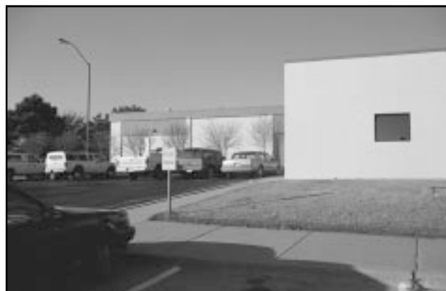
Figure 81. Vehik and Vehik Consulting houses collections in the University of Oklahoma Archeology Laboratory.

Vehik and Vehik Consulting uses laboratory space at the University of Oklahoma Department of Anthropology's Archeology Laboratory in Norman for curation of archaeological materials generated from its contracted projects (Figure 81). The building is a single-story structure that contains offices, laboratory space, site files, loading docks, and storage space. The structure was built 6–10 years ago and has always served an academic/scientific function. It has a concrete foundation,