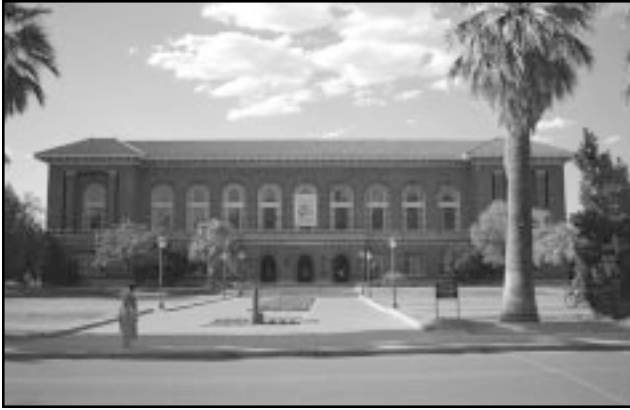
Figure 19. Arizona State Museum artifacts are housed in the North Building on the University of Arizona campus.

Windows in the facility are of varying shapes and sizes, all of which are in locking steel frames that are original to the building. All windows have blinds and in some cases have been covered with a semi-transparent shade to reduce light and ultraviolet rays entering the storage areas. All of the utilities present in the facility are original to the construction of the building.