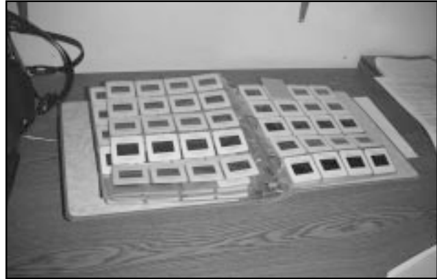
Figure 18. Slides from Florence Military Reservation are stored in archival sleeves in a three-ring binder.

Approximately 0.03 linear feet of black and white prints and slides are housed ARS. Slides are stored in archival-quality plastic slide sheets, and the slides have been directly labeled (Figure 18).