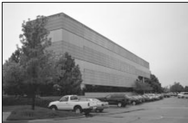
Figure 43. Powers Elevation Company is located in the Central Place 1 building.

Powers Elevation Company (PEC) is located within the Central Place 1 office building, built in 1984–1985 (Figure 43). The entire building encompasses an estimated 50,000 ft 2 of office space, storage areas, a mechanical/utility room, and a security monitoring area. Since 1988, PEC has occupied approximately 4,863 ft 2 of this space. PEC does not have a formal laboratory/processing area but uses a kitchen as an artifact holding, washing, and processing space.