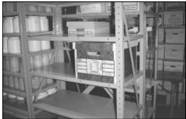
Figure 46. Buckley Air National Guard Base artifacts are housed in an acidic cardboard box on metal shelves.

All artifacts from Buckley Air National Guard Base are stored in the CRM archaeological collections storage area on stationary metal shelves that measure 43 x 18 x 110 (inches, d x w x h). The primary container for the artifacts consists of one acidic cardboard box measuring 16 x 12 x 10 (inches, d x w x h) (Figure 46). The box is directly labeled in pen and marker with the county and site numbers. The secondary containers consist of 2-mil plastic zip-lock bags, unsealed paper envelopes, one rolled-up paper bag, and one plastic film canister. Approximately one-third of the secondary containers is directly labeled in marker with the site number and investigator. All of the zip-lock bags contain acidic paper labels. Artifacts encompass 1.11 ft 3 (Table 45) and all have been cleaned, and approximately 75% have been directly labeled with ink.