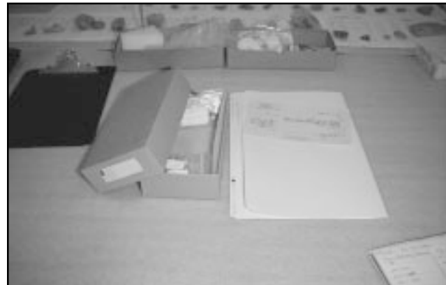
Figure 48. Artifacts and records from Camp George West housed at the University of Denver Museum of Anthropology.