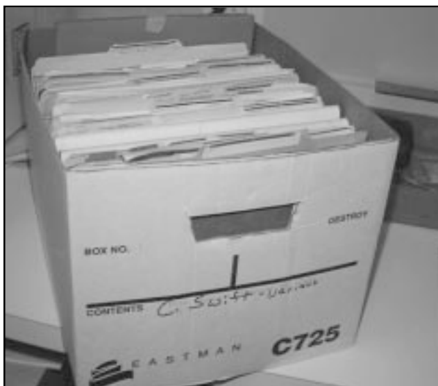
Figure 94. Paper records from Camp Swift are housed in manila folders in an acidic cardboard box.

Paper records comprise approximately 0.25 linear feet and consist of survey and analysis records and reports. The records are stored in manila and file