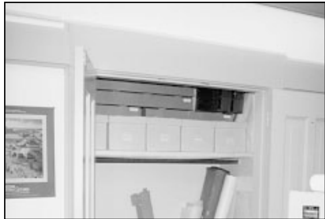
Figure 15. Processed artifacts are housed in archival containers in a closet.

Artifacts are stored in archival boxes measuring 12 x 8.75 x 5.75 and 15.75 x 12.75 x 10.5 (inches, d x w x h) (Figure 15). All of the boxes have foil-backed adhesive labels with facility and site number information. Secondary containers consist of 4-mil plastic zip-lock bags, which have paper insert labels with project, site, provenience, and artifact information, as well as box and bag numbers. Artifacts encompass 9.24 ft 3 (Table 19) and all have been cleaned and directly labeled.