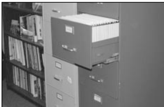
Figure 16. Some associated records are housed in a metal filing cabinet.

Paper records and photographic materials (Table 20) are stored in three locations in the Cultural Resources office: in archival folders with adhesive labels in two metal letter-sized filing cabinets, in one horizontal map case, and in five unlabeled three-ring binders on a wooden shelf (Figure 16). Drawers are labeled with paper inserts in metal slots. The filing cabinets have key locks, and the map case is secured with a heavy metal chain and padlock. Unprocessed field records and photographic materials are stored in unlabeled archival flip-top boxes measuring