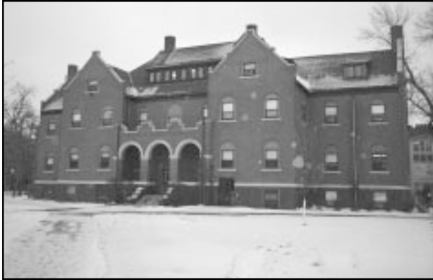
Figure 75. Some archaeological collections are housed in Babcock Hall at the University of North Dakota, Grand Forks.