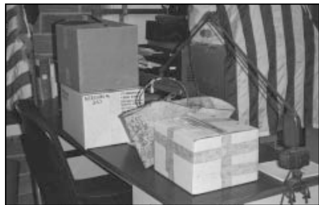
Figure 12. Artifacts are housed in acidic cardboard boxes. Some artifacts, such as this bucket, are loose on the shelf.

Artifacts from Fort William Henry Harrison are stored in several locations in the Montana Military Museum: loose on the floor and in an acidic cardboard box on a table in the office area; and in acidic cardboard boxes of varying sizes on metal shelves and loose on metal shelves in the artifact storage area (Figure 12). Approximately 1.5 ft 3 of the collection are on display in a wood and glass display case in the museum itself. Most of the cardboard boxes are labeled directly in marker with the accession number, and one box is labeled with a post-it note identifying the status, contents, and provenience. The cardboard boxes contain secondary