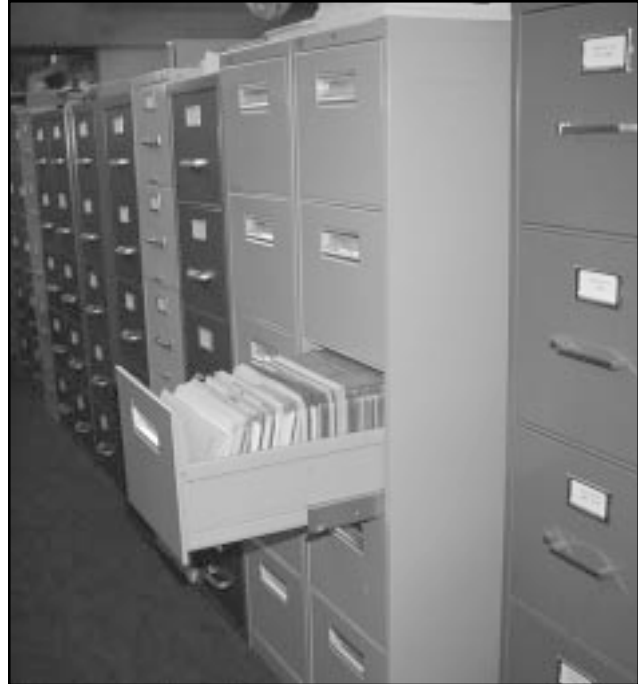
Figure 58. Associated documentation from Smoky Hills Range is housed in a metal filing cabinet.

Records (Table 53) are stored in archival and acidic folders, directly labeled in marker, in one drawer of a metal, five-drawer, letter-sized filing cabinet (Figure 58). The drawer is labeled with a typed paper label inserted into a metal label slot on the front of the drawer. Security copies of paper records are