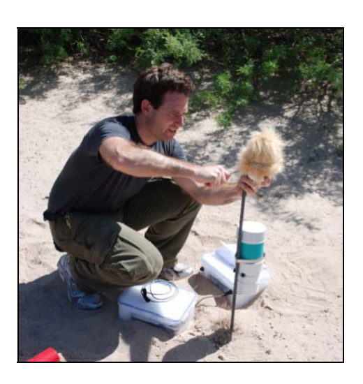
Autonomous Recording Units (ARUs) deployed at Ft. Huachuca, AZ

We have demonstrated proven applicability for monitoring target species and for enhancing DoD ability to evaluate and monitor avian resources on and off DoD lands. This translates into better use of highly limited resources and improved readiness to address requirements of special legislation regulating threatened and endangered species. These approaches represent cost effective methods for surveying, saving valuable human and financial resources without compromising collection of data crucial for maintaining mission readiness on DoD installations. This powerful system for monitoring can target species of concern, particularly those that might be elusive, rare, or difficult to survey, to monitor these species in a cost effective way.