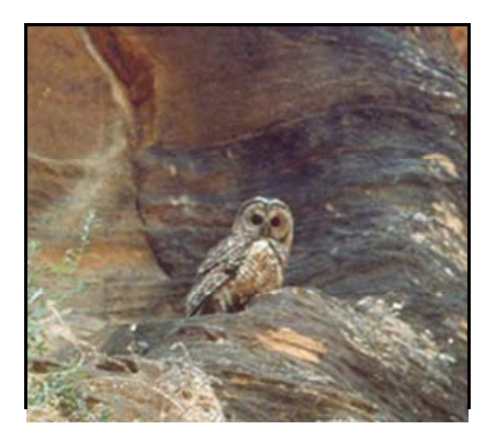
Mexican Spotted Owl (US Fish & Wildlife Service)

Two broad goals for the scope of this project were: to assess calling phenology of two target species on two DoD installations and to assess the behavior of the autonomous recording units (ARUs) and sound analysis software (Raven, XBAT) used in previous research funded under SERDP and Legacy. To achieve both of these goals, we deployed ARUs over periods of weeks or months to survey two species of concern, "Mexican" Spotted Owl (Strix occidentalis lucida; SPOW) at Fort Huachuca, Arizona and Eastern Whippoor-will (Caprimulgus vociferous; EWPW) at Fort Drum, New York, to document vocal phenology at breeding location, with preference given to areas where local bird abundance was known and visual surveys could occur with ease, and when and where relevant in relation to environmental factors.