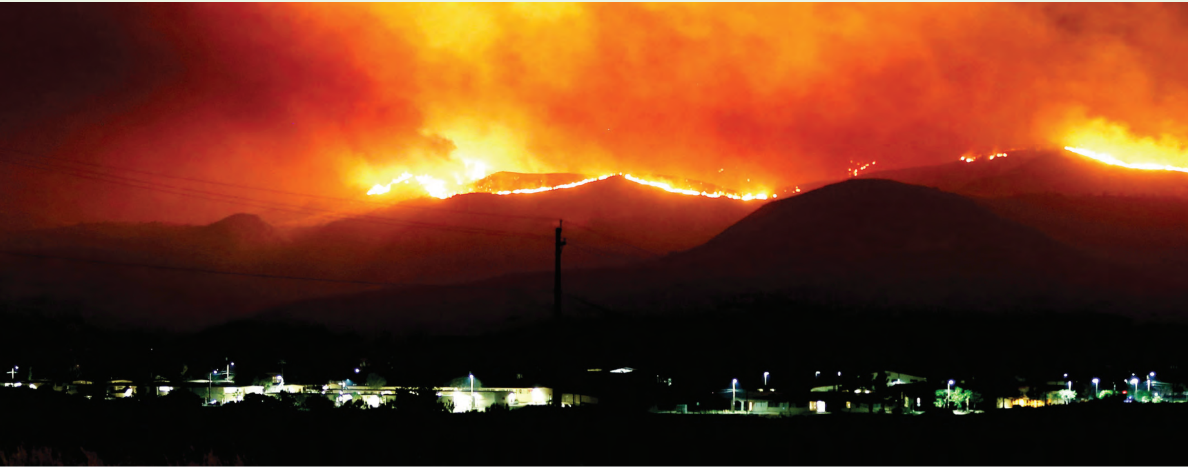
Rising temperatures and long-term drought are increasing wildfire risks across the West. The 2014 Tomahawk fire on Naval Weapons Station Seal Beach Detachment Fallbrook forced evacuations from neighboring Marine Corps Base Camp Pendleton.