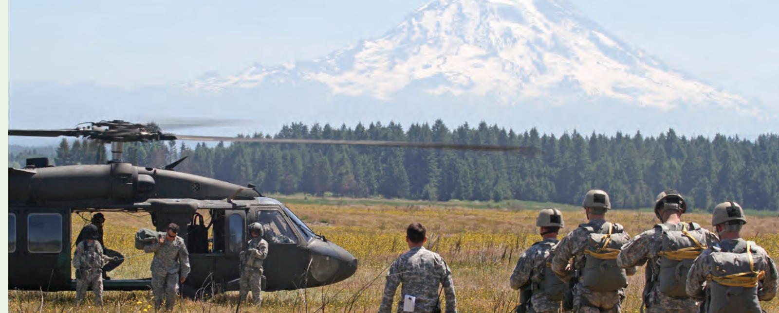
Adaptation planning can help installation natural resource managers prepare for and reduce climate vulnerabilities and risks.