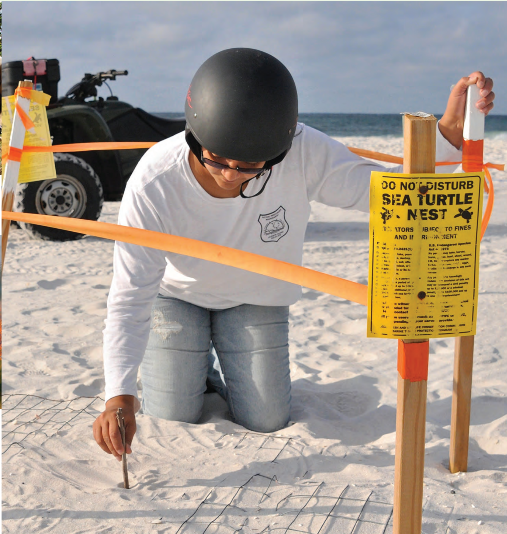
Warming temperatures and other climatic changes will increasingly affect DoD natural resource management efforts. The ratio of female to male sea turtle hatchlings, for example, is largely determined by sand temperature during incubation (Santa Rosa Island Range, Eglin Air Force Base).

Climatic changes already are disrupting key biological processes and can affect traditional land uses and management activities.