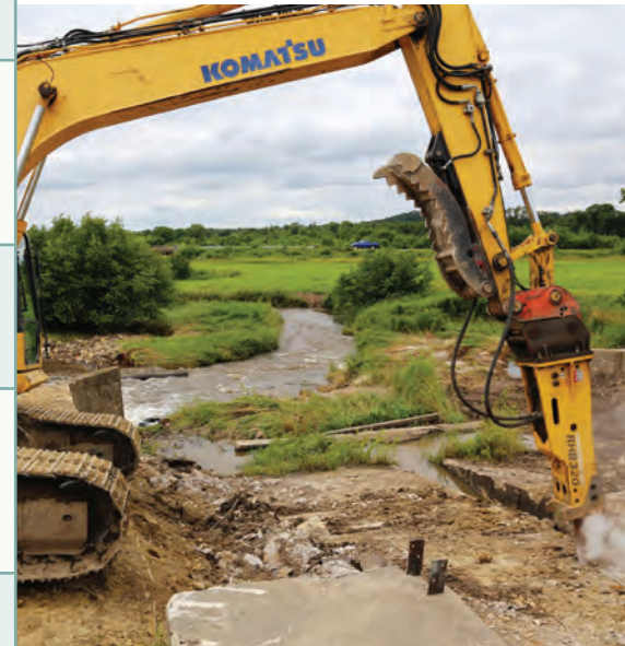
Modifications or refinements of existing INRMP projects may be needed to account for future climatic conditions (Fort McCoy).