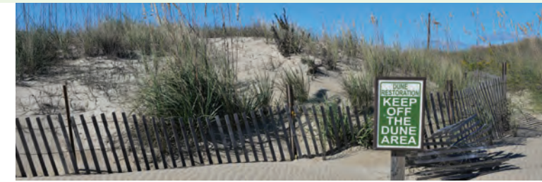
The INRMP adaptation planning process can highlight opportunities for natural systems to protect installation assets from climate-related risks (Naval Air Station Oceana).

The INRMP implementation table provides a concise summary and rationale for projects to be carried out under an approved INRMP and serves to inform installation programming and budgeting, including through the Program Objective Memorandum (POM) process. For this reason, ensuring that projects capable of reducing key climate risks are incorporated into the INRMP implementation table is a crucial outcome of the adaptation planning process.