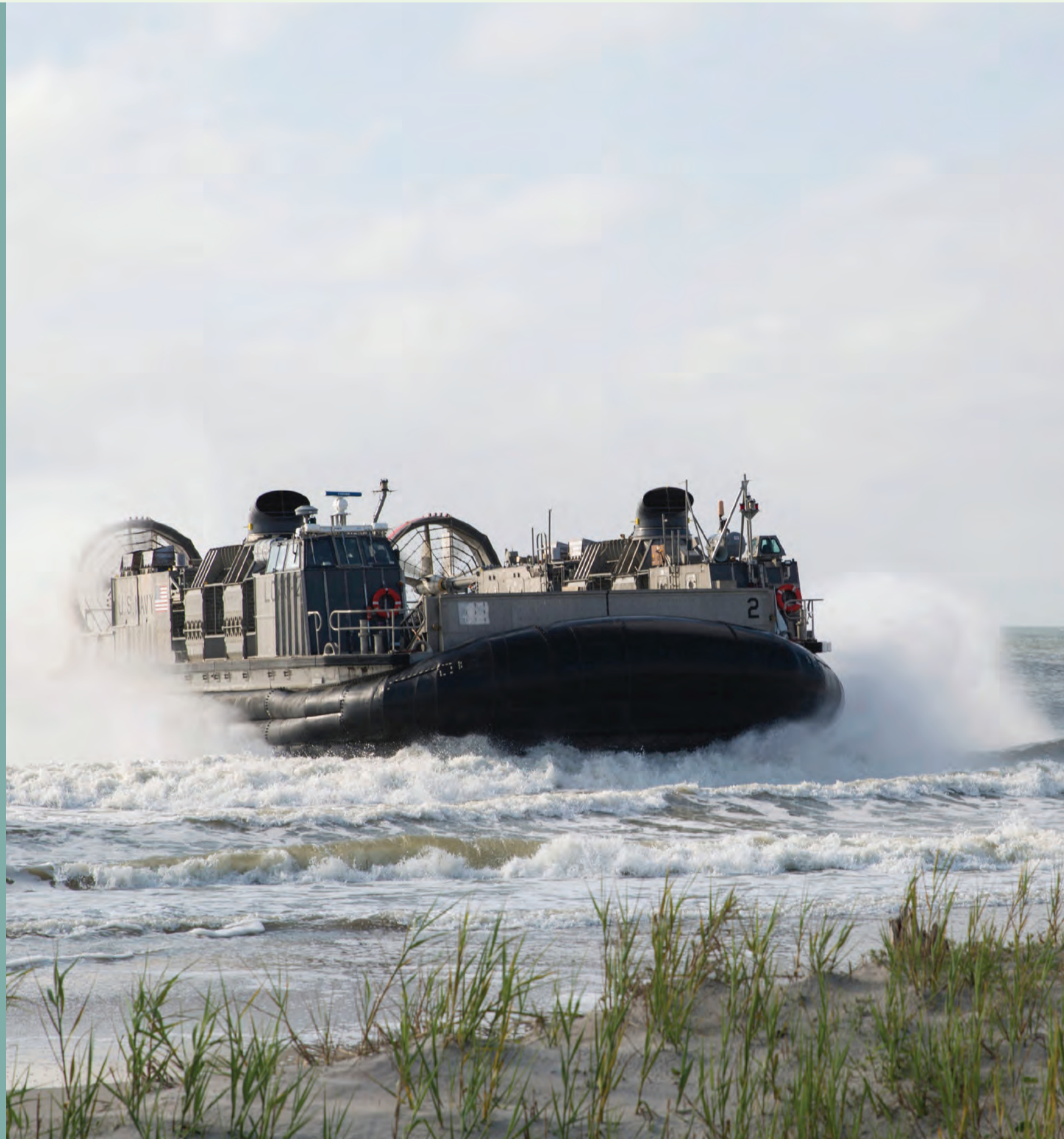
Rising sea levels and increasingly severe storms are among the climate-related risks to DoD natural resources that can affect the ability of installations to support training and testing (Marine Corps Base Camp Lejeune).