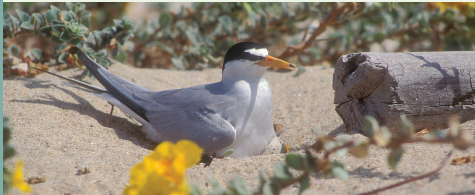
Photo below: Climatic changes, including sea-level rise and intensified coastal storms, may complicate installation efforts to manage threatened and endangered species such as the California least tern.

Cover: Heightened wildfire risks from climatic changes, such as warmer temperatures and prolonged drought, can result in restrictions on live-fire training and testing (Joint Base Elmendorf-Richardson).