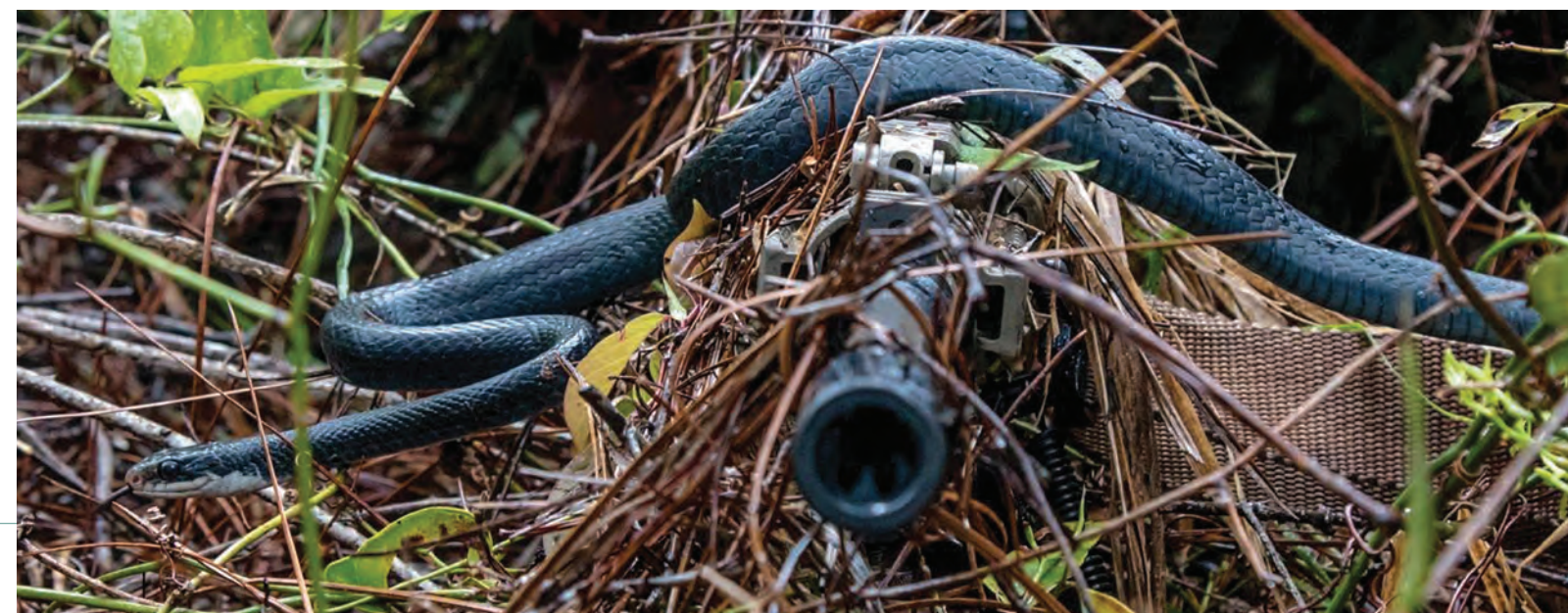
Southern black racer and camouflaged sniper (Eglin Air Force Base).