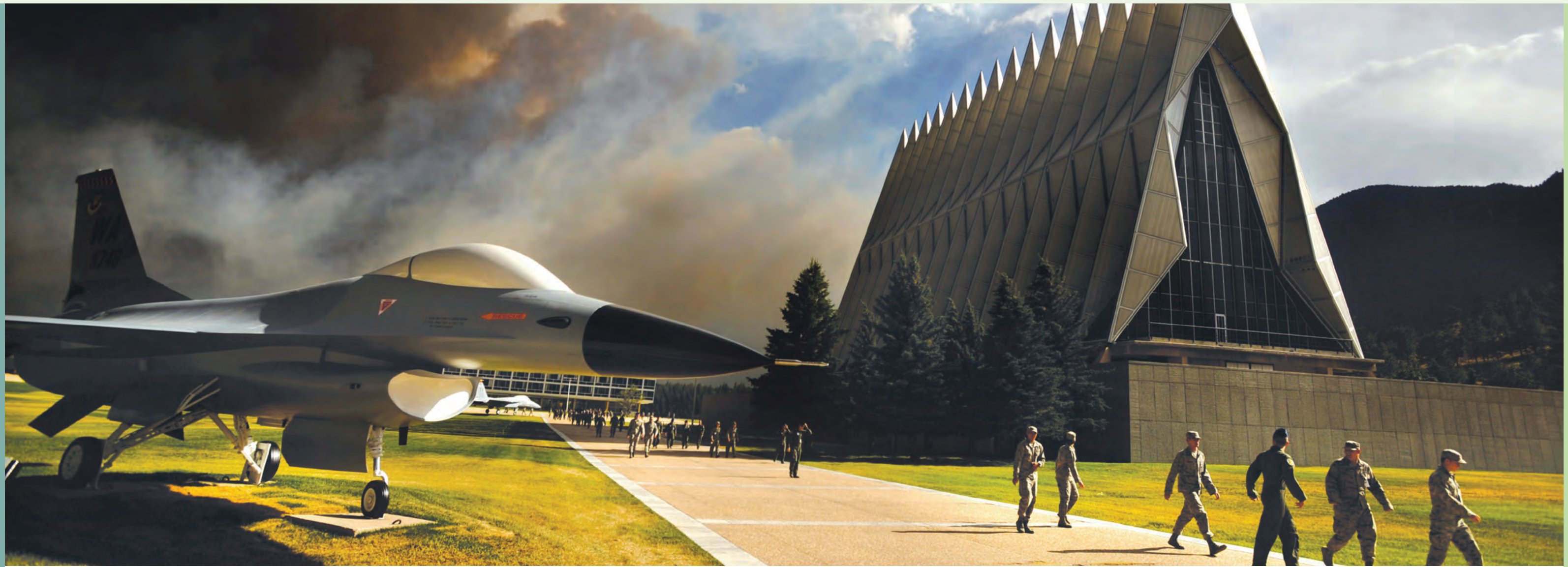
Incorporating climate considerations into INRMPs helps ensure installation sustainability and military readiness by preparing for growing climate-related risks (U.S. Air Force Academy).