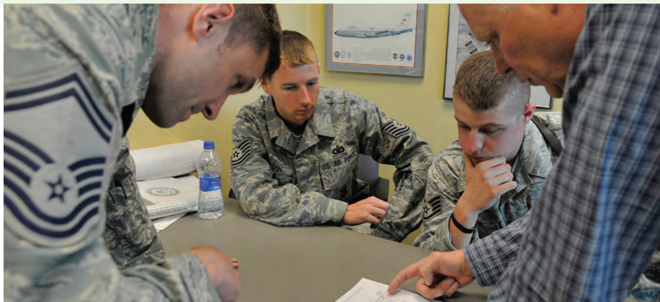
Asking the right questions is key to successful adaptation planning.