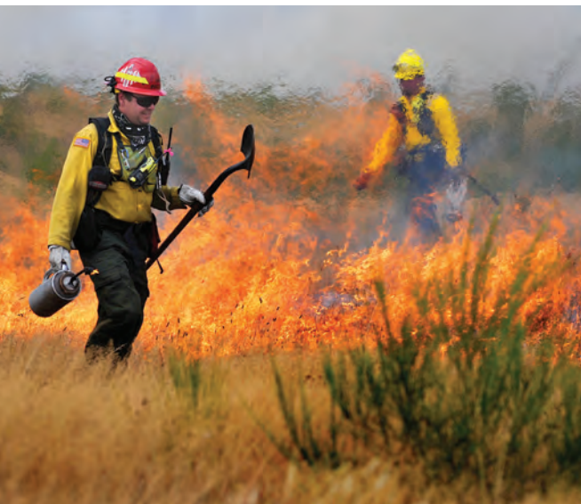
To reduce climatic risks, adaptation will often require proactive management, including expanded use of prescribed burns (Joint Base Lewis-McChord).

Climatic changes already are disrupting key biological processes and can affect traditional land uses and management activities.