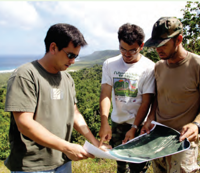
INRMPs are the foundational documents for installation natural resource management (Andersen Airforce Base, Guam).