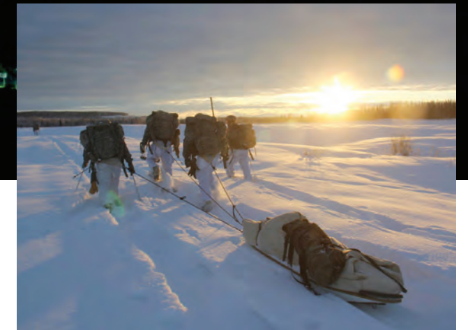
Rapidly melting permafrost in Alaska is transforming arctic ecosystems and destabilizing infrastructure and installation assets (Yukon Training Area, Fort Wainwright).