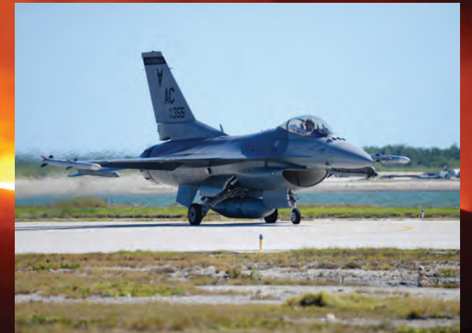
Rising sea levels pose a risk to operations and wildlife at low-lying installations such as Naval Air Station Key West.

Regulatory Compliance and Restrictions. A changing climate may complicate or impede regulatory compliance, such as endangered species conservation and wetlands protection, resulting in increased costs and/or training restrictions. An impaired ability to meet regulatory requirements could compromise the capacity to use certain lands and waters for operations and training.