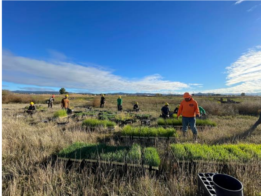
Figure 6: Adding diverse species mix of grasses, forbs, and shrubs - including native milkweed and other pollinator friendly plants to Ochoco Preserve restoration area.