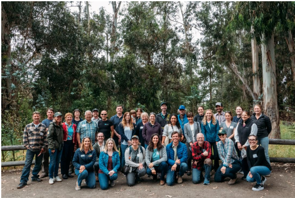
Figure 2: Western Monarch Overwintering Science Meeting participants at the Pismo overwintering grove in May 2023.

Planned and led a Western Monarch Overwintering Science Meeting (including multiple DoD representatives) to identify high priority research areas. A report on the meeting is available here: https://xerces.org/publications/fact-sheets/western-monarch-overwintering-science-priority-themes .