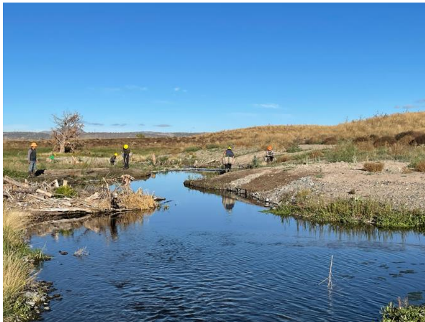
Figure 7: Phase 1 Floodplain restoration at Ochoco Preserve, near Prineville, OR.