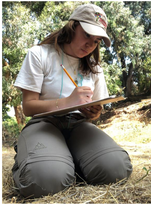
Figure 5: EFTA intern participating in the Monarch monitoring program.

In FY2023 EFTA recruited and placed four interns in California. They also began building their program east of the Rockies, especially along the I-35 corridor, where interns will be placed in FY2024.