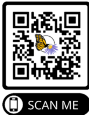
Figure 3: 2023 Monarch/Pollinator Information Form for pollinator stakeholders distributed to DoD natural resource managers.