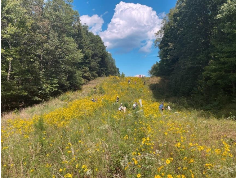
Figure 4: Pollinator habitat at Naval Air Station Patuxent River (NAVAIR), the location of an Integrated Monarch Monitoring Protocol (IMMP) workshop.