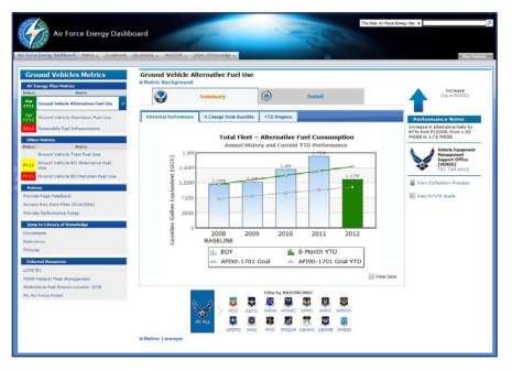
Ground Vehicles Metric page example