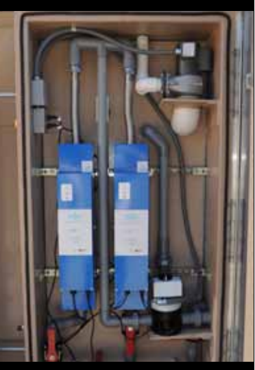
Ultraviolet disinfection unit