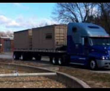
Transportation of technology to demonstration site