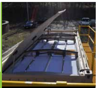
Secondary treatment unit with open access to textile filters