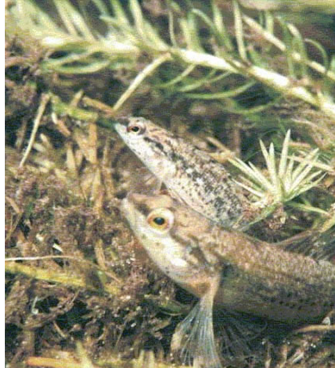
The Okaloosa Darter inhabit cool to warm, small to moderate size streams, 1.5 to 2.0 meters wide, in depths ranging 4 centimeters to 1.5 meters. Immature aquatic insect larvae comprise the bulk of this species' diet, principally midges, mayflies, and caddisflies.

The fish blends into its habitat to defend itself from predators. Once vegetation dies, the darter dies, too. The Air Force says the degradation of the darter's habitat began long before Eglin existed. But major degradation came with the military's arrival in the mid 1930s. Dirt roads cutting through the forest and more than 100 clay pits to provide material for those roads led to erosion and a buildup of silt in streams, eliminating crucial plant life.