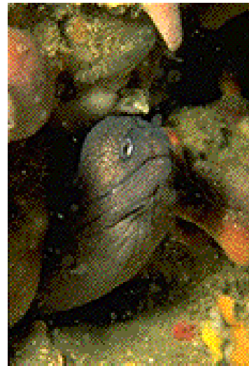
The Reticulated Moray Eel, Muraena retifera .

Morays are carnivorous and feed primarily on other fish, cephalopods, mollusks, and crustaceans. Groupers, other morays, and barracudas are among their few predators. There is a commercial fishery for several species, but some have been known to cause ciguatera fish poisoning.