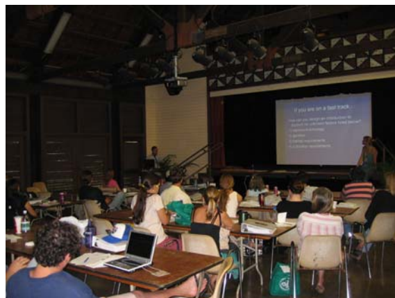
The workshop was well received by the many participants that span backgrounds in several fields.

The Center for Plant Conservation, with botanists nationwide, offered the DoD Legacy Program Sponsored workshop covering key conservation topics. Participants received pragmatic tips, information resources, direct contact with experts in the classroom, and an opportunity to get questions answered by experts in the field. The workshop was well received by the many participants that span backgrounds in several fields.