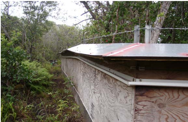
Army Garrison Hawaii’s “snail jail”

The Center for Plant Conservation, with botanists nationwide, offered the DoD Legacy Program Sponsored workshop covering key conservation topics. Participants received pragmatic tips, information resources, direct contact with experts in the classroom, and an opportunity to get questions answered by experts in the field. The workshop was well received by the many participants that span backgrounds in several fields.