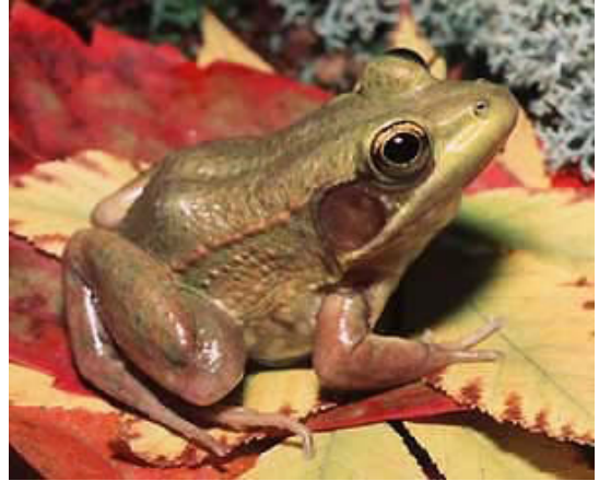
The Florida bog frog ( Rana okaloosae ) can be found at Eglin AFB.

There are frogs that chirp, others can whistle, croak, ribbit, peep, cluck, bark and grunt. They have a small sac in their throats that vibrates the air as they slowly let it out. When male frogs are ready to mate they will ‘call’ out to the female frogs. Each different species of frog has their own special sound and that is the sound that the same species of female frog will answer to. Some frogs are so loud they can be heard a mile away! After they meet, they find a suitable spot to mate and lay their eggs. The male frog will hug the female from behind and as she lays eggs, usually in the water, the male will fertilize them. After that the eggs are on their own, to survive and become tadpoles. There are a few species of frogs that will look after their babies, but not many.