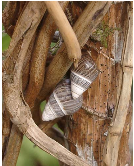
Achatinella mustelina , residents of the “snail jail”

species, and nine endangered plant species. The day began with a hike up the ridge-line to the management unit. Along the way the attendees were able to see what the Hawaii staff terms a “snail jail”. The native Achatinella genus as a whole is endangered because rodents and non-native cannibal snails prey on the species. In order to keep the snails safe, the Army builds enclosures to keep the bad guys out. The enclosures include a salt trough to keep the cannibals from crawling up the walls into the fence and just in case they get past that, an electrically charged wire to zap them should they reach the top! Attendees were also shown numerous outplanting sites which roused lively discussions regarding how to protect these much imperiled species from all the different threats. The day was a great team building experience for everyone attending the CPC class and got their brains ready for an intensive week of training in plant conservation.