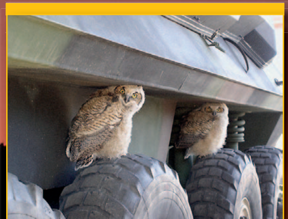
The 3rd Light Armored Reconnaissance Battalion found these two great horned owls after they fell out of their nest during a severe wind storm. Staff found the two juvenile owls sitting on the tires of the LAV sheltering from the day's high winds. The owls were taken to the Coachella Valley Wild Bird Center for Rehabilitation and, after a few weeks, were returned to the Marine Air Ground Task Force Training Command and released where they were found.

DOD IS RESPONSIBLE FOR MANAGING AND PROTECTING OVER 420 FEDERALLY-LISTED SPECIES AND OVER 500 SPECIES AT-RISK.