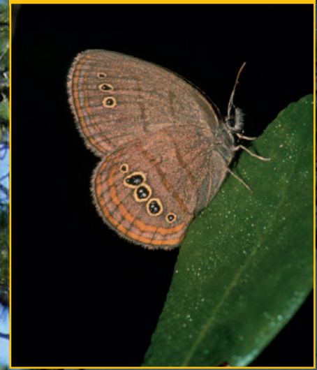
The Saint Francis satyr butterfly is endemic to Fort Bragg, NC. The Army's longleaf pine stewardship initiatives help support this endangered butterfly, while protecting important training areas that enable the military mission.