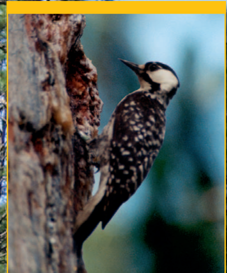
Photo courtesy of the U.S. Fish and Wildlife Service. The red cockaded woodpecker (RCW) requires longleaf pine habitat, and is the only woodpecker known to create cavities in live trees that are more than 80 years old. DoD has spent $144.7 million since FY 1993 to ensure continued military access to RCW habitat, reduce training restrictions, and create and link habitat corridors to promote healthy RCW population numbers in the future.