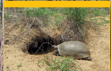
The gopher tortoise is a keystone species found on military lands in the southeastern United States. They are known to produce large burrows that provide shelter and food for over 300 different species. By protecting gopher tortoise habitat, DoD keeps important training lands open and accessible for maneuvers.