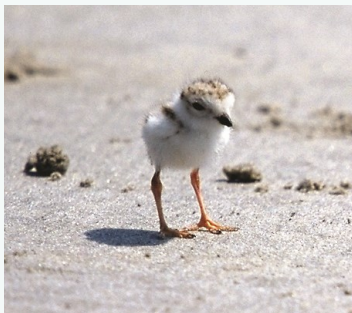
Outdoor cats can kill rare species such as this piping plover chick.