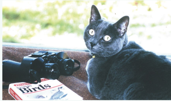
An indoor cat is a safe and happy cat.