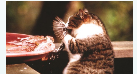
Cat killing a yellow-rumped warbler at a bird bath.